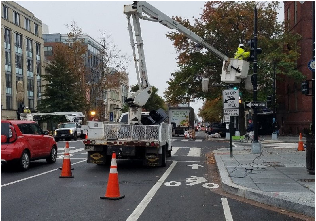
FMCC splicing cables at 14 th & Q St