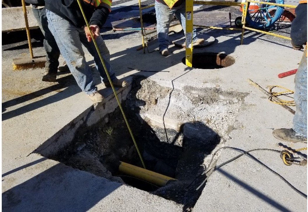
Pepco feeder location exposed by Omni at 14 th & Q St