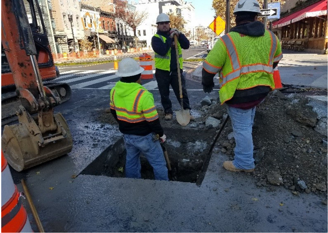
Trench for Pepco feeder location P05 at Q St