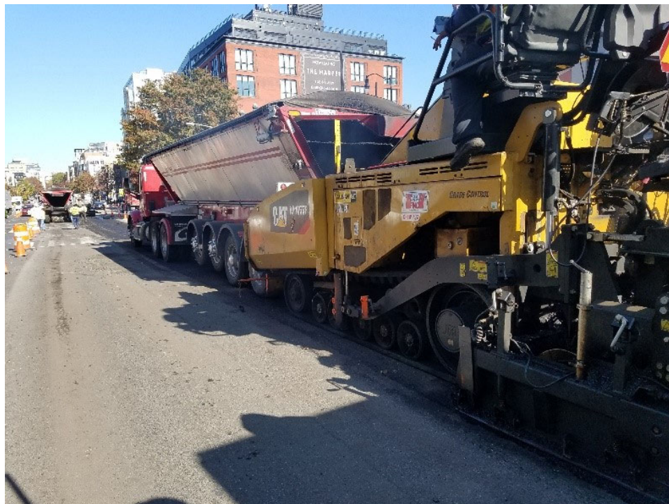
Asphalt loaded from dump trucks