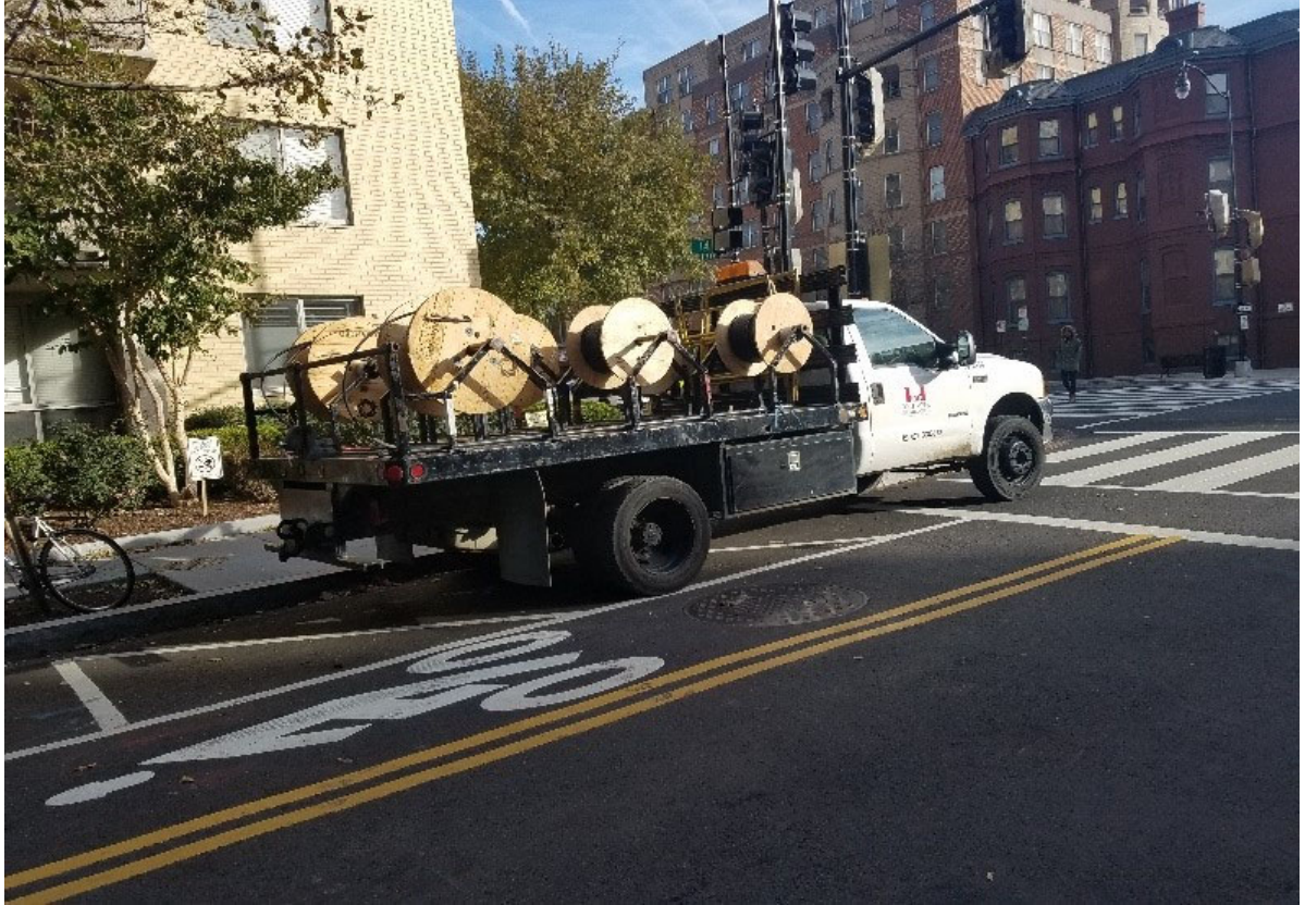
FMCC Electrical Crew at installing cable at NWC of 14 th & N St