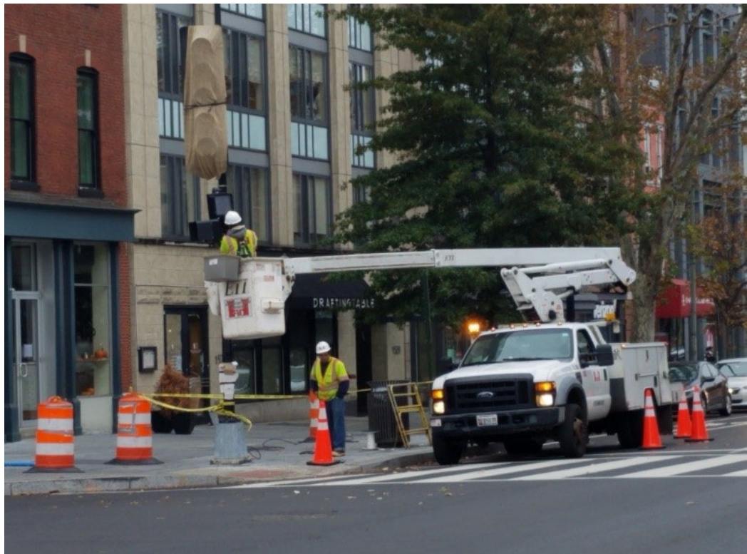
FMCC electrical crew adjusting signals at Q St