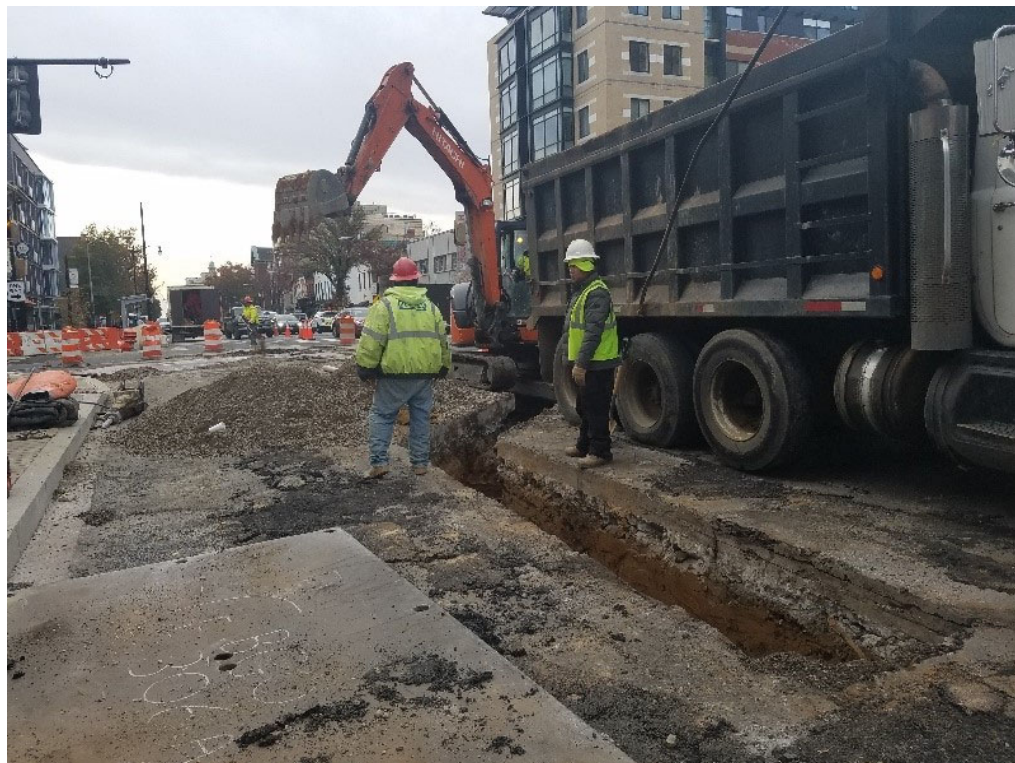
Backfill underway at electric trench by Omni Excavators