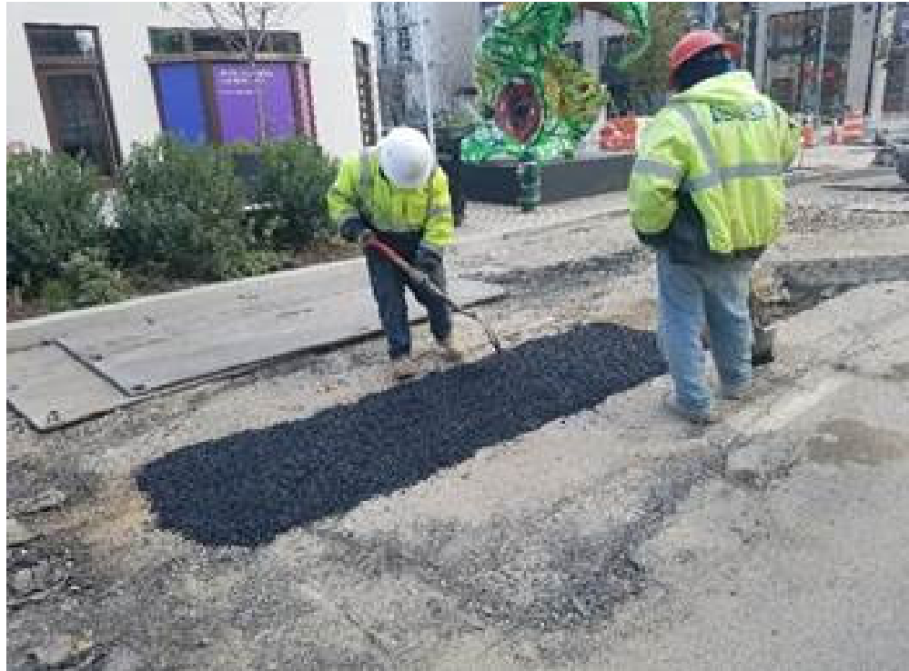
Temporary asphalt placed atop electric trench .