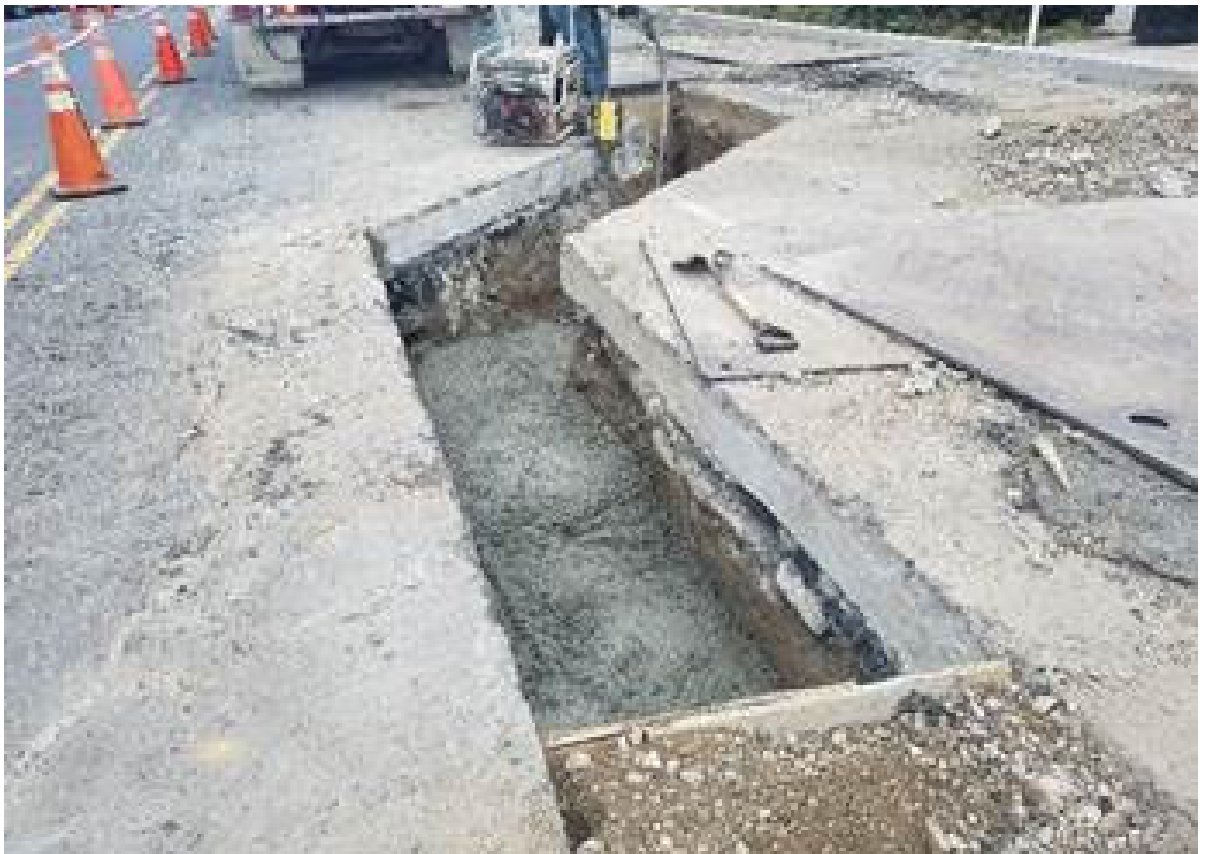
4" PVC conduit encased by Omni near C36