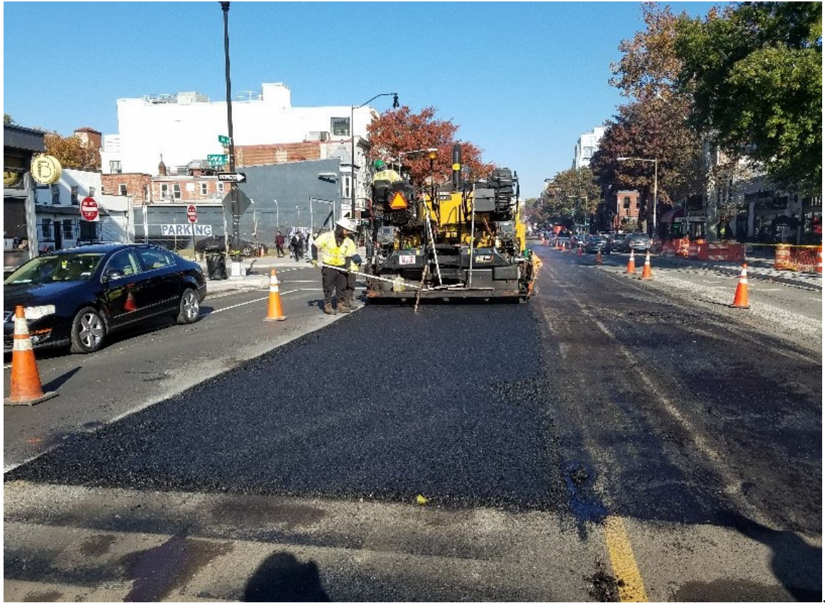
FMCC paving SB 14 th St left lane