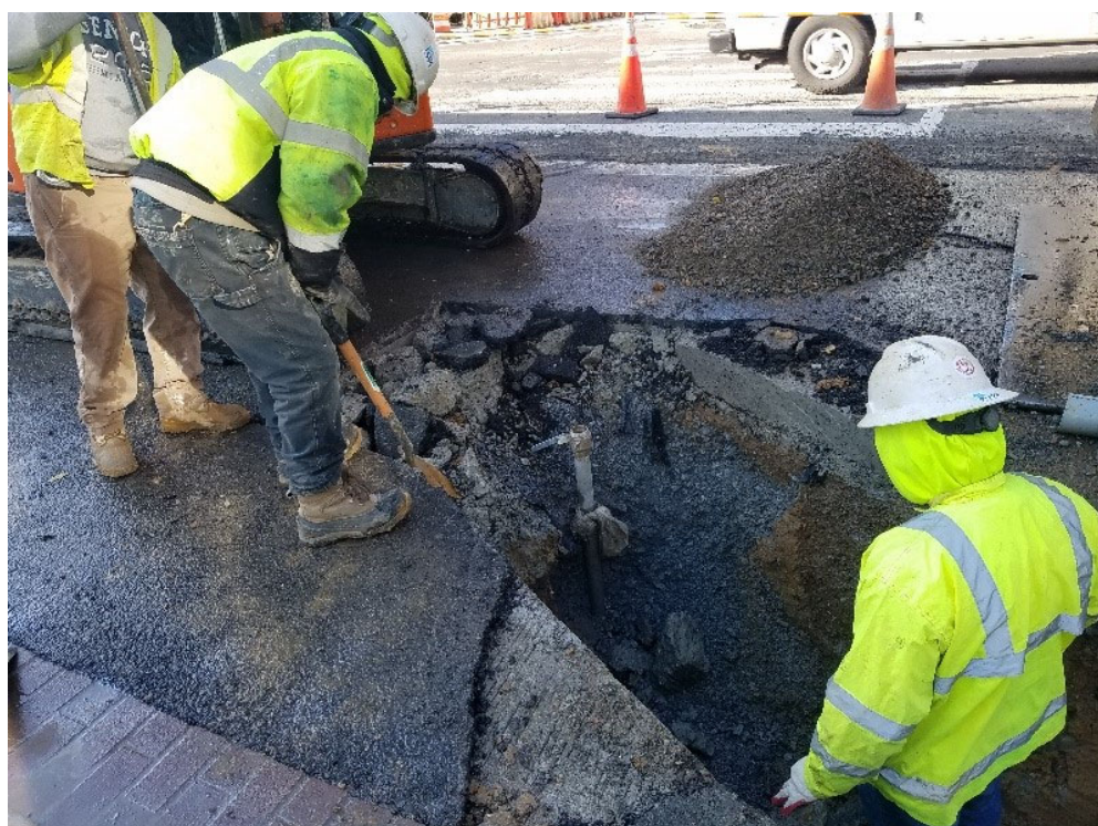
Omni exposing water main at SEC of 14 th & R St