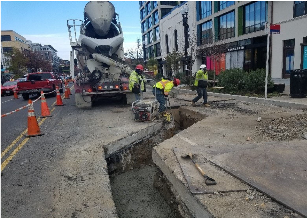
Vibrator used during encasement of PVC conduit

Project Website: www.14thstreetproject.com