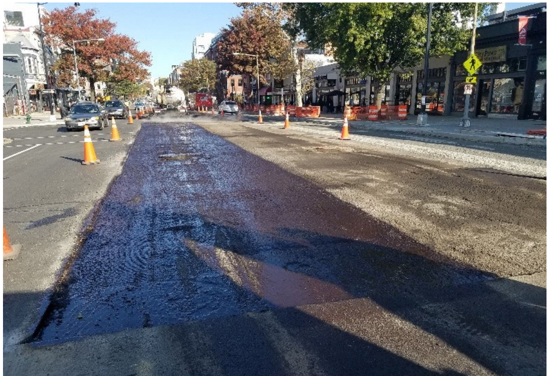
Tack coat placed at 14 th St northbound left lane near Swann St