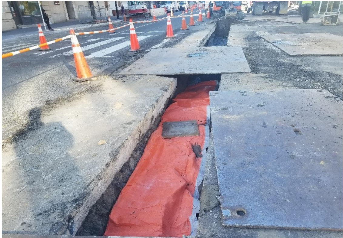
4" PVC conduit placed from previously installed from C36 to M49.