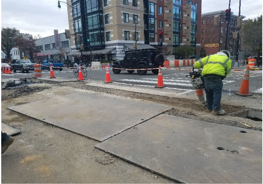
Compaction by Omni at NEC of 14 th & R St