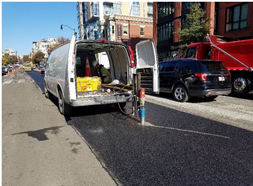
Asphalt core samples taken by asphalt technician