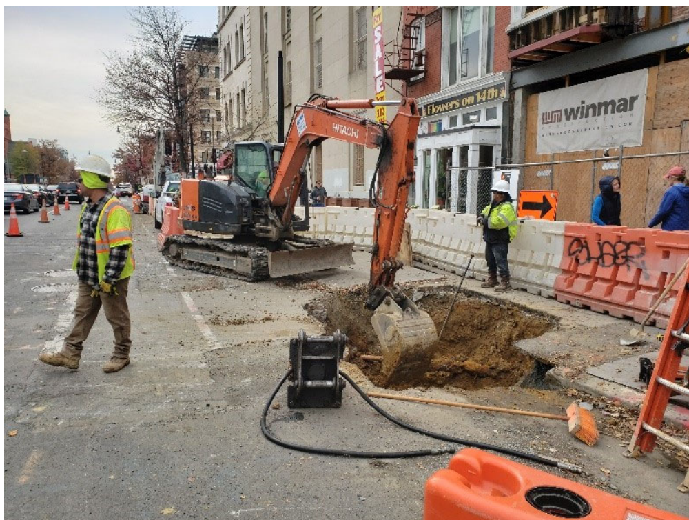
Omni excavating in front of Riggs but not furnished any conduits.