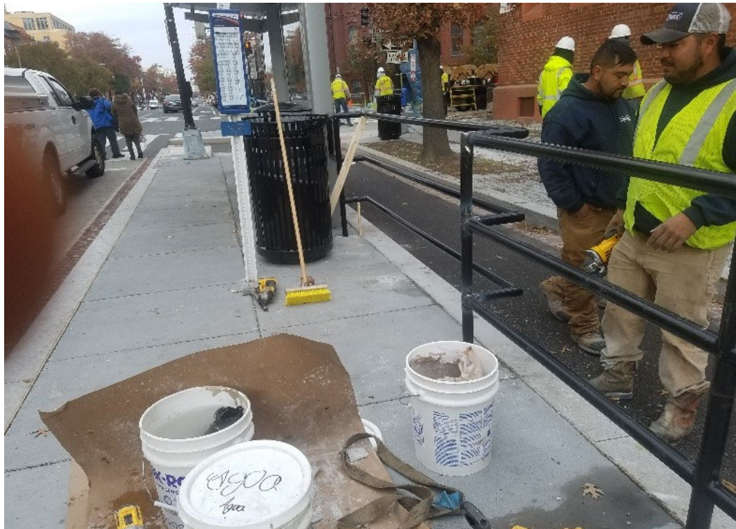
Pipe handrail adjusted at 14 th & N St northbound