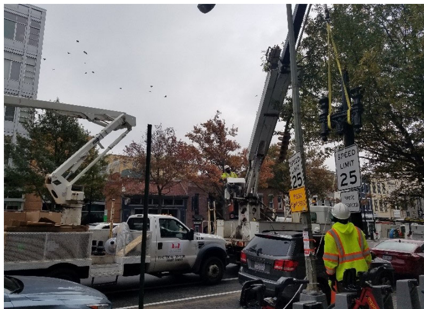
Installation of L119 fixture top by FMCC Electrical crew