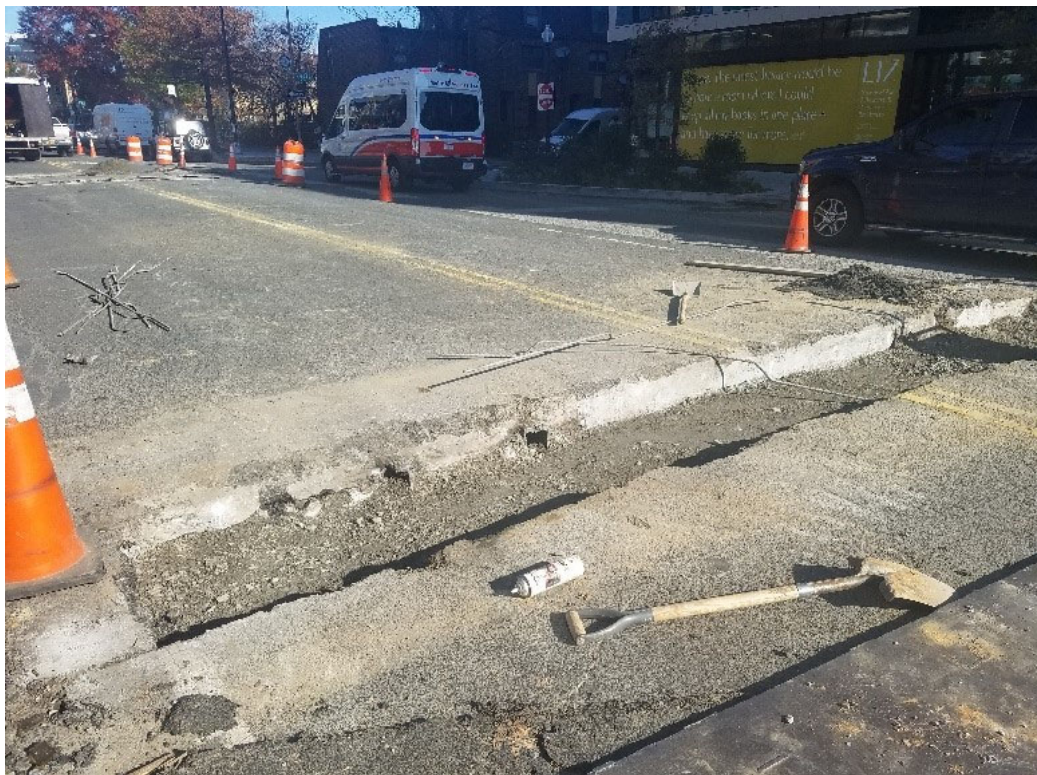
Omni preparing trench & R St