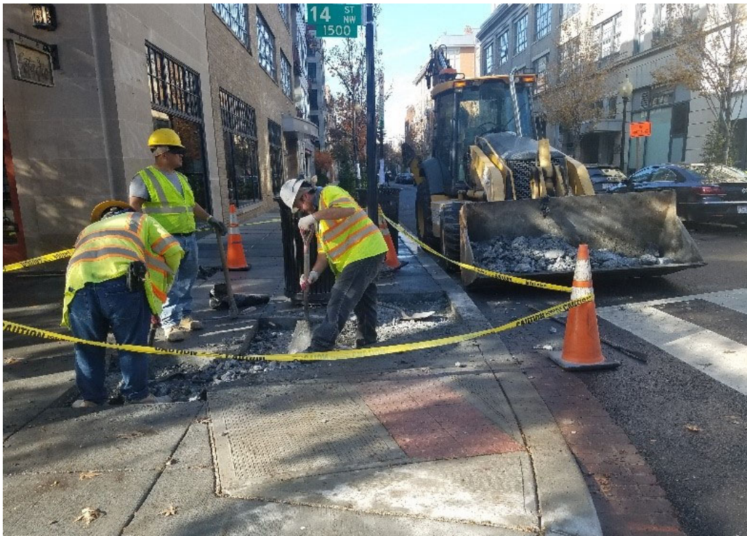
Sidewalk repair by D.E.N. at 14 th & Church St