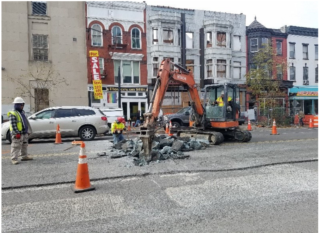
Excavation of trench for light pole L63 PVC conduit