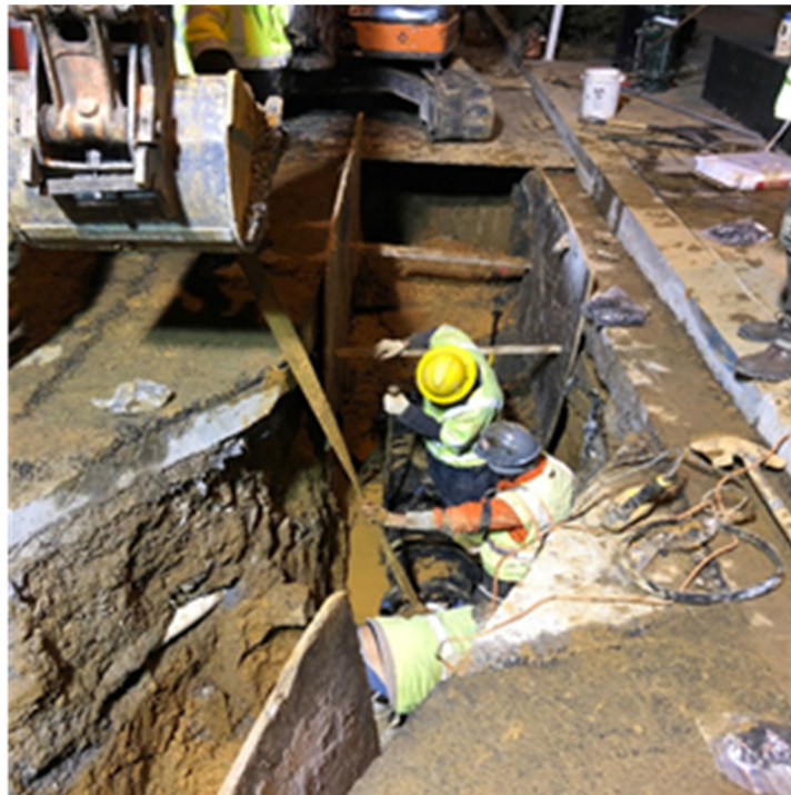
Alignment of watermain