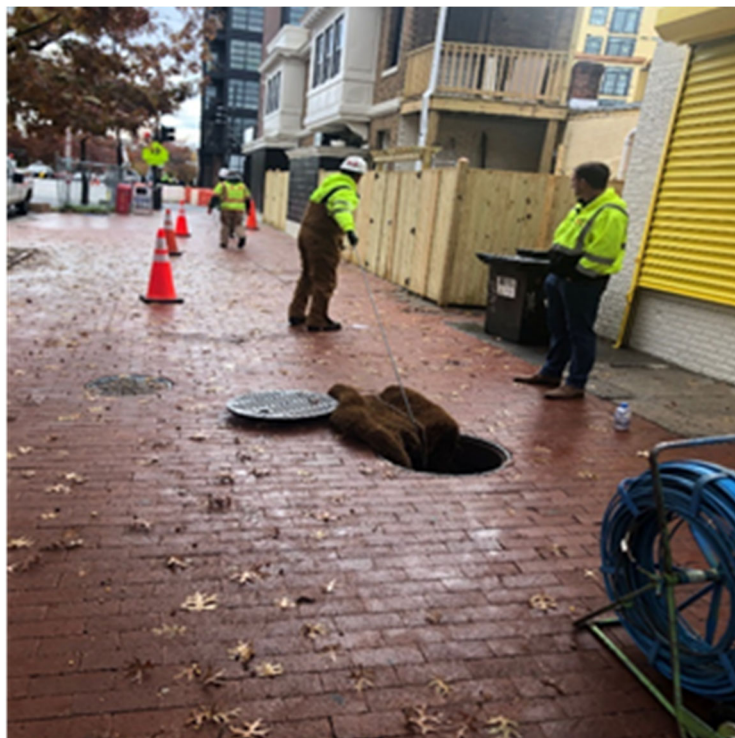
Fiber Optic cables being pulled along Florida Ave