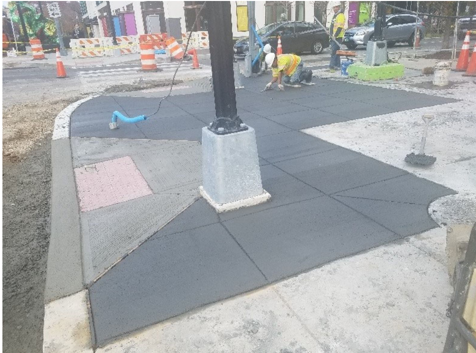
PCC sidewalk placed at SEC of 14 th & R St by D.E.N.