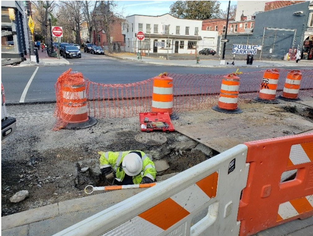
Omni is excavating in Swan to prepare furnishing conduits