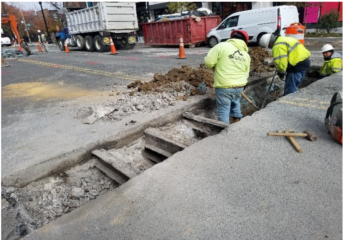
View of existing streetcar tracks at trench to be removed by Omni