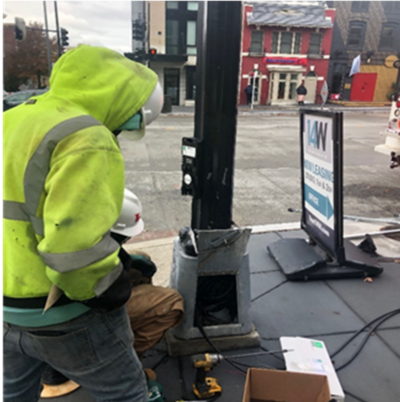
Pedestrian Push button system