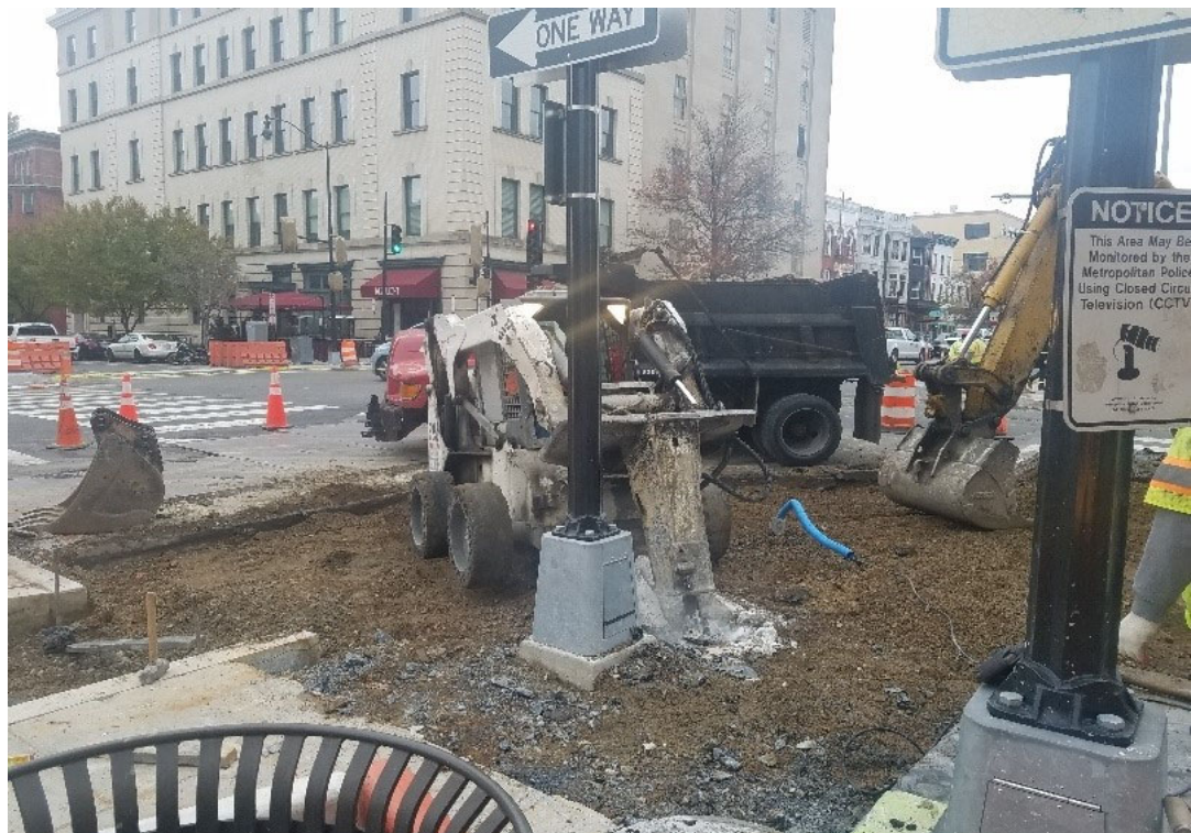
SEC of 14 th & R St demolition of sidewalk by D.E.N.