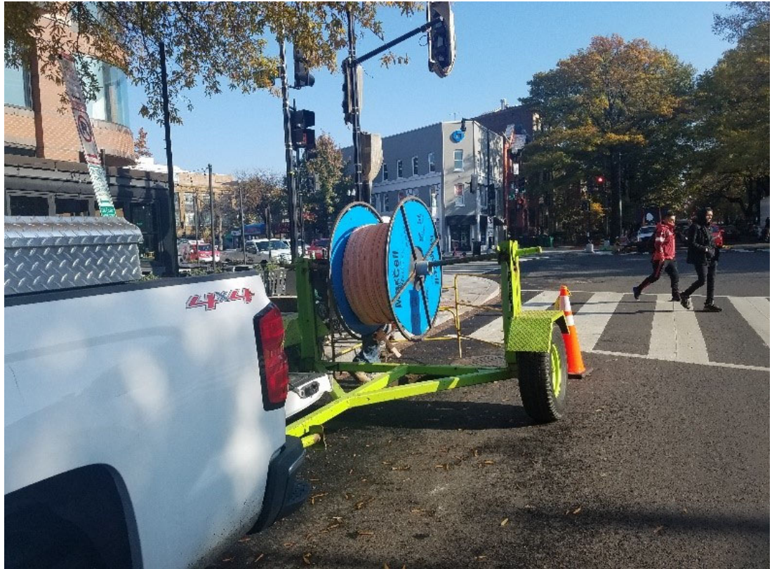
Pulling of cable wire from 14 th to 15 th St at RIA