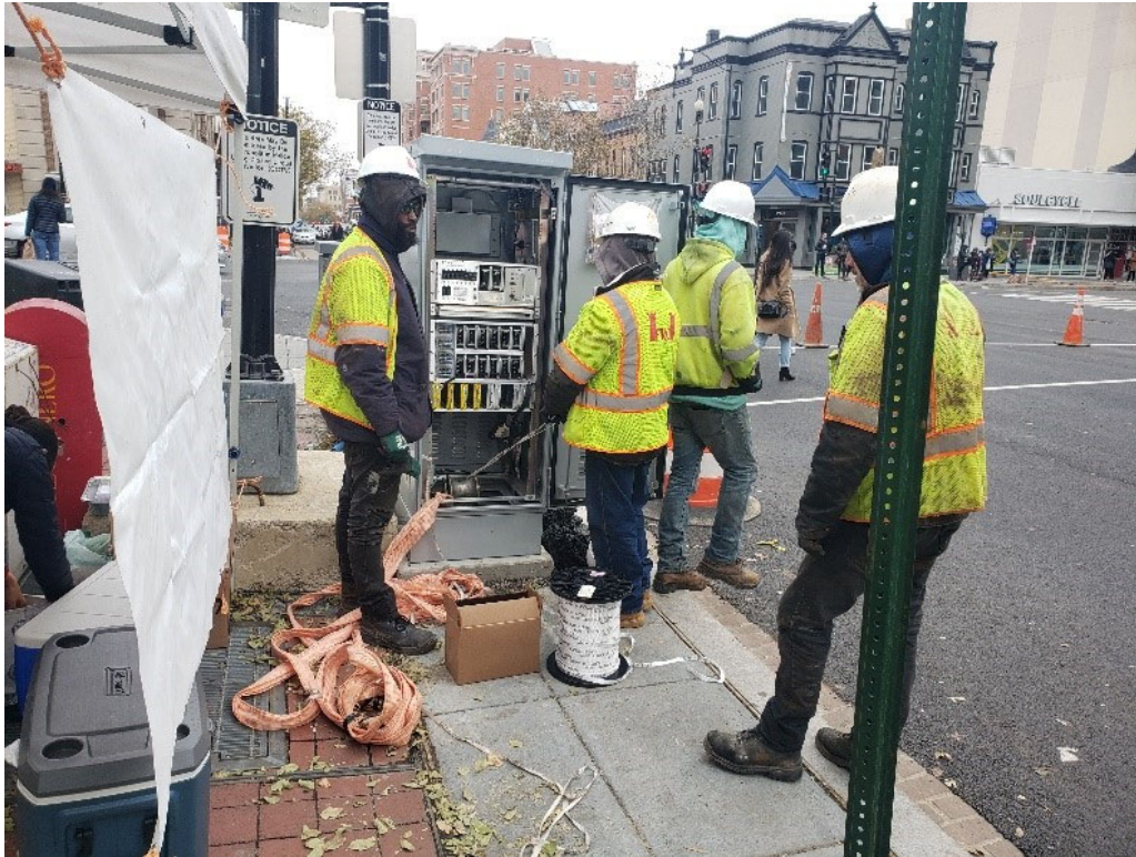
Pulling cable to Traffic Cabinet at NW corner of U street