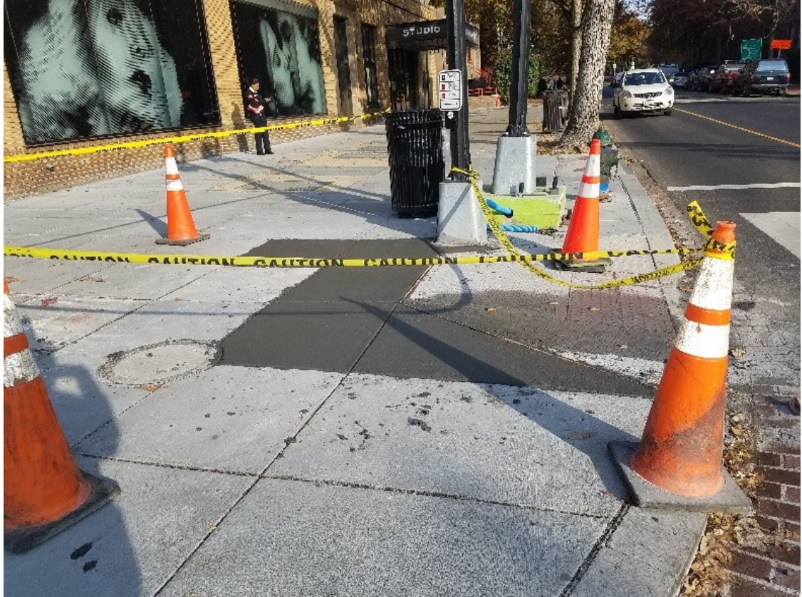
Sidewalk repair at NEC of 14 th & P St