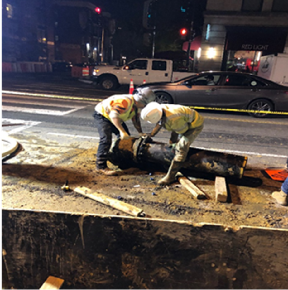
Iron Pipe saw cuts