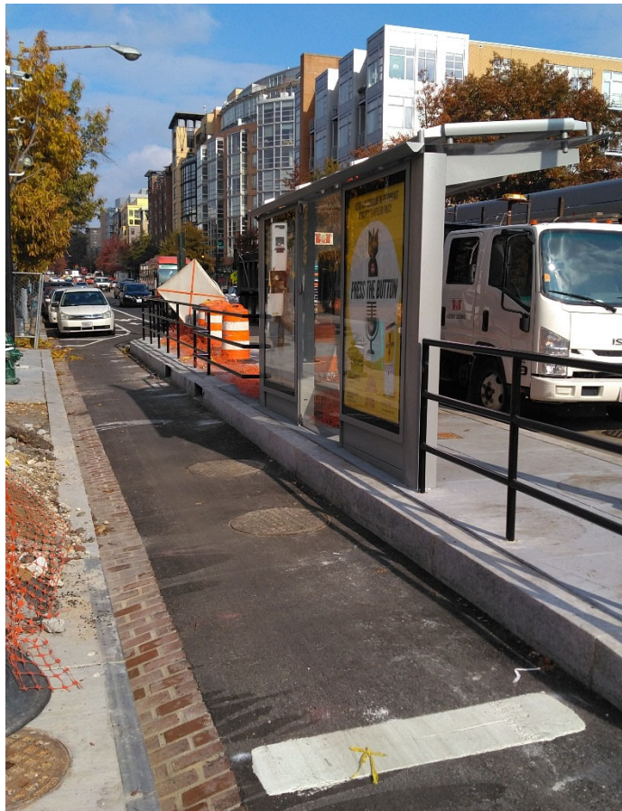
Bus Island handrail at T street completed by Long Fence

Project Website: www.14thstreetproject.com