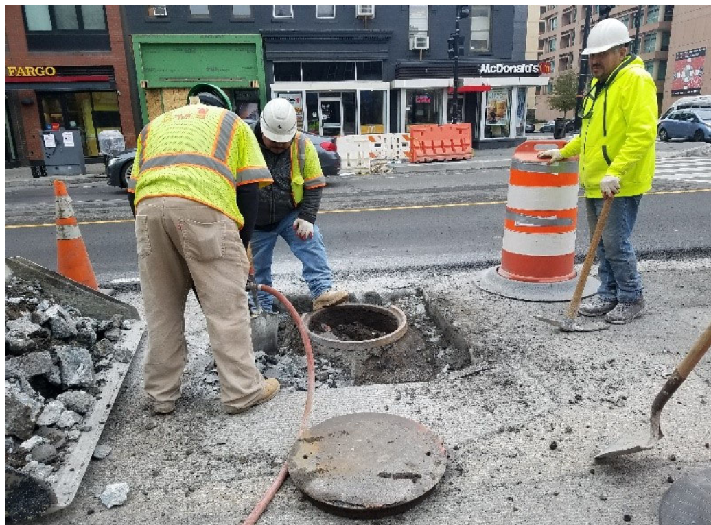
FMCC removing abandoned manhole top at 14 th & U St