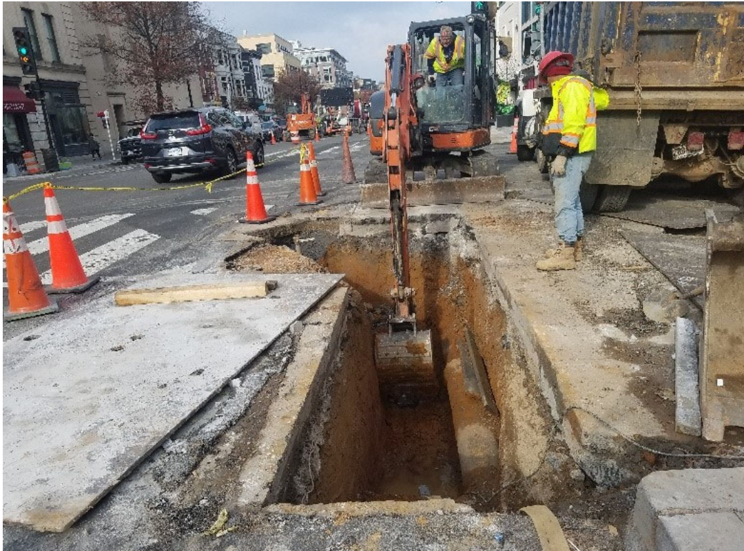
Omni preparing for water main tie-in at NEC of 14 th & R St