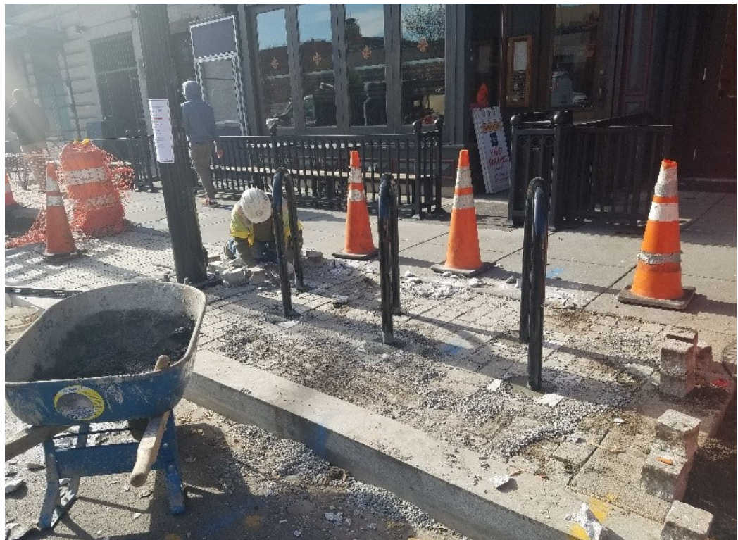
Installing Bike racks