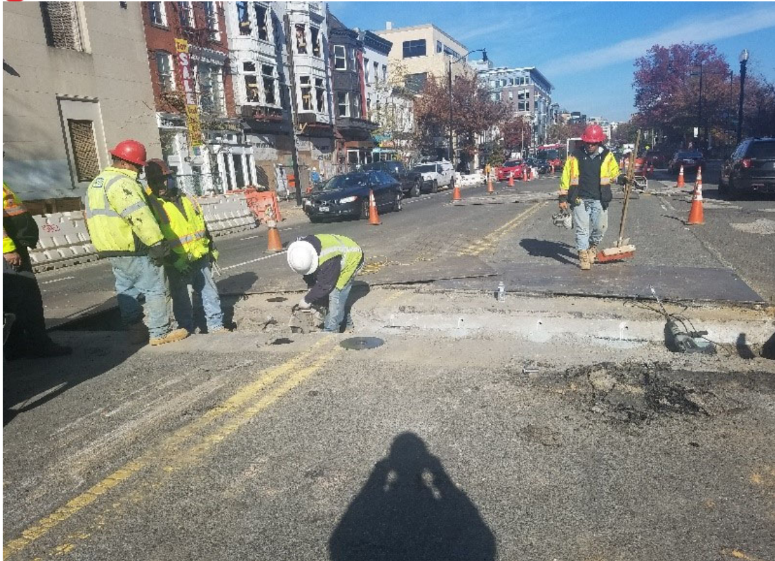
Omni exposing rail ties