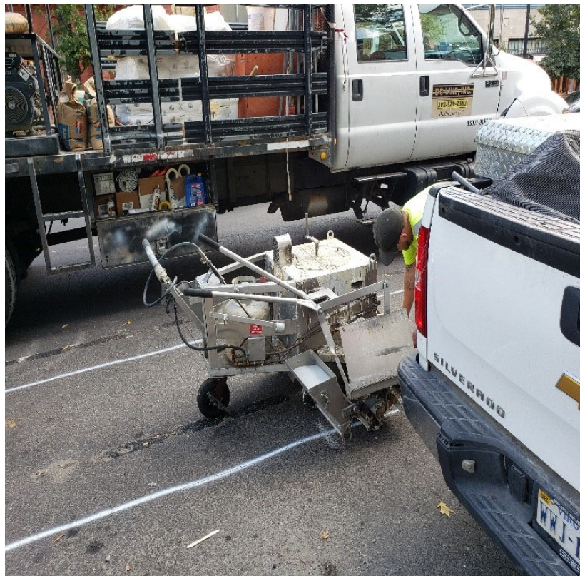
DC Line crew removed Old Street and Bike Path Markings & Then replaced with Permanent Markings, on Thurs. 10-3-2019 between N St. and R.I. Ave. NW on 14 th St. NW.