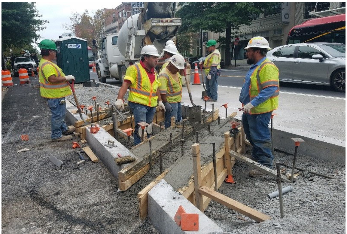
Sidewalk interceptor drain concrete channel placed by FMCC