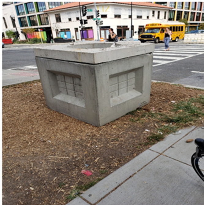
OMNI Inc. laid out the location for this Precast (4'X4'X4') Traffic Signal Manhole to be placed at the Sidewalk at SWC of R St. & 14 th St. NW Intersection the next day.