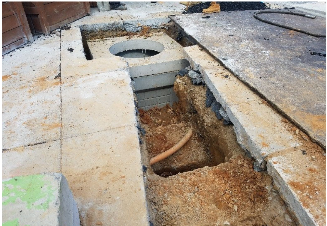
New gas line show near new M46 manhole.