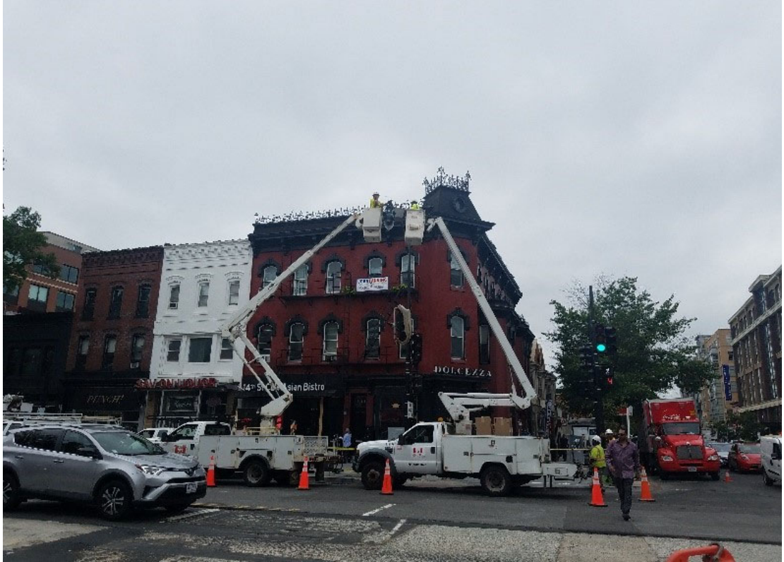
SWC of 14 th & P St pendant pole jumper cables installed by FMCC