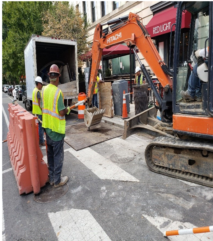
OMNI Inc. crew placed Steel Plate with Cold Patch over the Traffic Signal MH (3'X3'X3') excavation at the Sidewalk at R St. & 14 th St. Intersection at NWC, On Wednesday, 10-2-2019, next to Red Light Restaurant.