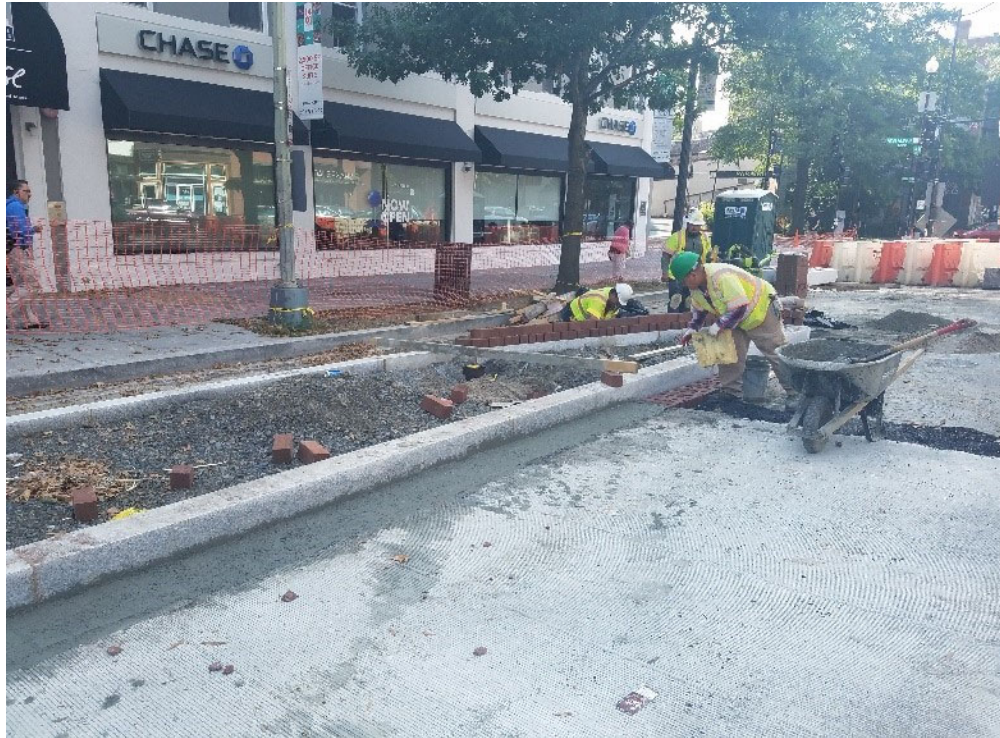
FMCC hardscape crew continued finishing of brick gutter