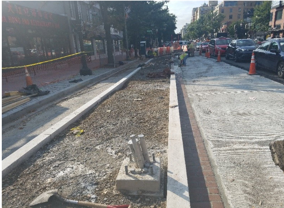
Brick gutter installed at SEC of 14 th & P St directional bus island