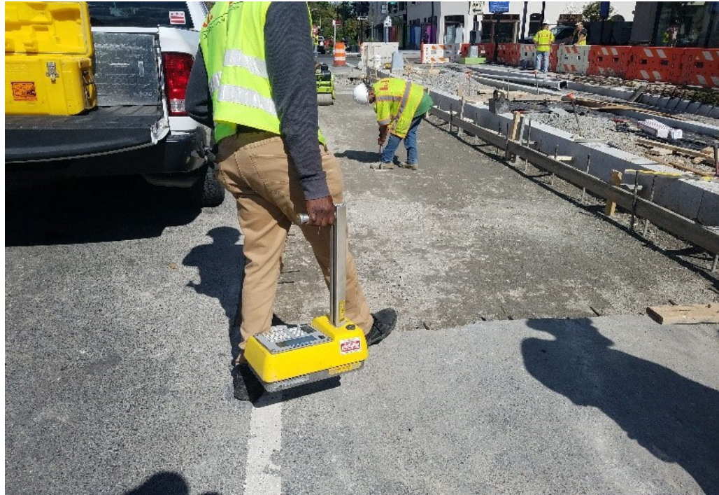
New bus stop pad location ready for density test.