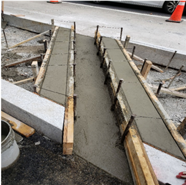
FMCC Concrete poured the Storm Channels, at 14 th St. and P St. for Bus Island at 1502 thru 1508 Blocks of 14 th St. NW.