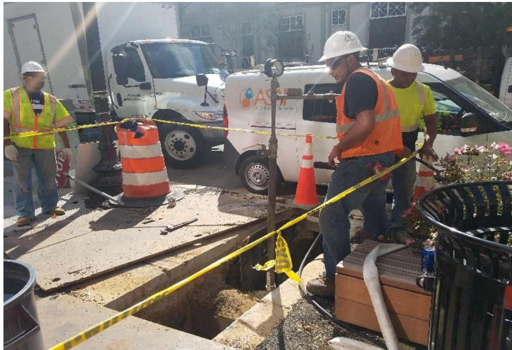
Omni excavators checking pressure gauge at 1357 R St