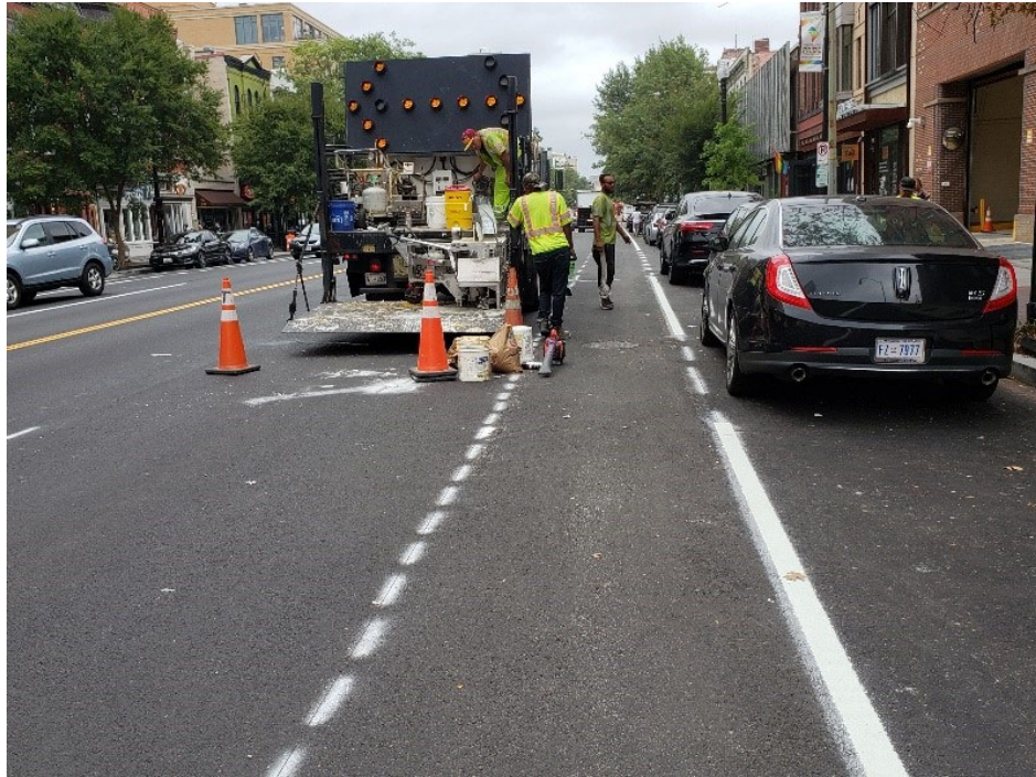
DC Line crew waited periodically on Delivery Trucks which blocked the Bike Paths and Parking Lanes during the Marking operation on Thursday, 10-3-2019.