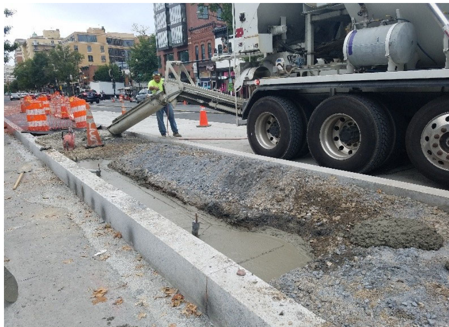
Clear channel contractor placing bus shelter foundation at SEC of 14 th & P St