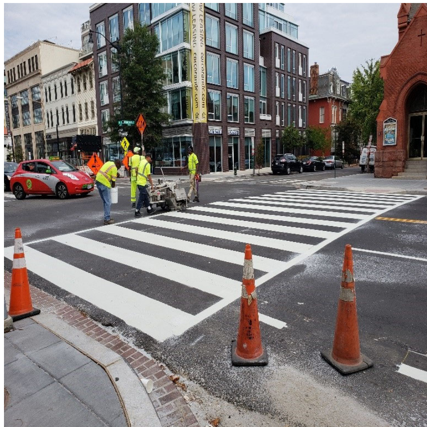
DC Line Inc. Crew placed Permanent Crosswalk markings and Stripes at 14 th St. NW & Corcoran St. NW,