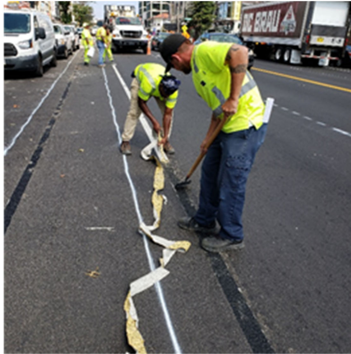
DC Line crew removed Old Street and Bike Path Markings & Then replaced with Permanent Markings.