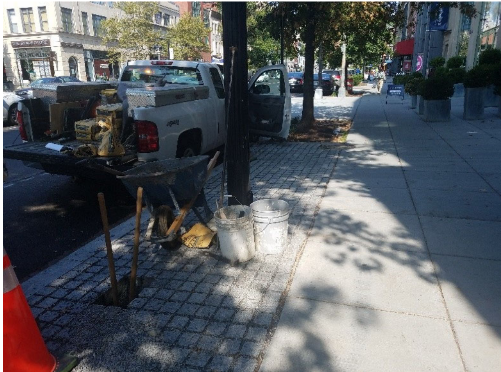
Metal sign post foundation installation by FMCC