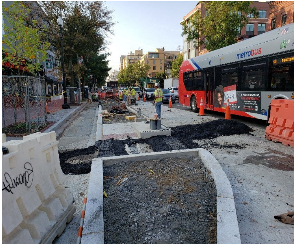
FMCC Concrete crew working on Bus Island at 14 th St.