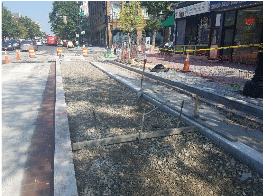
Brick gutter installed at SEC of 14 th & P St directional bus island