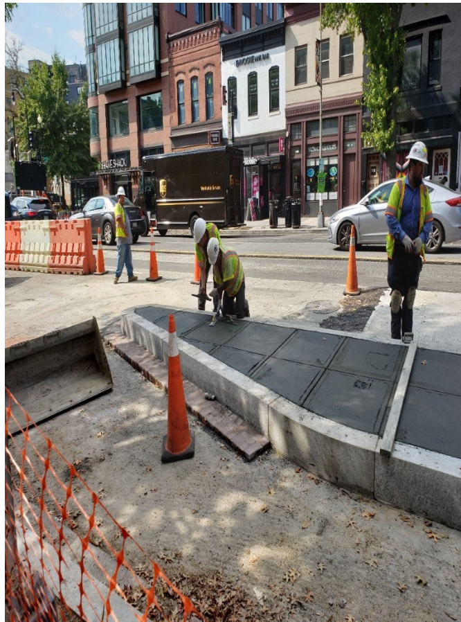
FMCC Concrete Finishers worked on Bus Island after placement of Concrete at Bus Island between R.I. Ave. & P St. NW on 14 th St. NB on Wed. 10-2-2019.