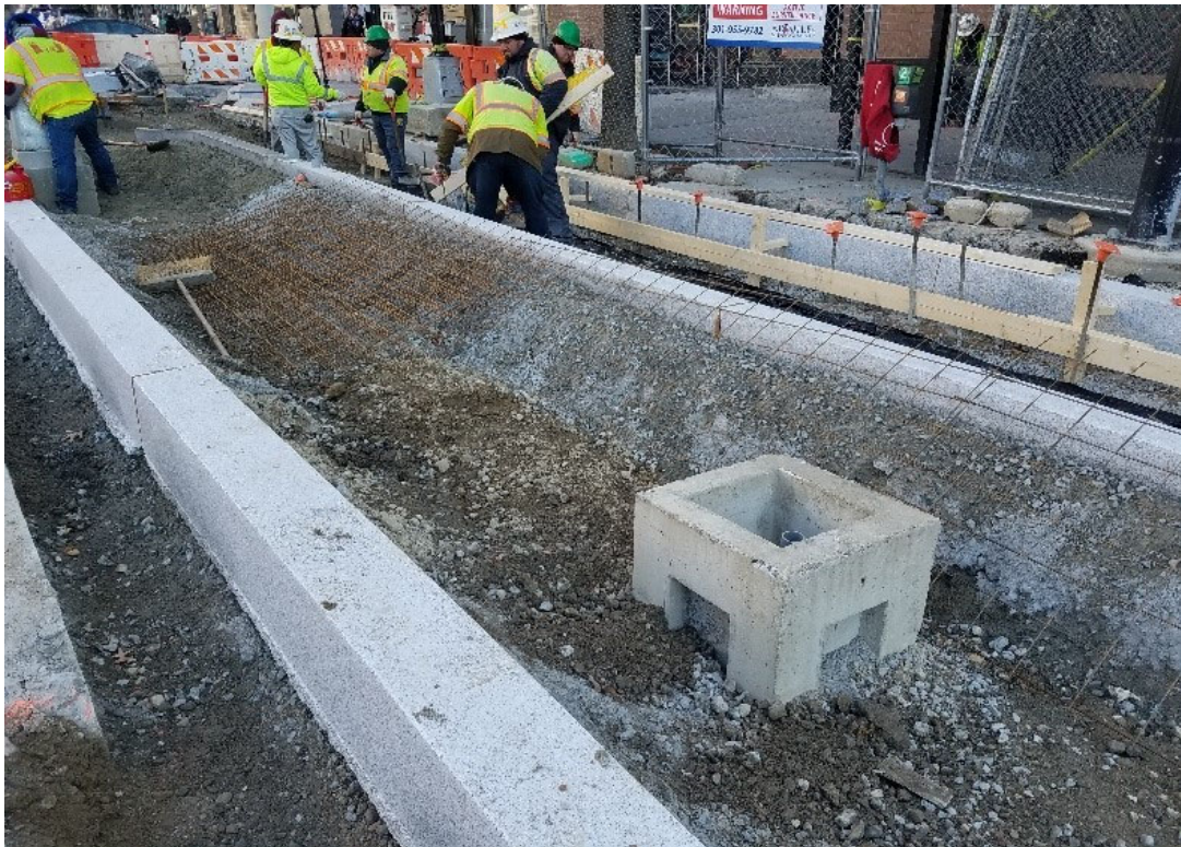
Hand box HB15 and conduit installed by Omni Excavators