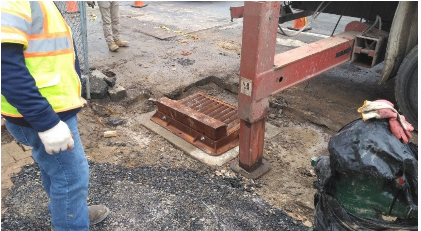
Omni installed the inlet top on the drainage structure at the southwest corner of T Street & 14 th Street NW