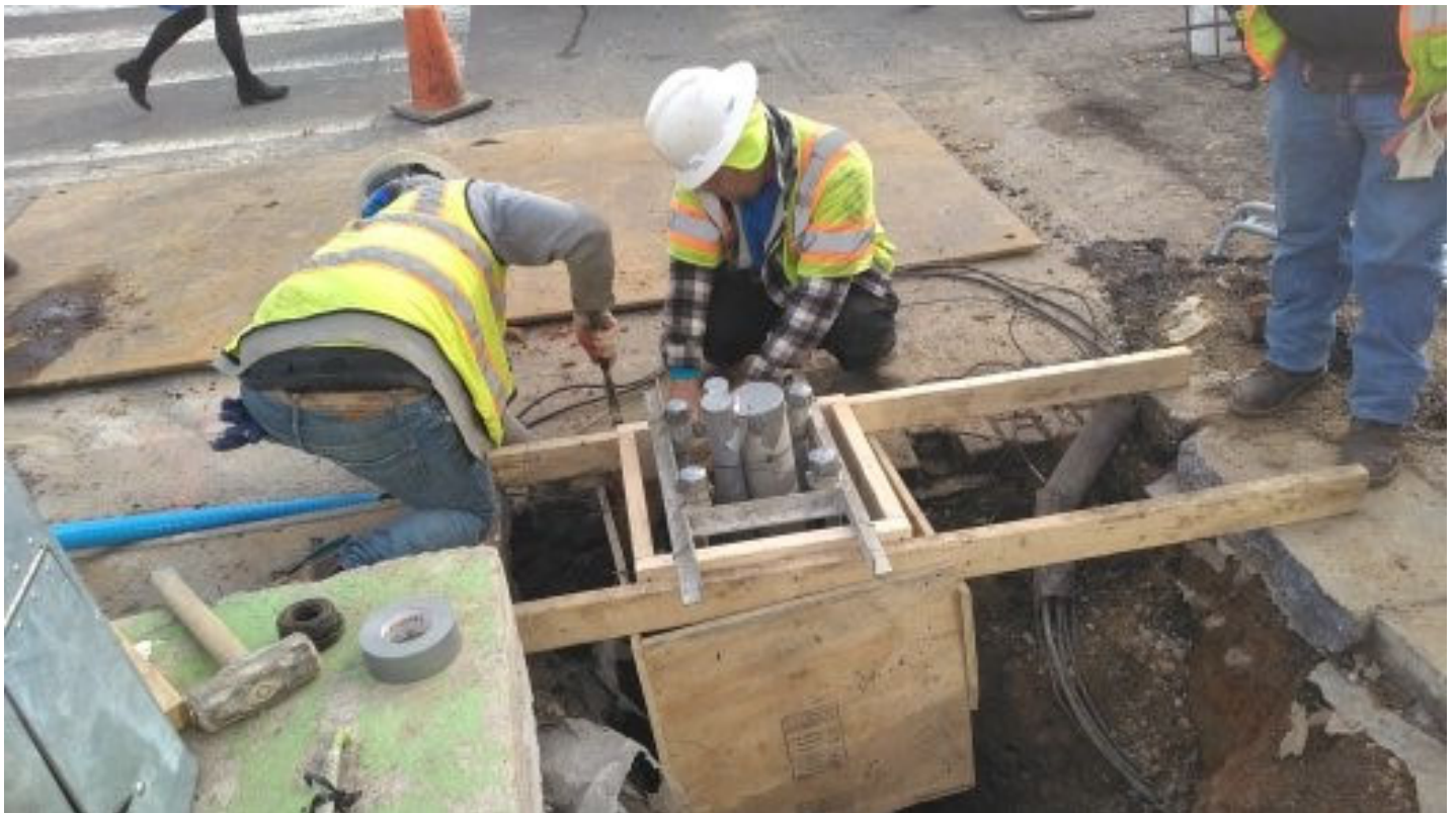
Omni forming the footer for the traffic signal/light pole at T Street & 14 th Street NW