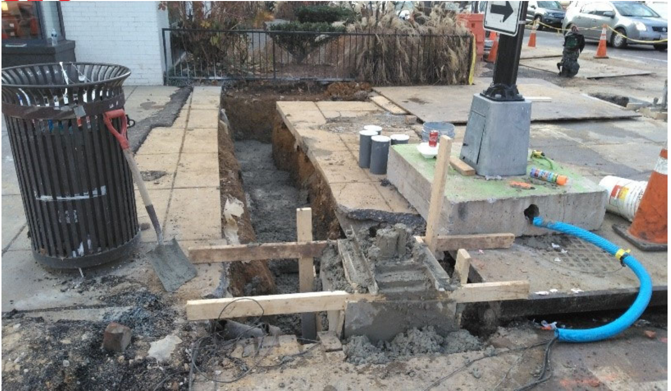
The traffic signal/light pole foundation and the conduits were encased in concrete at T Street and 14 th Street NW