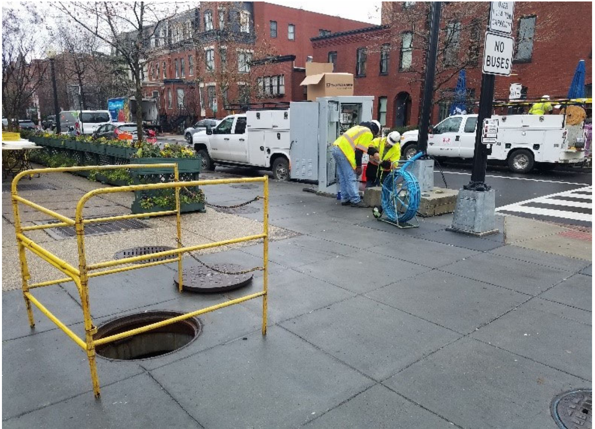
FMCC electrical crew working at 14 th & Q St