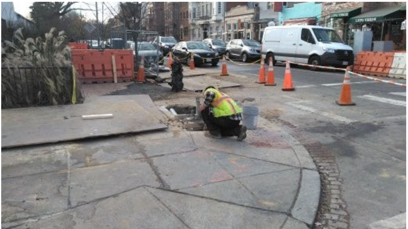
Omni finishing the traffic signal foundation at the corner of T Street & 14 th Street NW