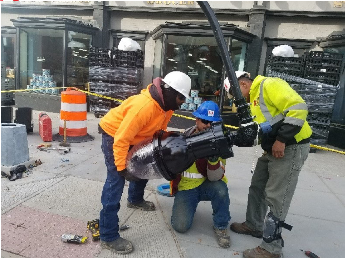
Teardrop fixture installed at L-91