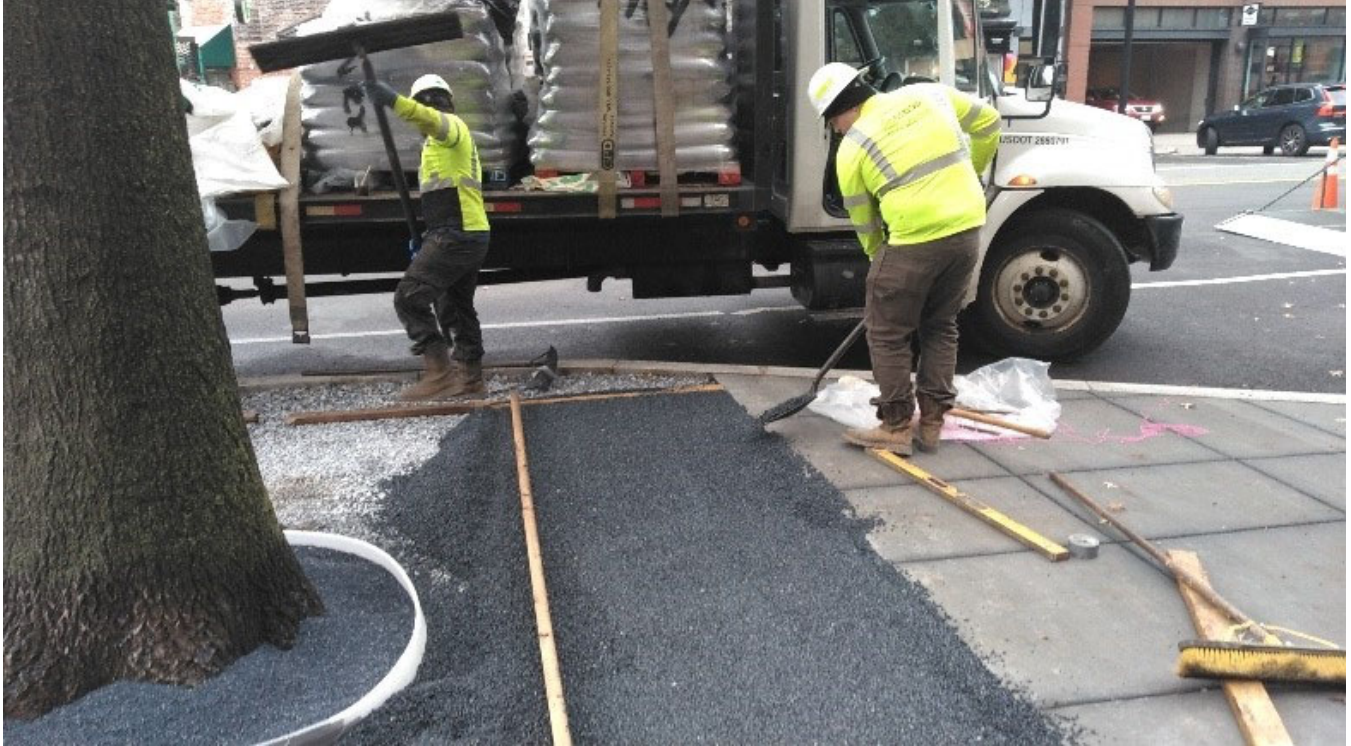
Capital Flexi Pave placing the porous flexible pavement