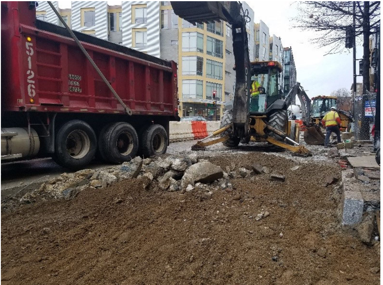
Demolition underway by FMCC at SEC of 14 th & Fla. Ave