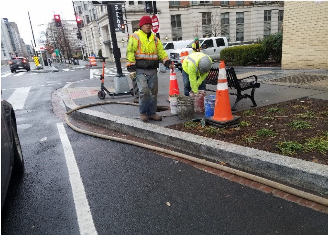
Omni Excavators working at NWC of 14 th & N St parking pipe connections and draining catch basin