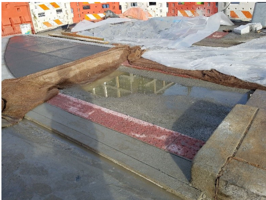
Truncated dome surface placed at walkway between bus island