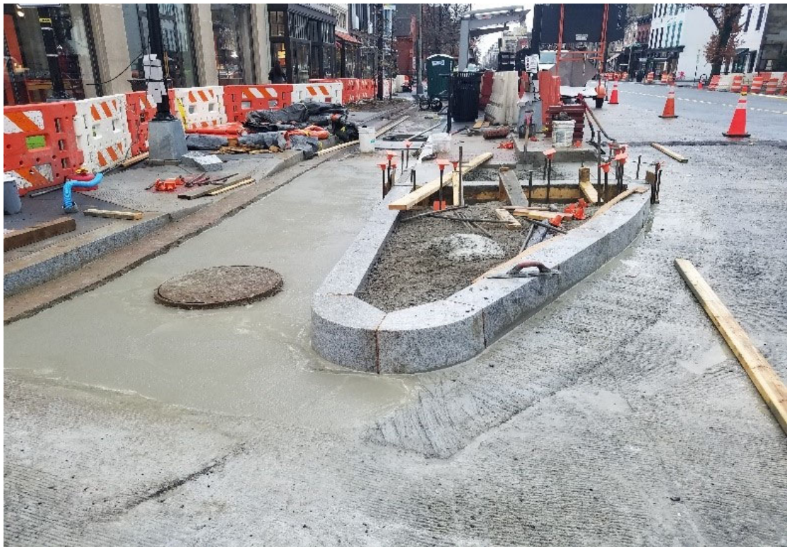
PCC Base repair at SEC of 14 th & R St