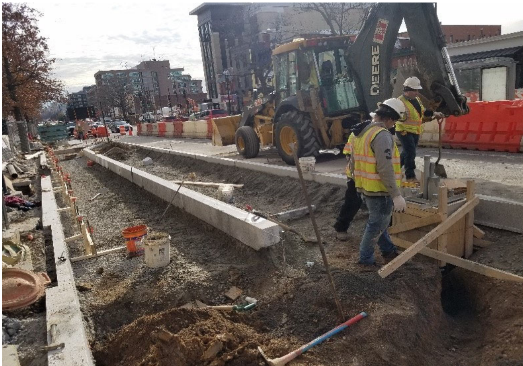
Forming of traffic signal foundation TS-53 at SEC of 14 th & Fla. Ave by Omni