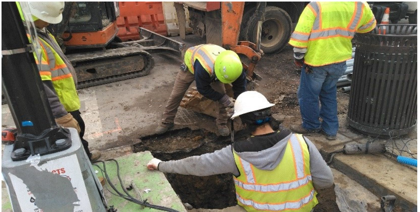
Omni Excavation at a foundation at the southwest corner of T Street & 14 th Street NW