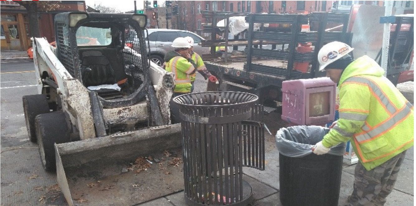
FMCC crew preparing to remove an existing Litter Basket from the northwest corner of T Street & 14 th Street NW