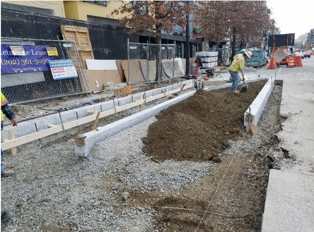
FMCC grading bus island subgrade at SEC of 14 th & Fla Ave