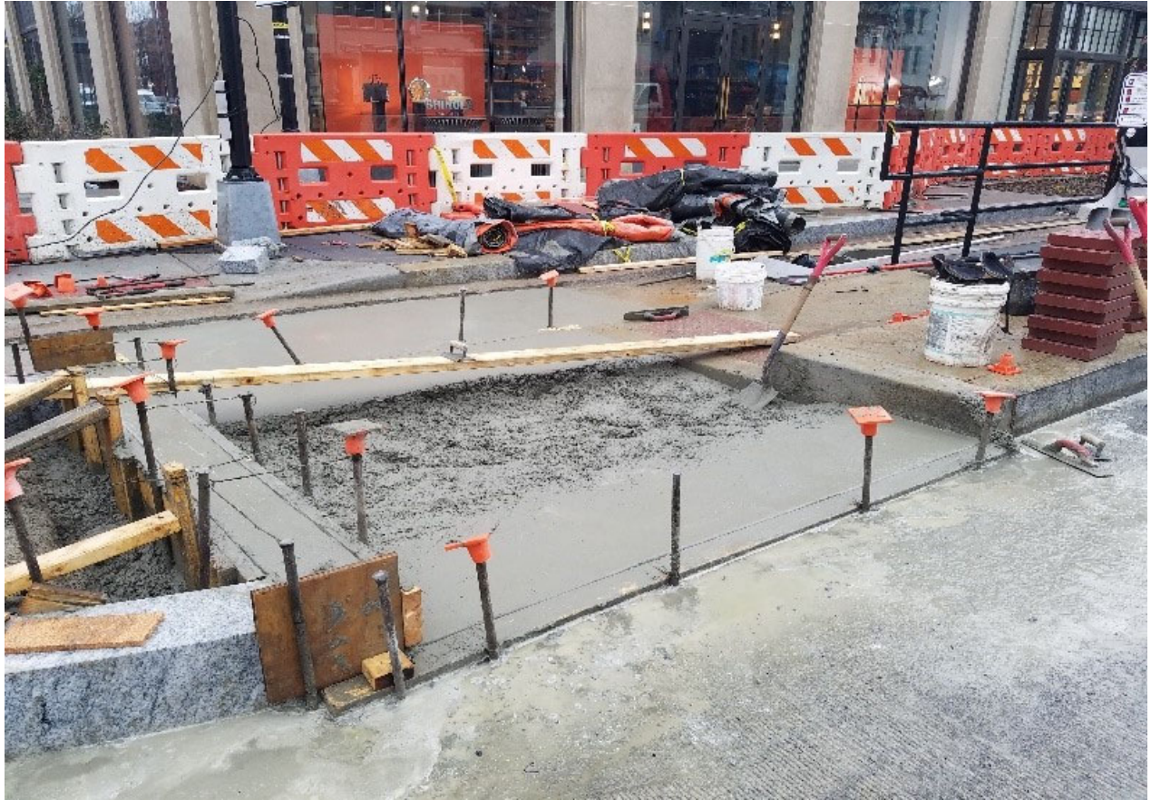
SEC of 14 th & R St walkway w/ PCC Base repair