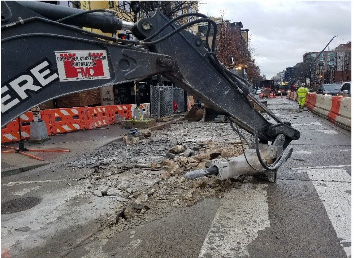
Ramhoe used by FMCC during demolition