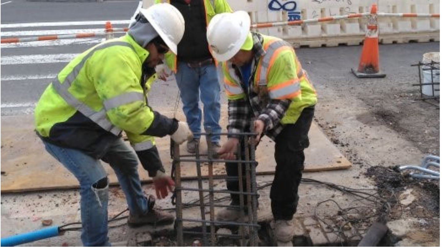
Omni installing rebar cage into the traffic signal/light pole foundation on the Southwest corner of T Street and 14 th Street NW