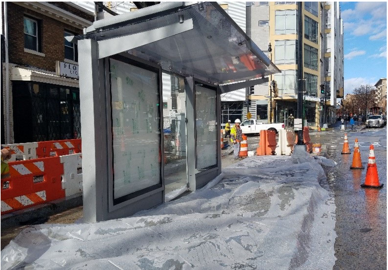
Bus island at 14 th and Florida Southbound , concrete under the shelter was finished

Project Website: www.14thstreetproject.com