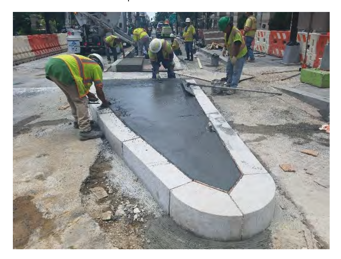
Granite curb installation at north section of bus island.

PCC sidewalk placement from 1736 to 1740 14th ST.