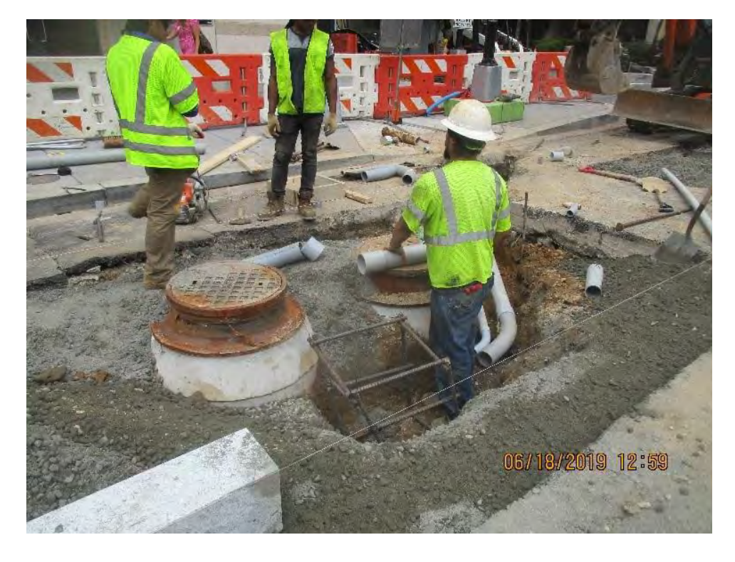
Omni installing the Street Light Pole Foundation TS06 within the area of the proposed Bus Island at 14th & N Street NW