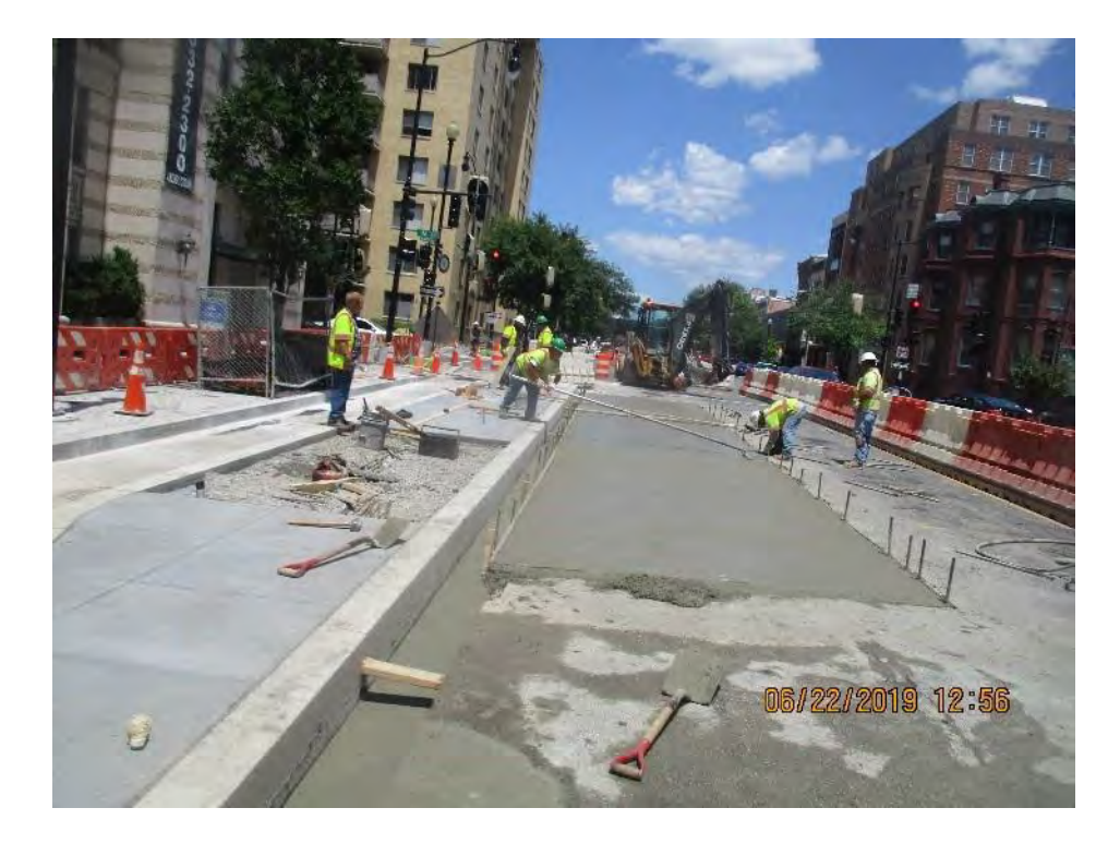
FMCC finishing up the concrete work for the installation of the Bus Pad at the southwest corner of 14^{\text{th}} & N Street NW