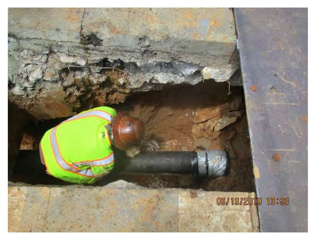
Omni continued the Installation of 8-Inch D.I.P at 14th & R Street NW