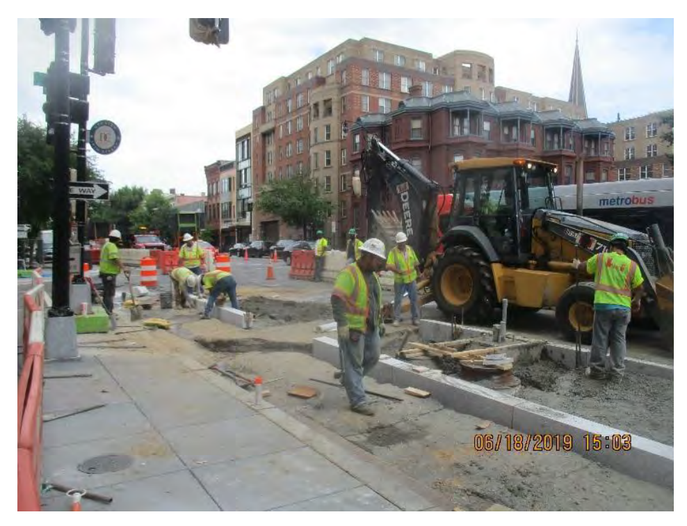
Omni poured the concrete for the Street Light Pole Foundation (TS06) within the area of the proposed Bus Island at 14th & N Street NW