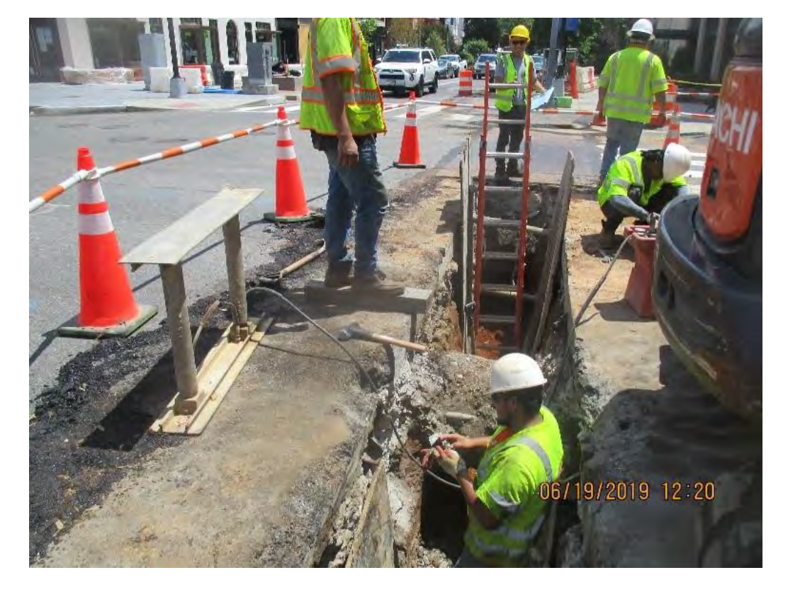
Omni continued the Installation of 8-Inch D.I.P at 14th & R Street NW