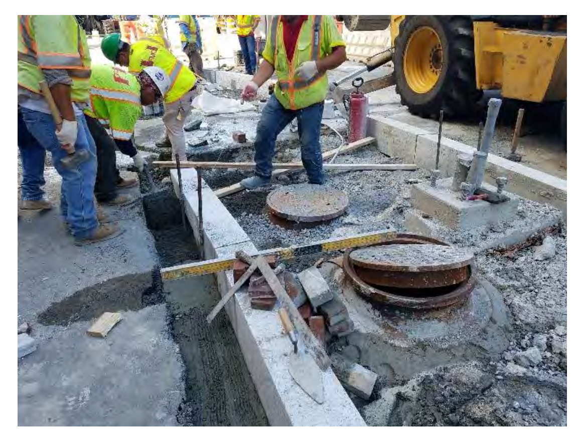
Granite curb installation and grade check by FMCC. .