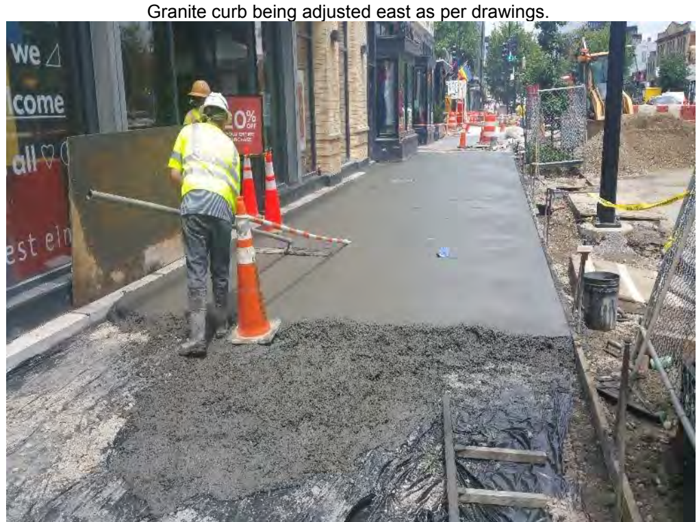
PCC sidewalk placed from 1732 to 1726 14th St.