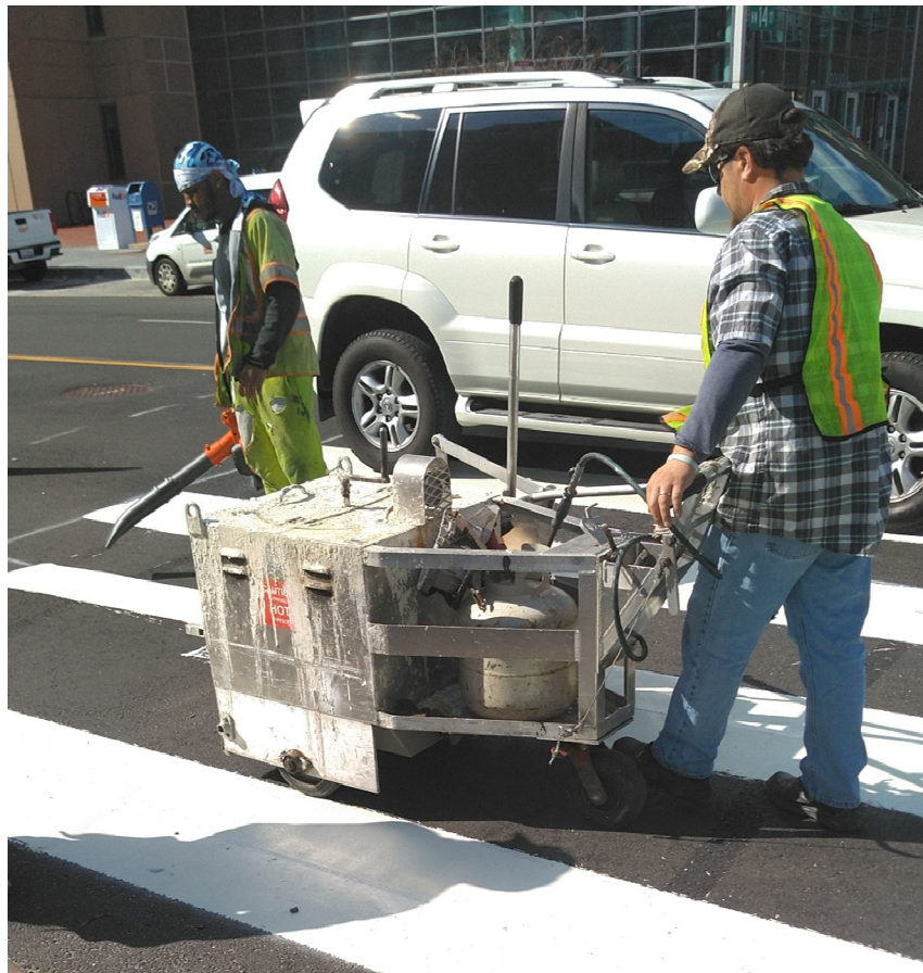
DCLine Striping Crosswalk at U street

Project Website: www.14thstreetproject.com