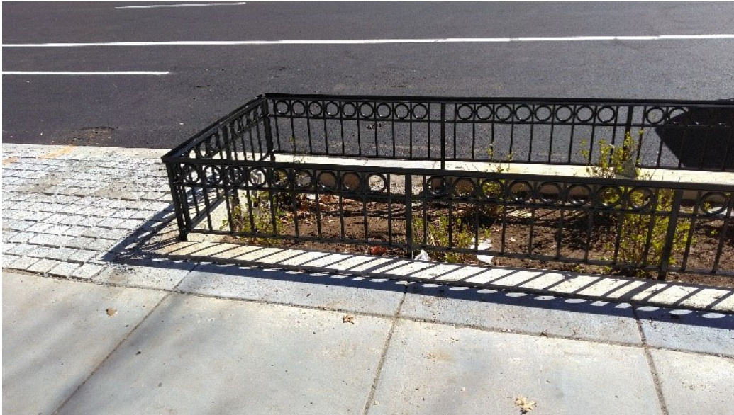
Bioretention # 3 Finished