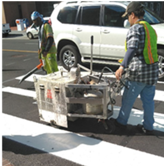
Tack coat for paving work at Corcoran Street