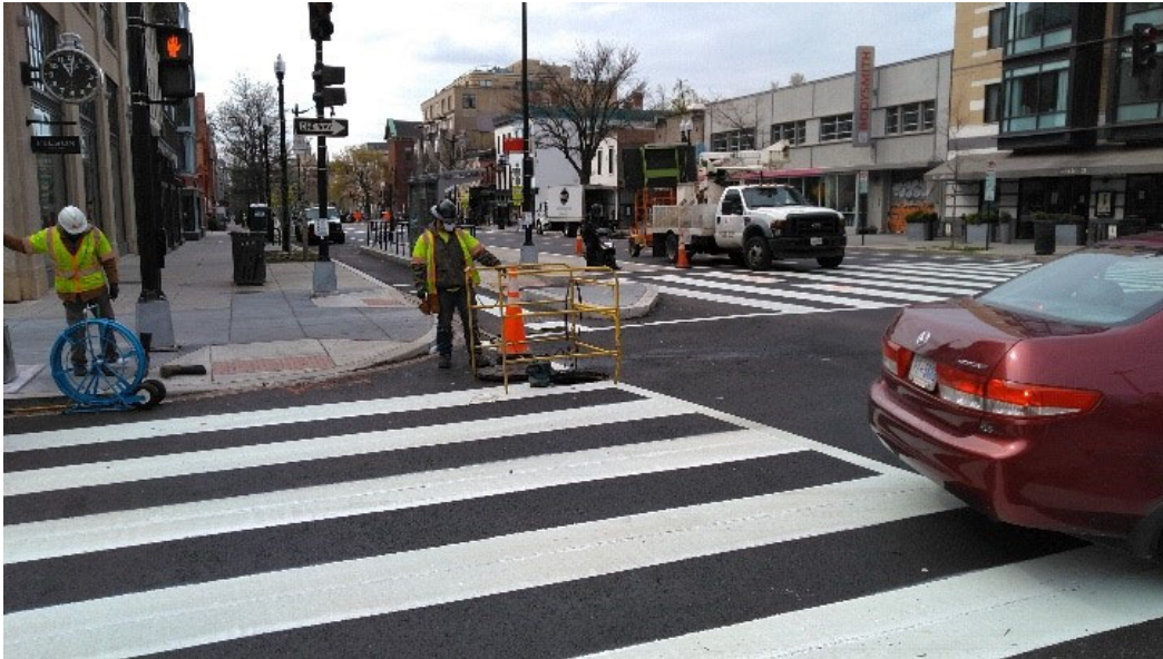
Electricians Splicing Cable At R street