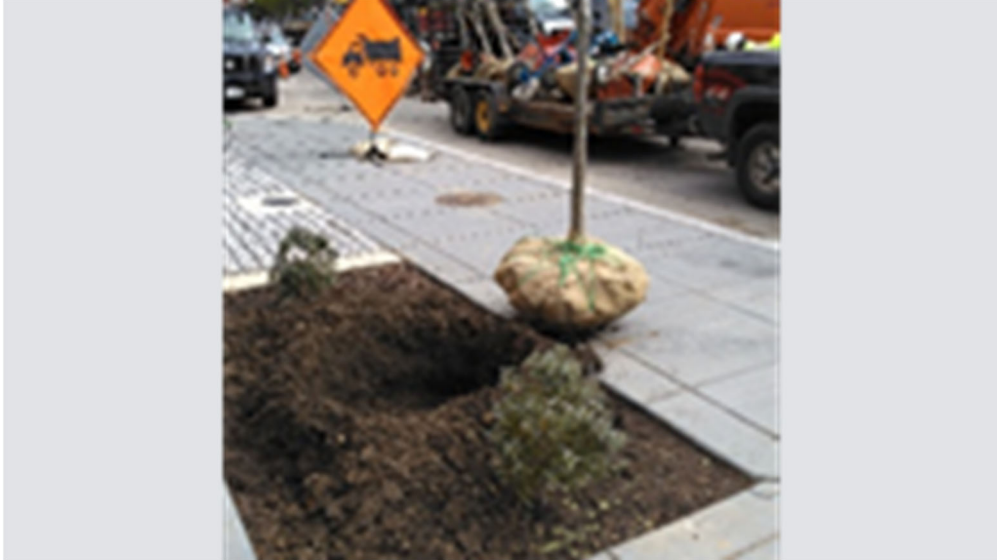
Landscapers planting Tree near Florida Ave.