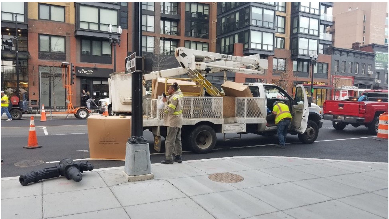
FMCC Electrical delivered material for streetlight operation