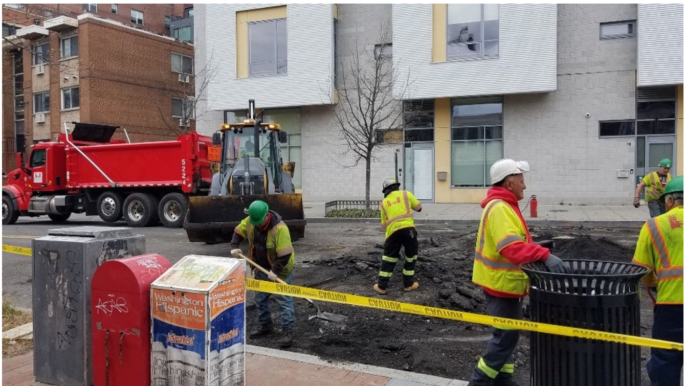
FMCC prepared for paving work at west side of Florida Avenue