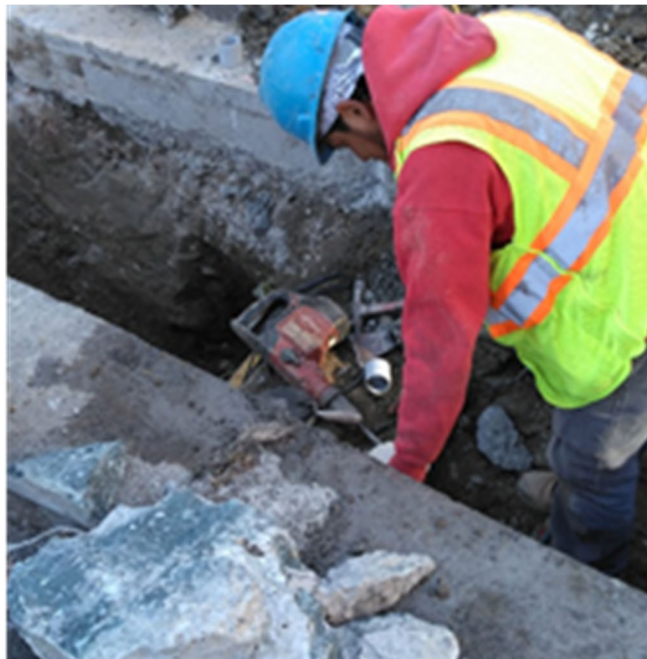
Omni continues installing missed conduit