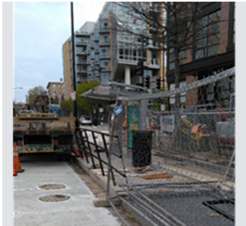
Long fence Installing handrail At Florida Ave. island