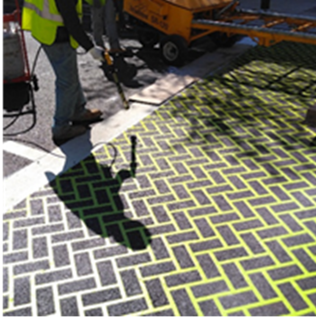
Inlaid Thermoplastic Installation R street