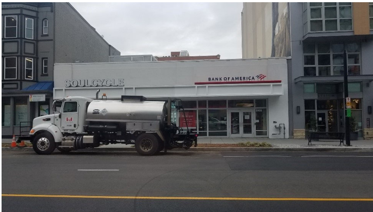
Tack coat vehicle onsite ready for paving procedure