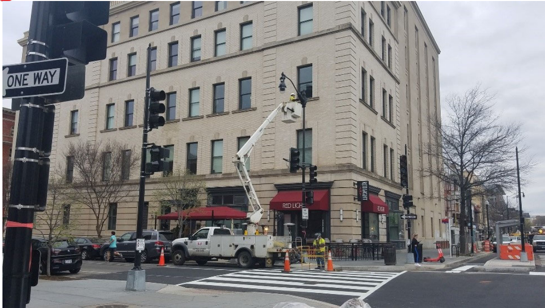
FMCC electrical crew working at R Street intersection