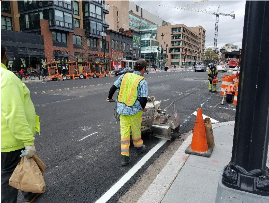
DCLine at 14 th & Wallach St northbound 4" lane markings