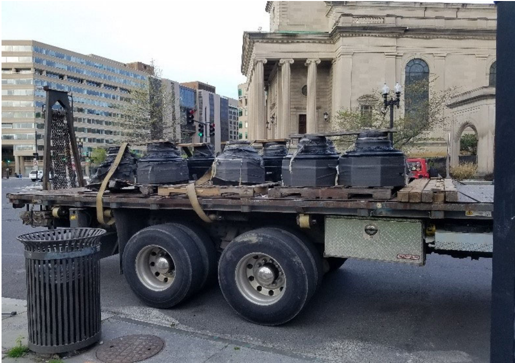
FMCC boom truck with load of pole bases