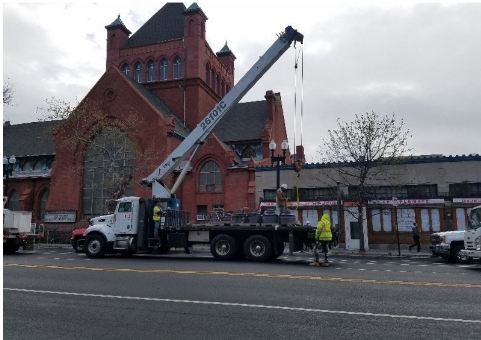
FMCC Electrical Crew unloading pole bases