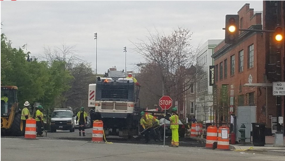
FMCC prepared for paving work at east side of Florida Avenue