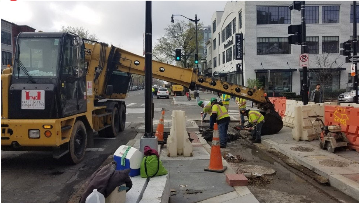
FMCC preparing for the asphalt placement at the bus island at NWC of T Street