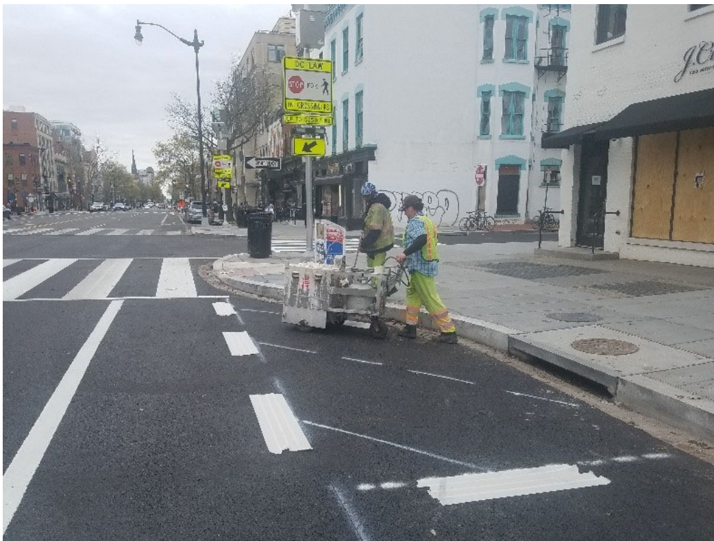
6" lane markings near 14 th & Corcoran St by DCLine