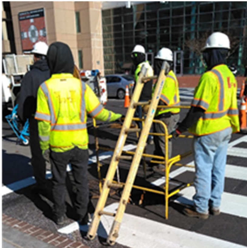
Pulling Cable At U street