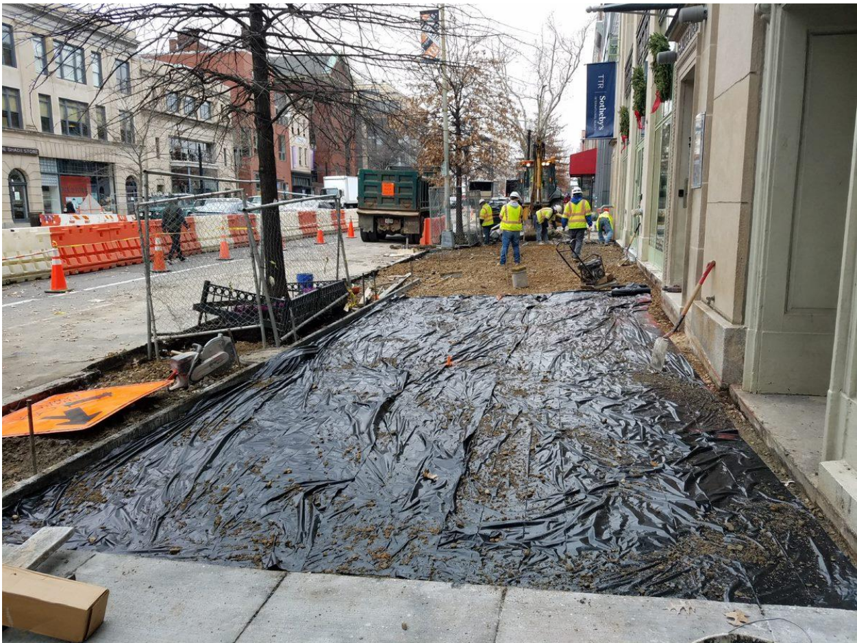
PCC Sidewalk Placement between P Street and Q Street

Project Website: www.14thstreetproject.com