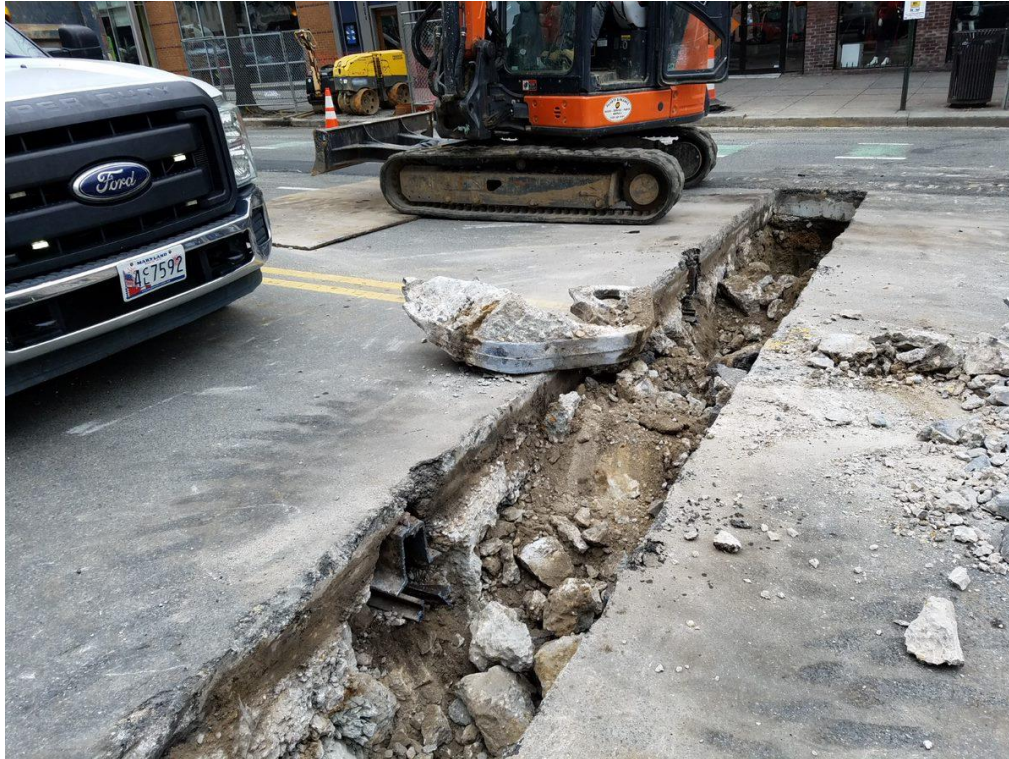
Removal of Street Car Track between V and U Street