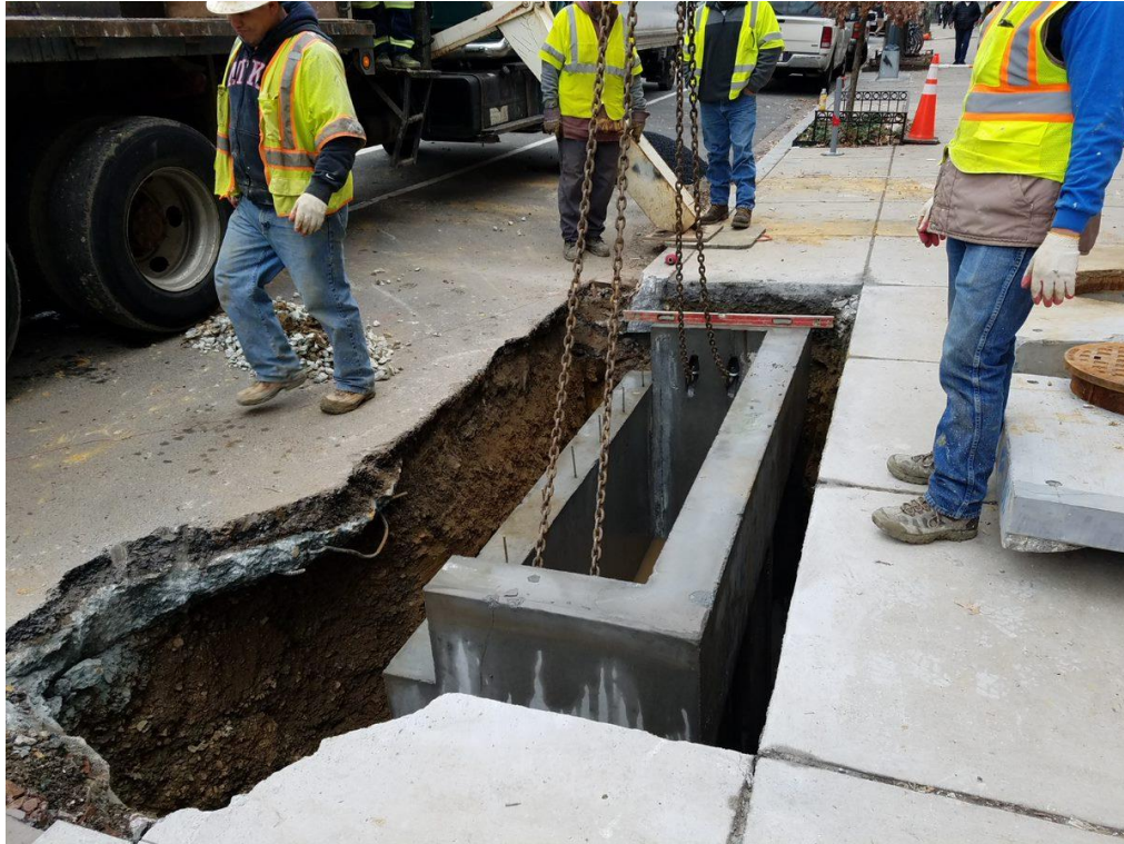
Installation of Double Catch Basin at Swann Street