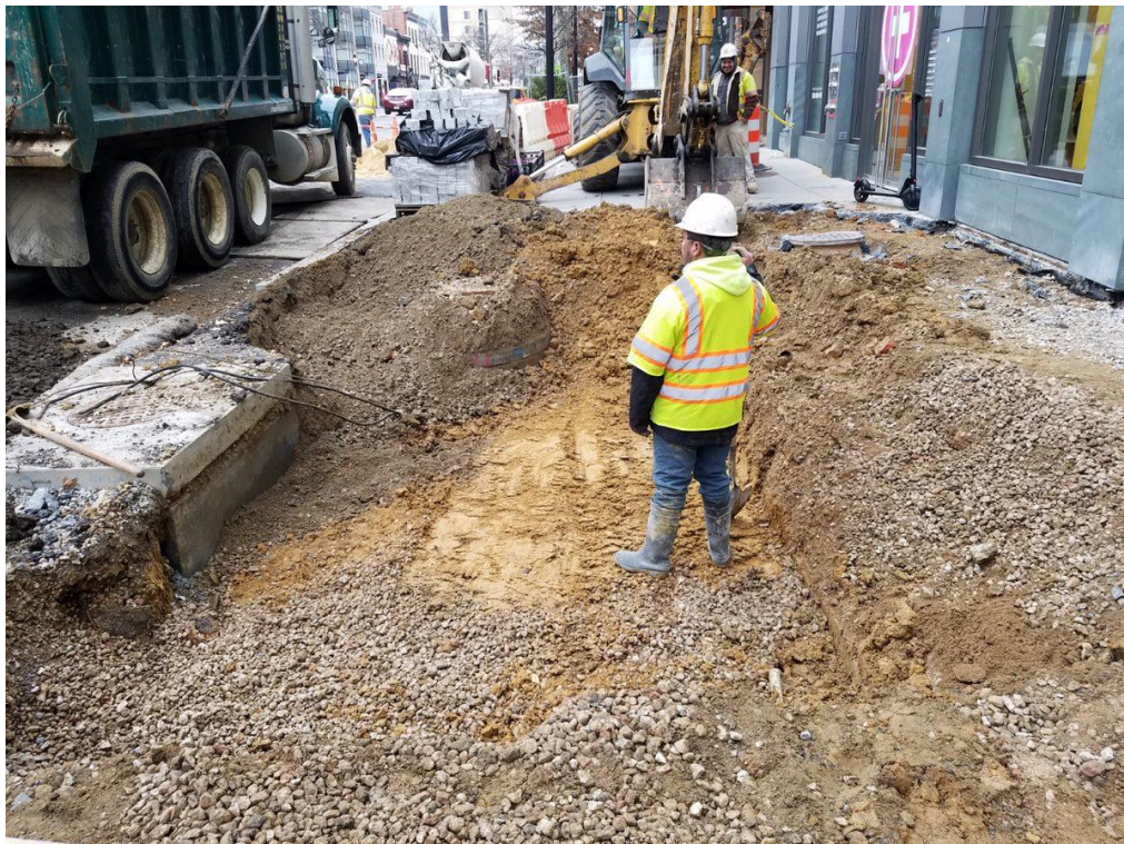
Excavation for installation of Structural Soil between P and Q Street