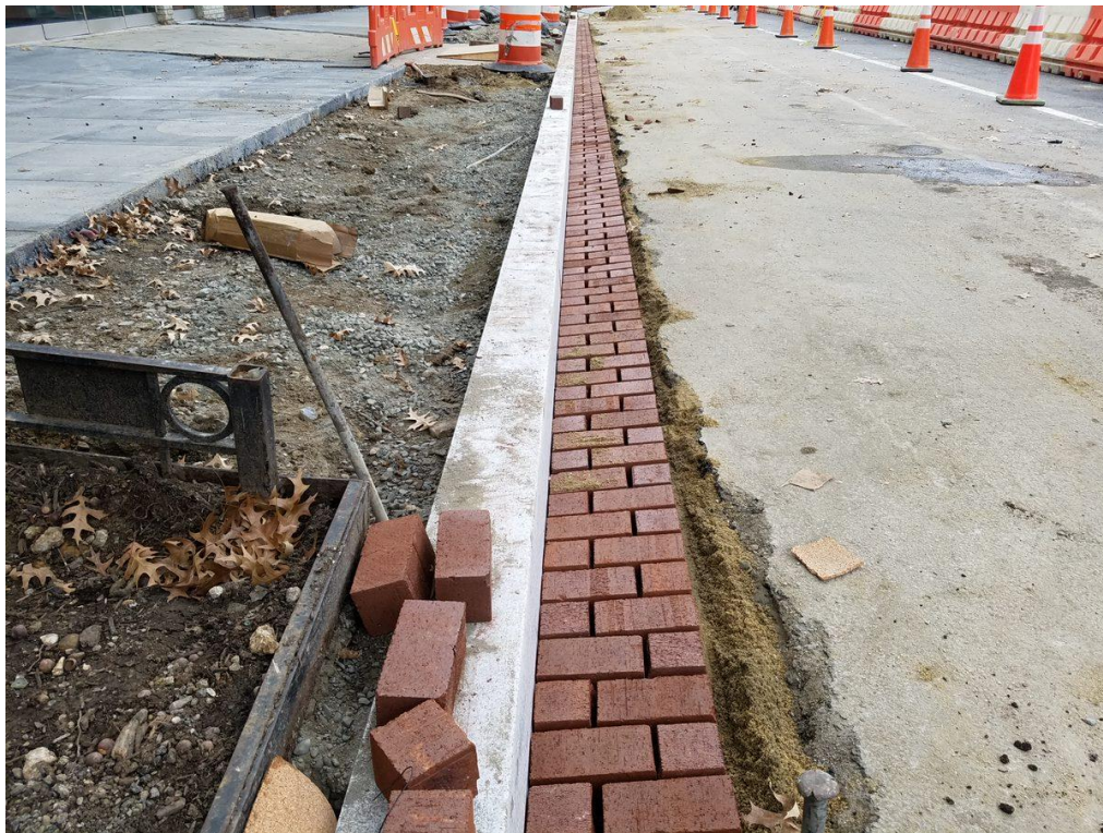
Installation of Brick Gutter between P and Q Street