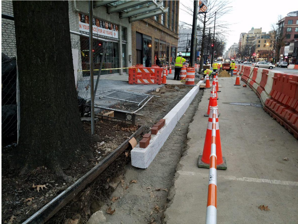
Installation of Granite Curb between P and Q Street