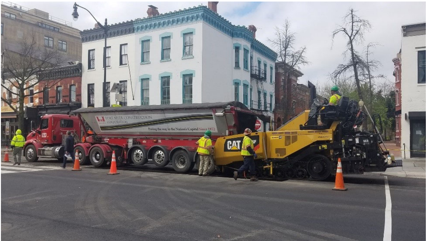
Paving work at Corcoran Street with truck