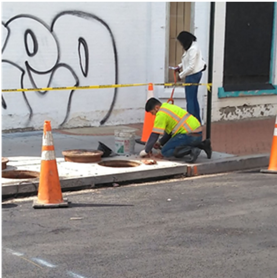
Omni Parging Manholes Corcoran Ave.