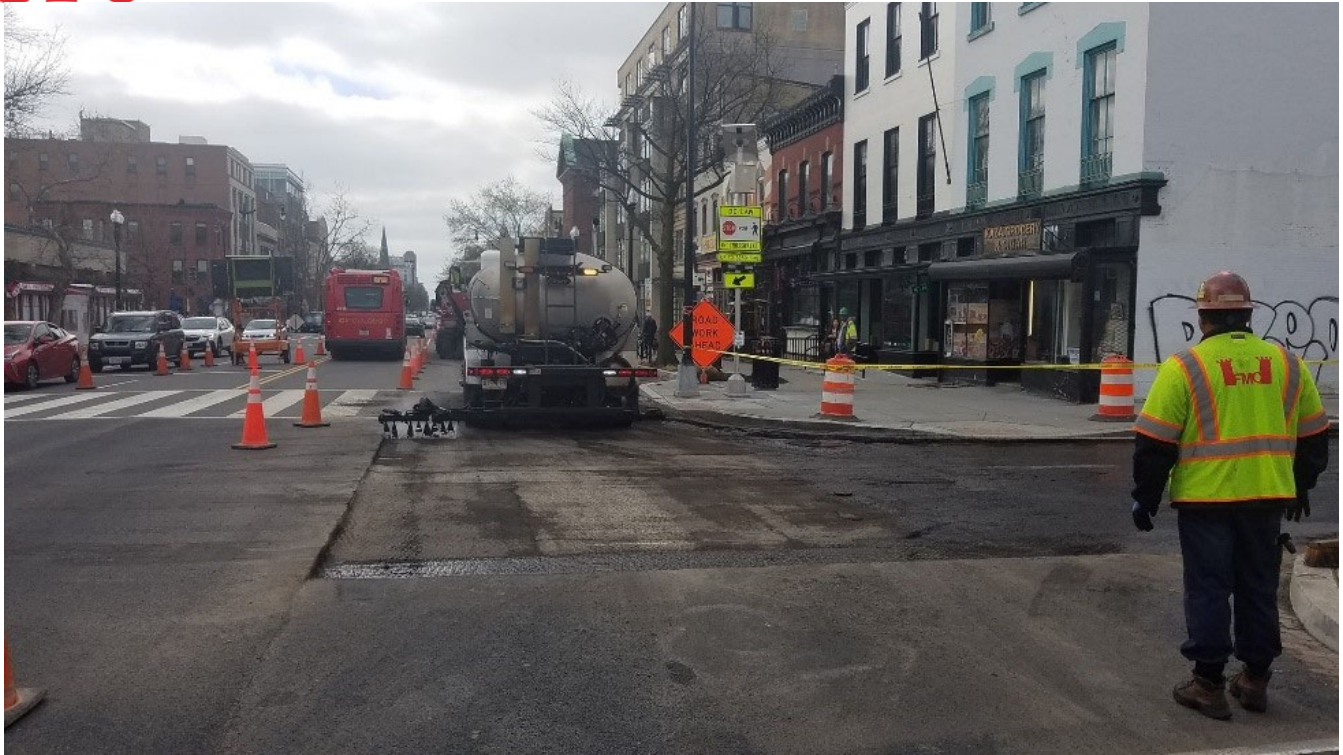
Tack coat for paving work at Corcoran Street