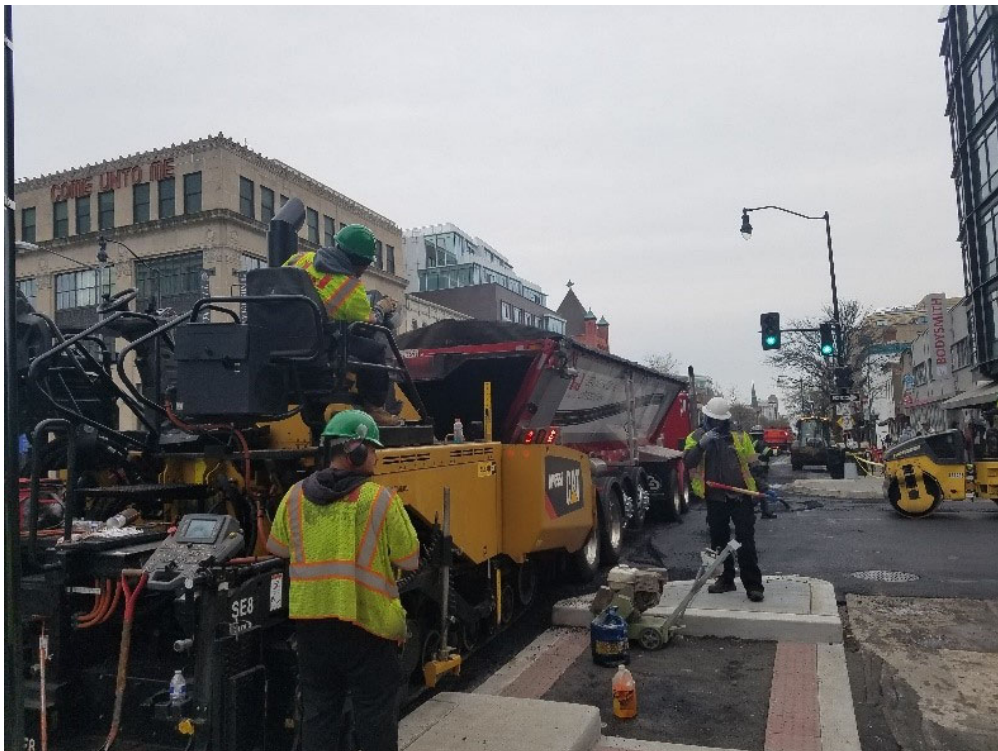
FMCC placing asphalt SB 14 th St near R St