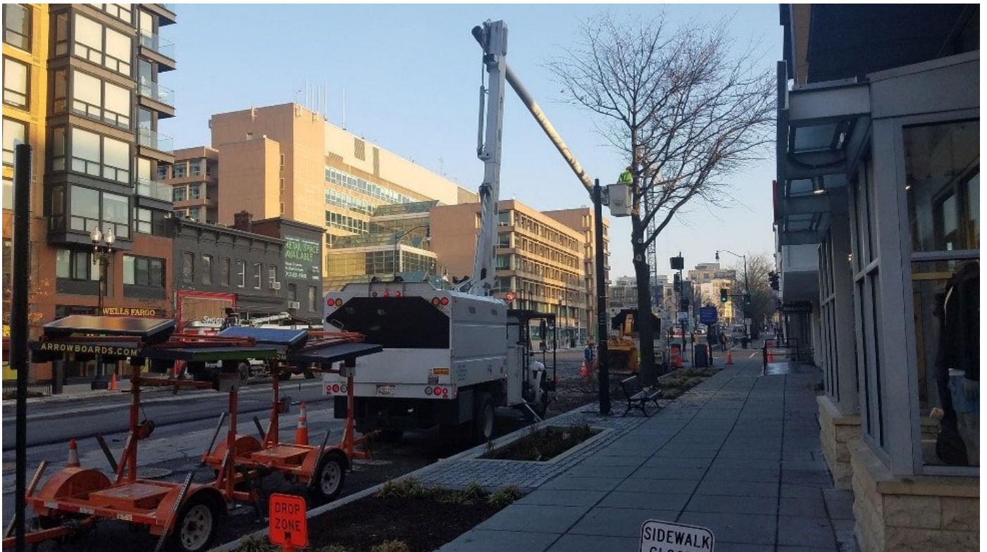
Excel on site to remove some roots in the proximity of U Street