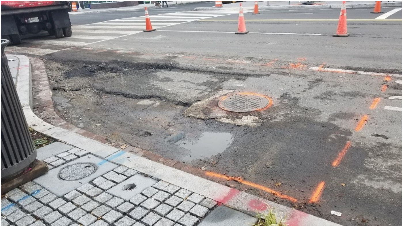
A Section to be paved at Corcoran Street