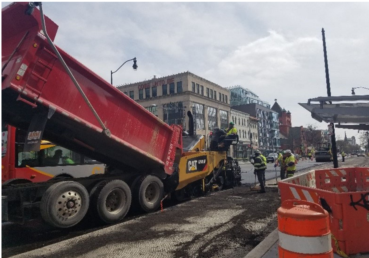
14 th St SB near R St asphalt placement underway

Project Website: www.14thstreetproject.com