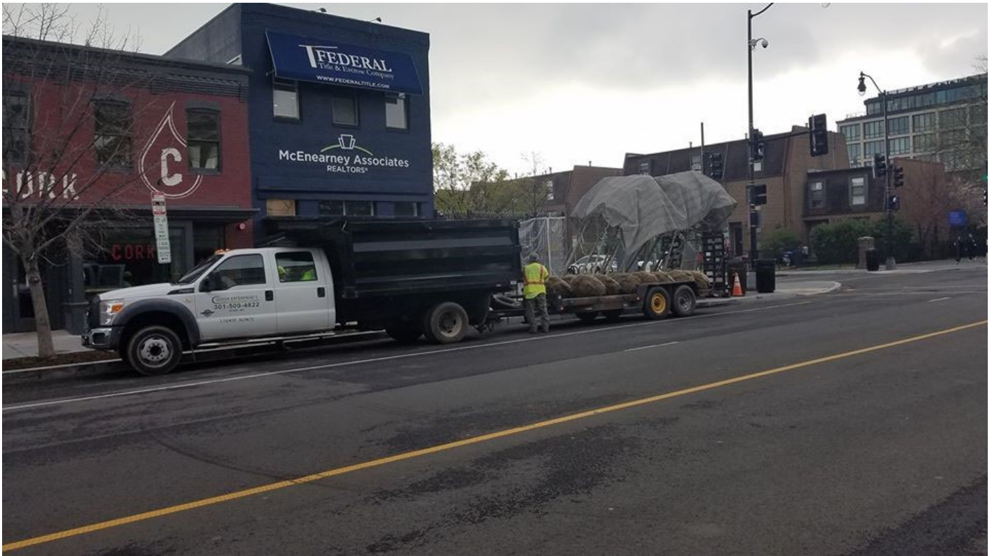
Cooper Enterprises delivered trees to the site