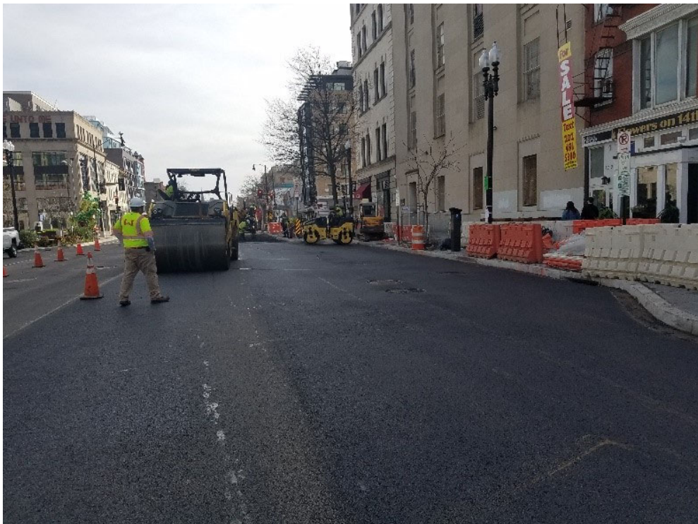
FMCC rolling and compacting 1700 block of 14 th St SB