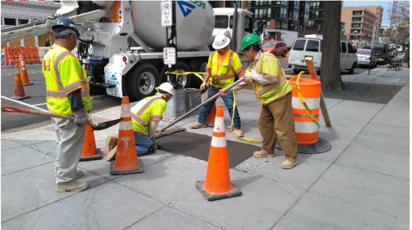
Repair Sidewalk NEC T Street.