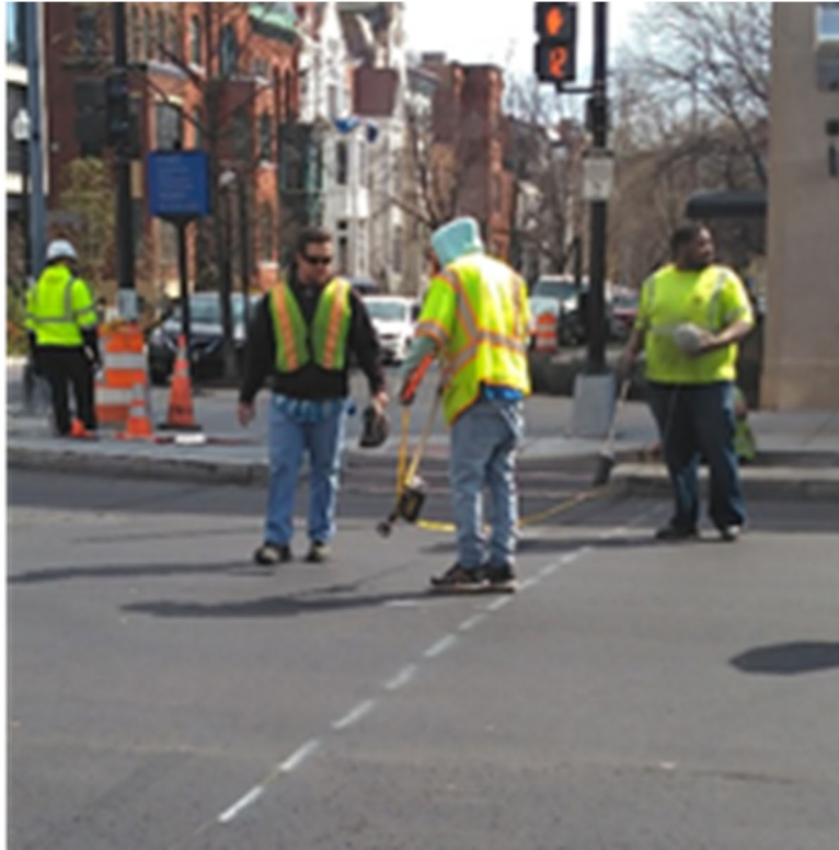
DC Line.- Layout of Crosswalk R street