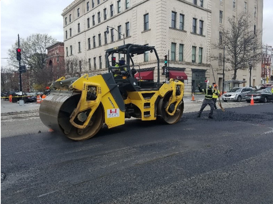
FMCC placing asphalt NB 14 th St near R St