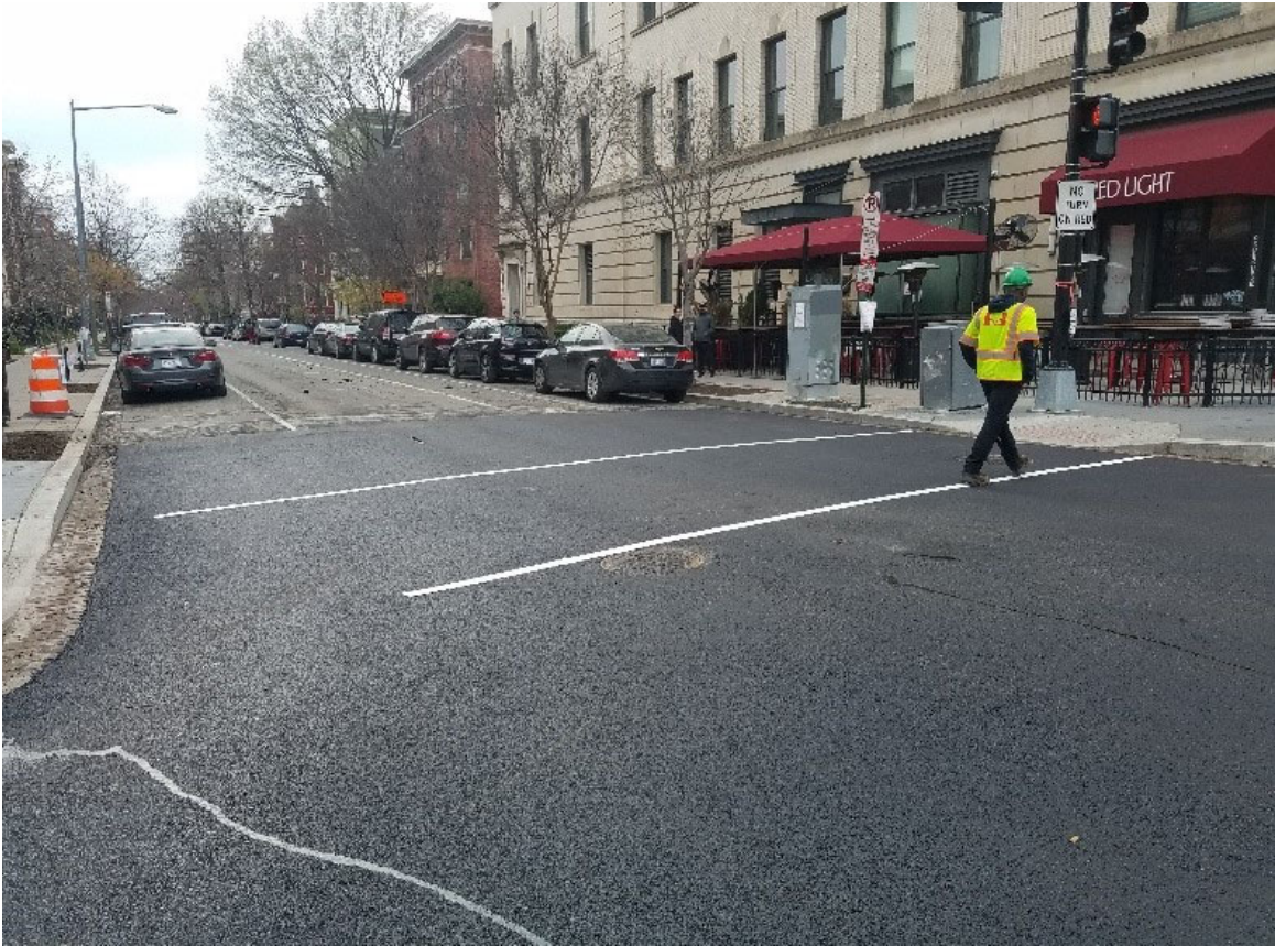
R St west of 14 th St asphalt placement completed