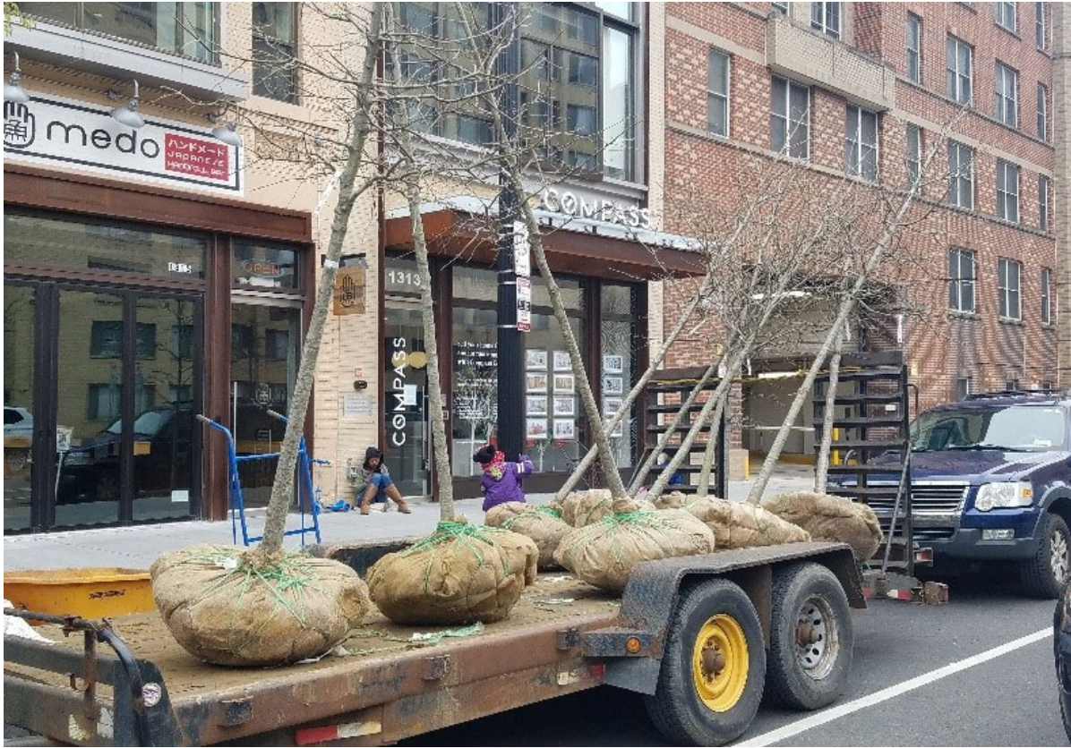
More trees to be placed between Thomas Circle and Corcoran St