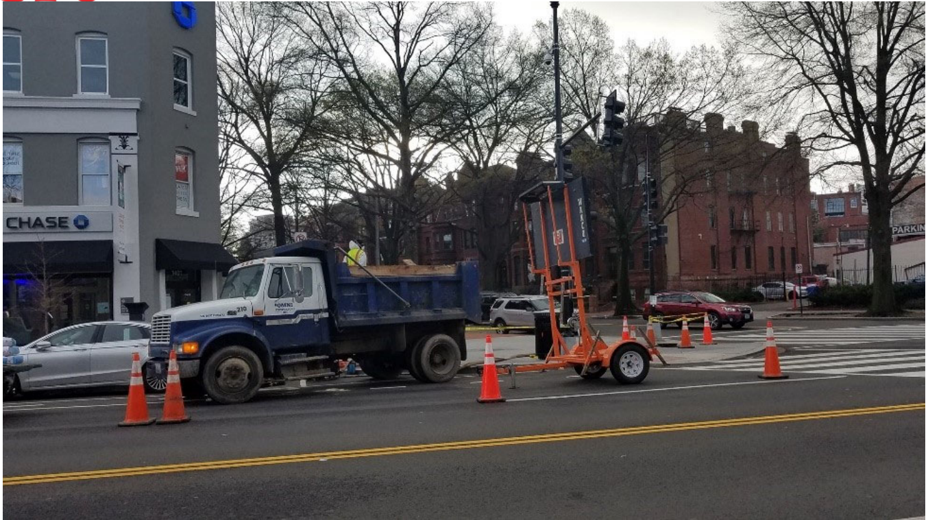
Omni was on site purging and cleaning the manholes