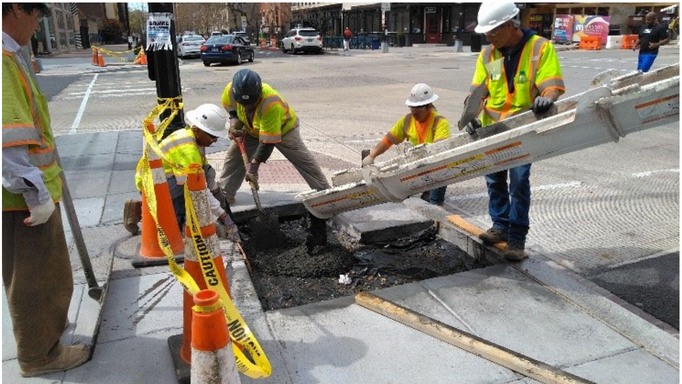
Repair Sidewalk SEC V Street.