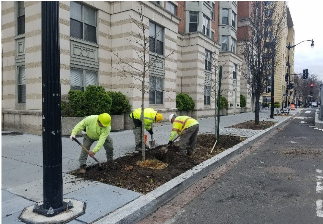
Cooper Landscaping at 1250 14 th St placing trees