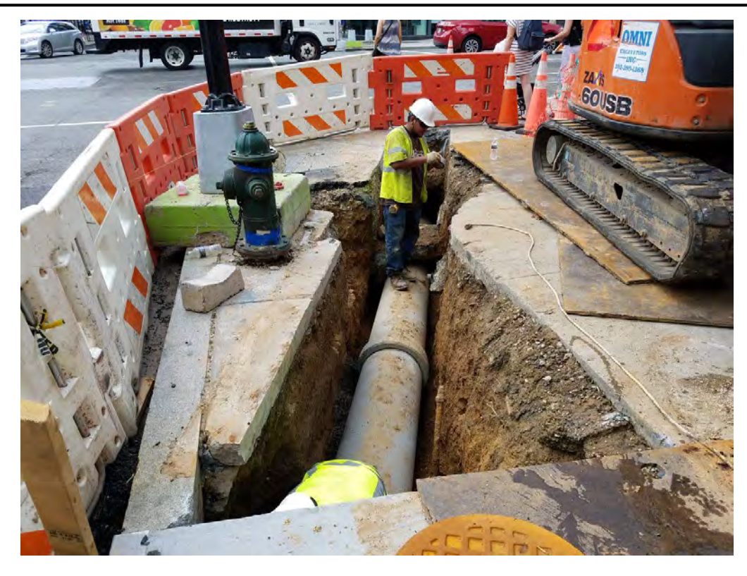
Installation of Catch Basin 15" PCC Connection pipe at NE corner of 14th and P Street