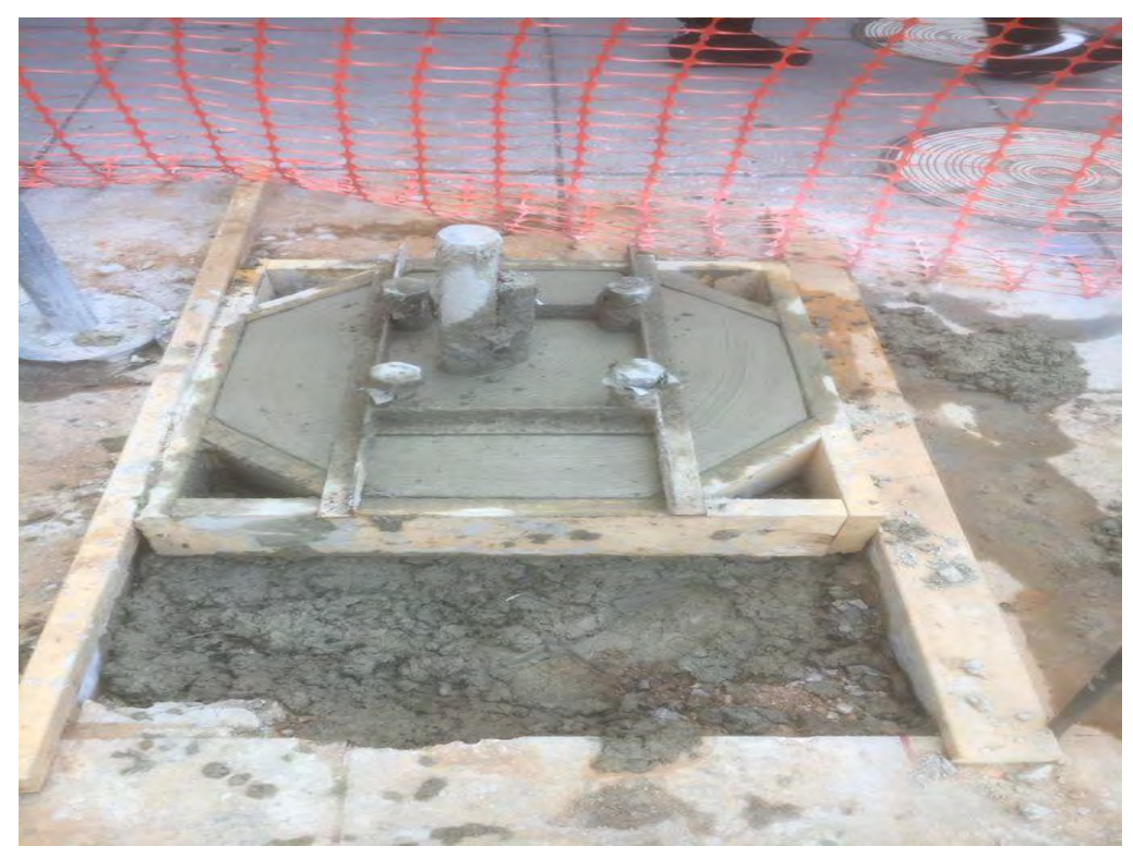
Street Light Foundation between N Street and Rhode Island Ave