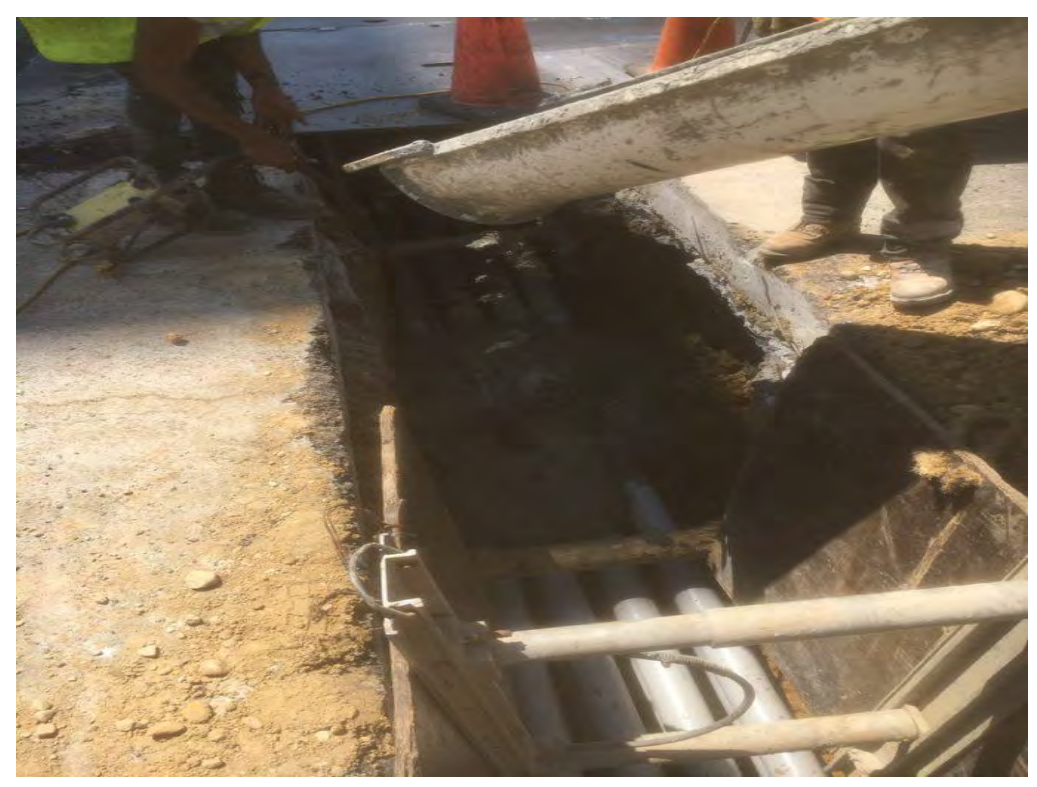
Encasement of PVC Conduit on the Westside of N Street