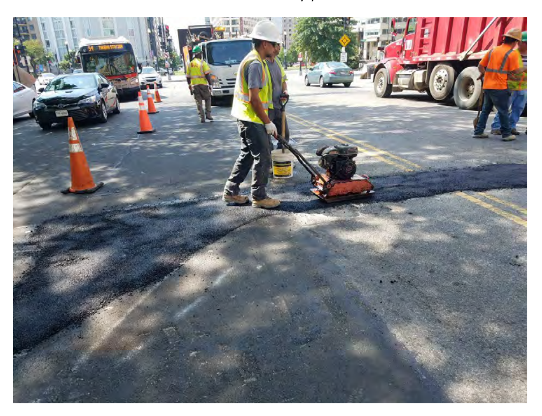
Placement of Temporary Asphalt over Laterals between Thomas Circle and N Street