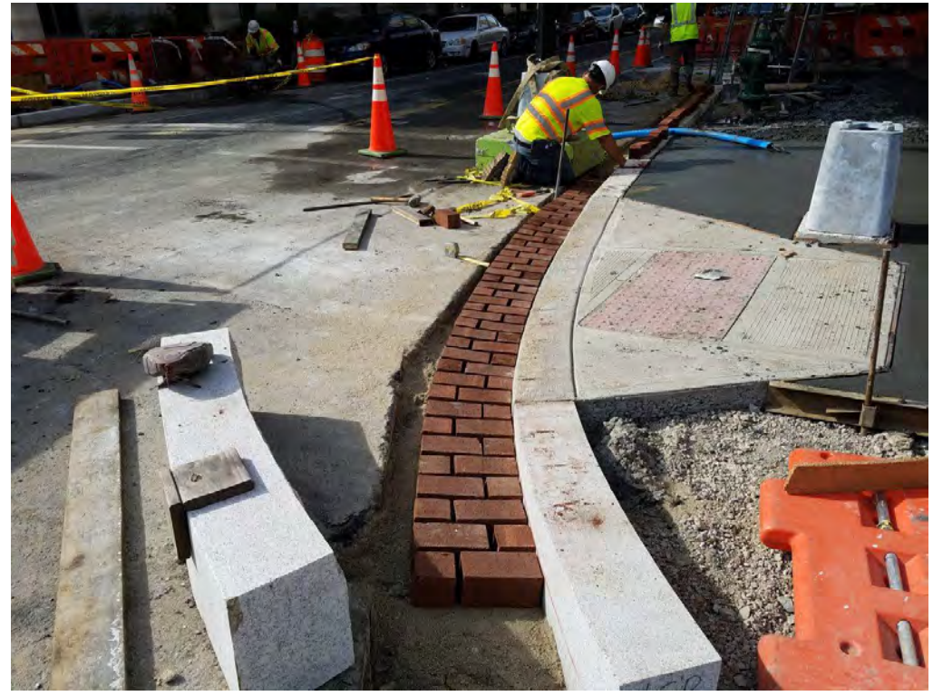
Placing Brick Gutter at the NW Corner of 14th and N Street