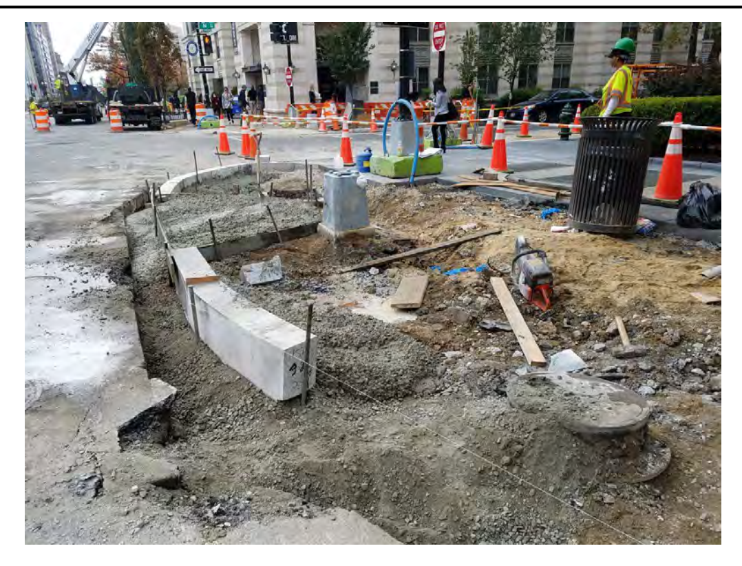
Installation of Granite Curb for Bulb Out at NW Corner of N Street