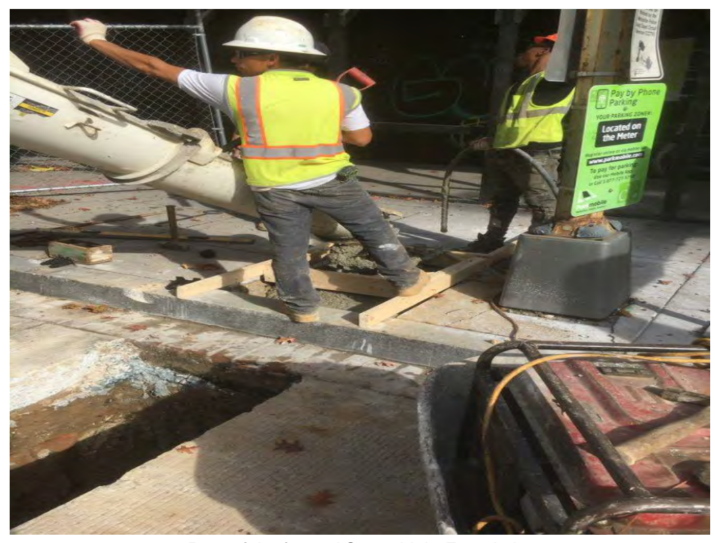
Pour of the formed Street Light Foundation