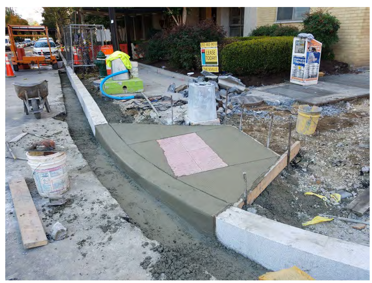
Installation of ADA Ramp at the NW corner of 14th and N Street on the N Street side

Project Website: www.14thstreetproject.com