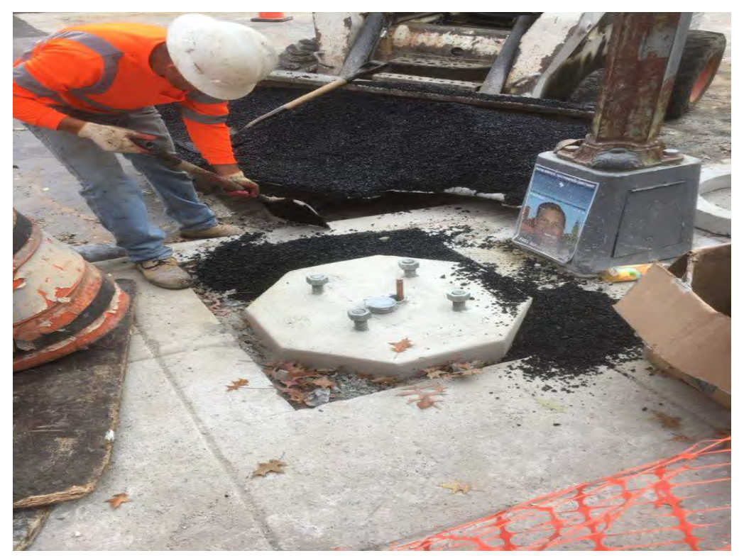
Placement of Temporary Asphalt around previously poured Street Light Foundation