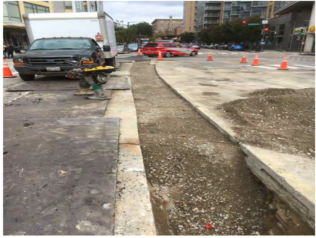
Backfill of Encased Electrical Trench between Florida and W Street