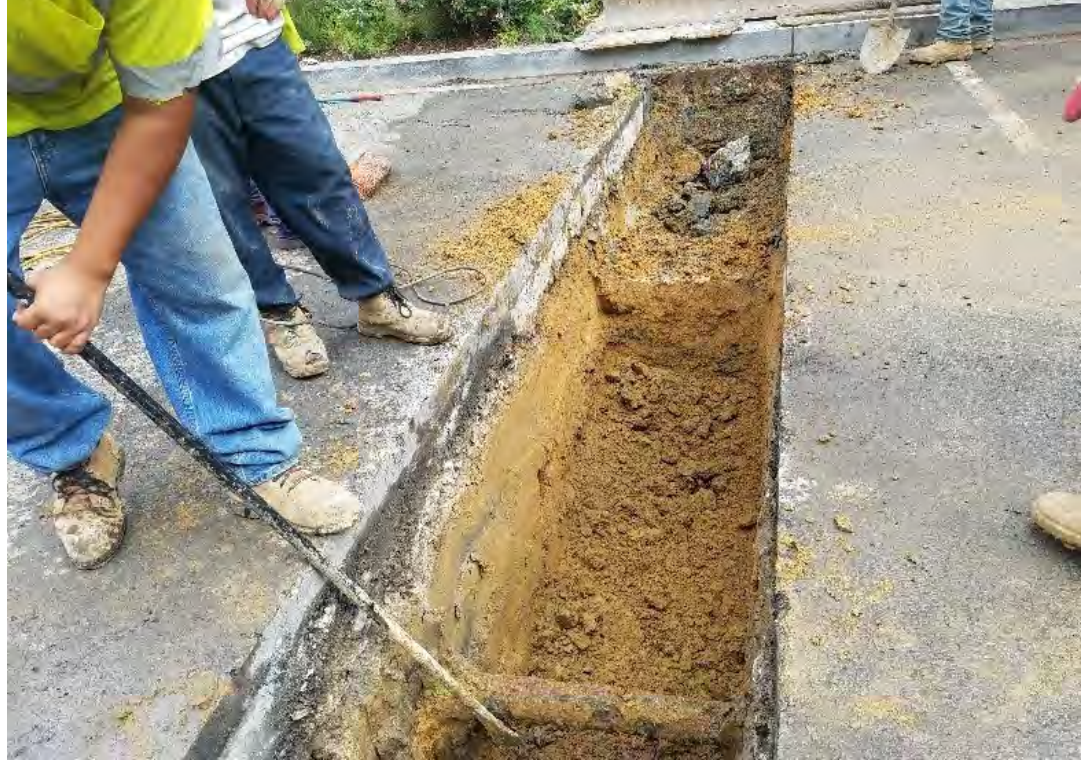
Hand digging done neat existing utilities.