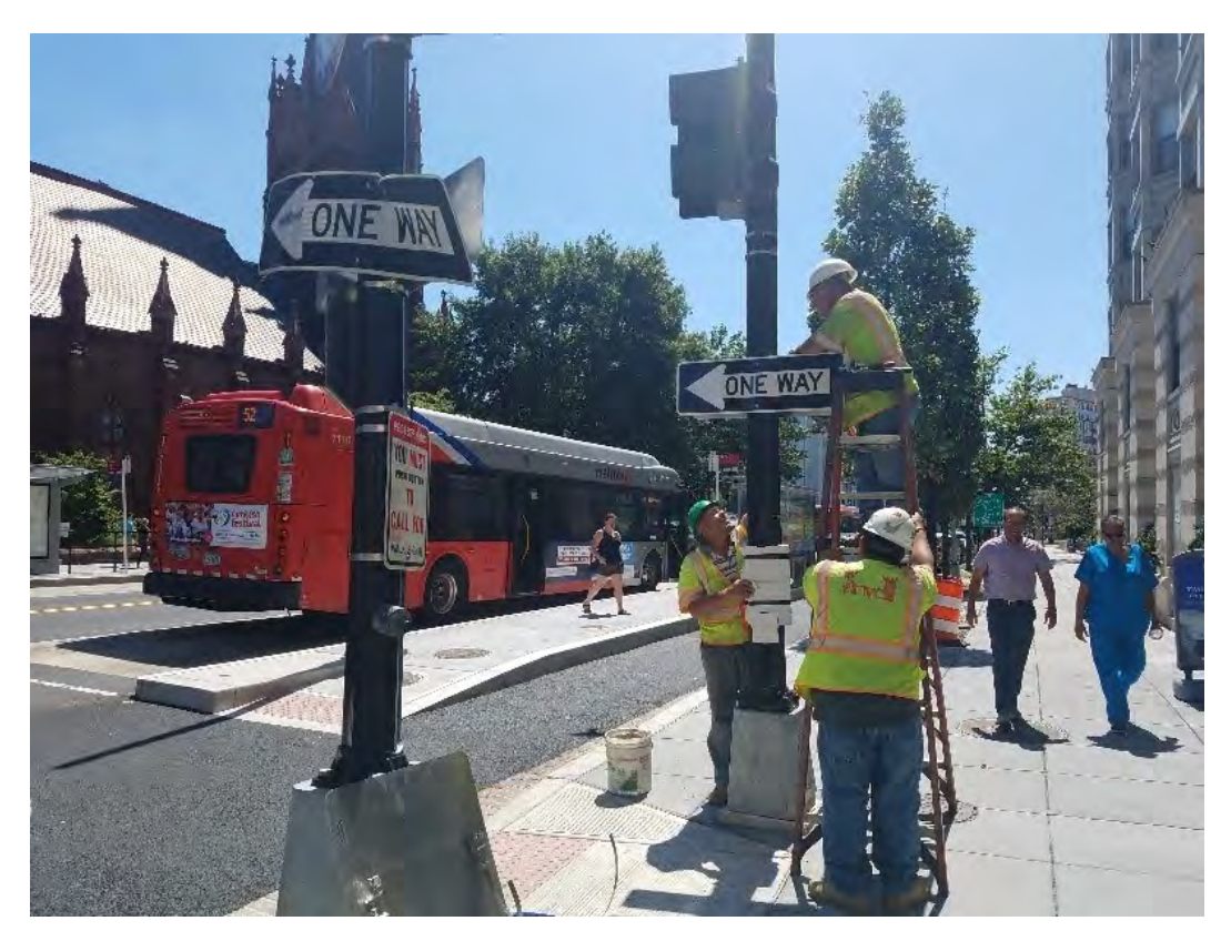
Another sign removed by FMCC between N and RIA

New signs installed at SWC of 14th & N St