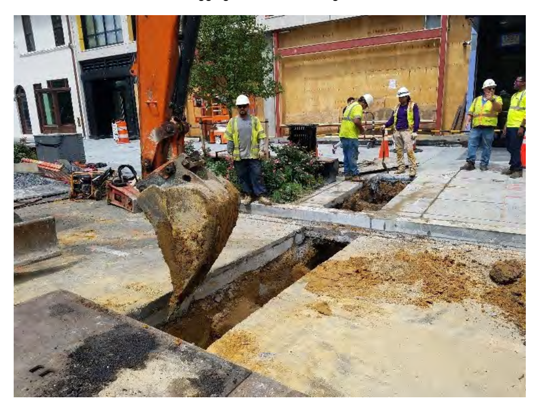
Trench excavation toward existing 8" water valve tie-in.