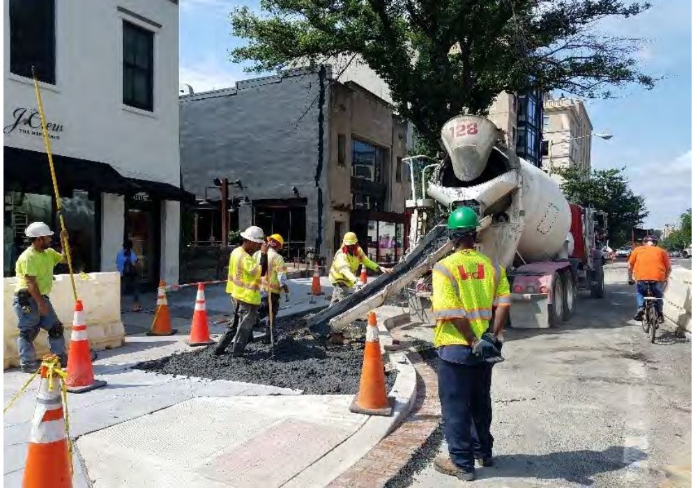
D.E.N. re-pouring PCC sidewalk due to poor quality placement on 8/23/19.

CONSTRUCTION MANAGER'S WEEKLY PROGRESSREPORT WEEK ENDING 8/31/2019 PAGE 10 of 15