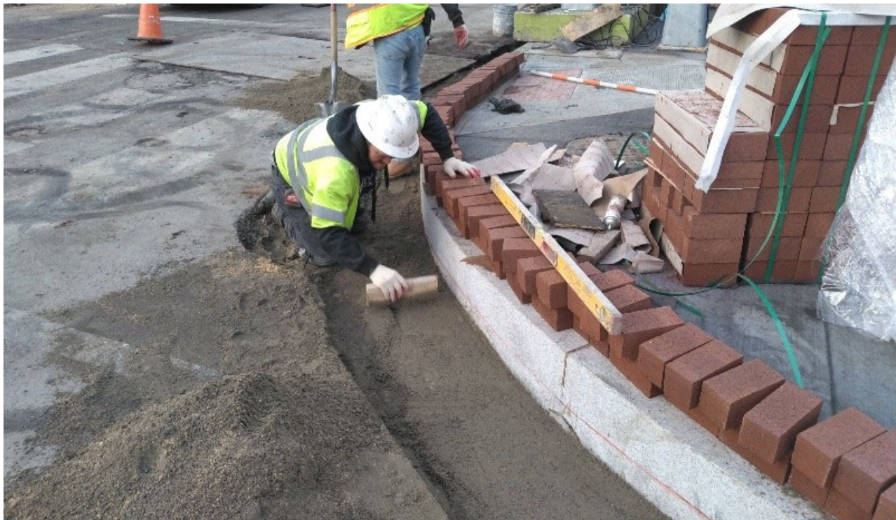
DEN installing Brick Gutter at the corner of T Street and 14 th Street NW