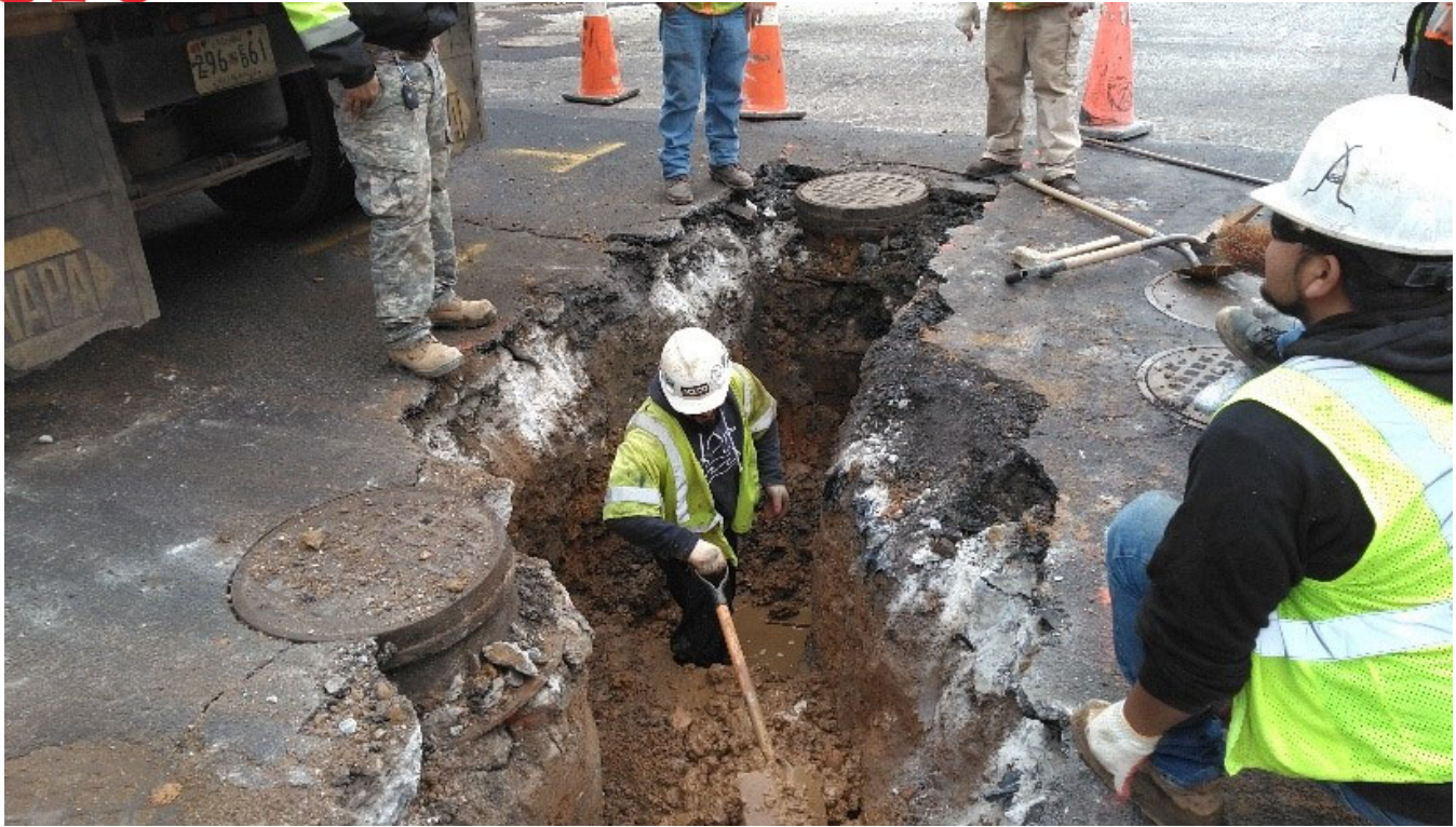
Omni excavating to remove two existing water valve manholes on NB 14 th Street NW at R Street