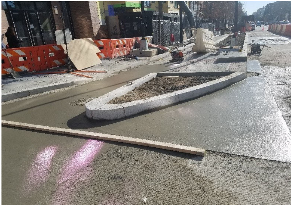
South view of PCC base placement completed