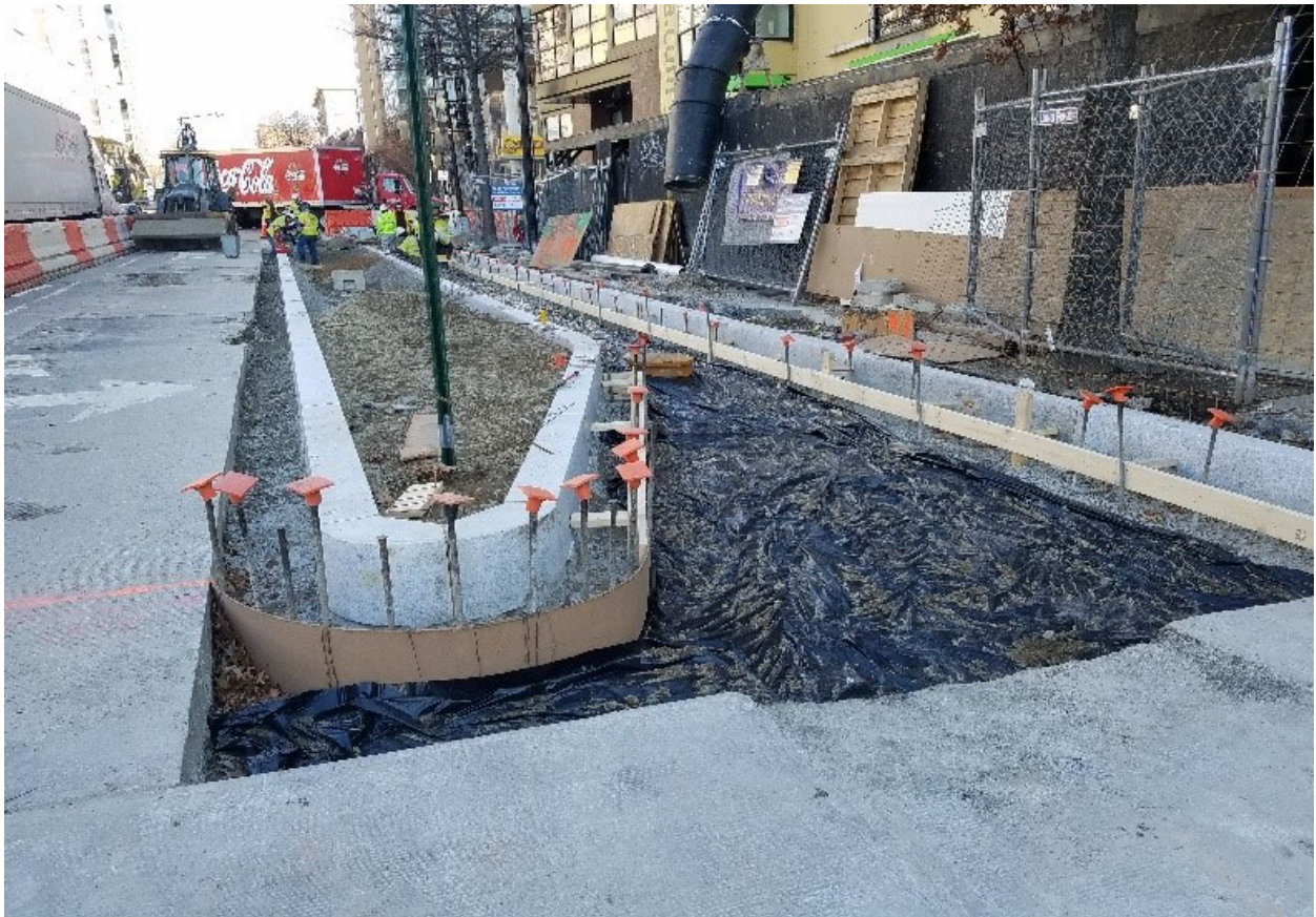
FMCC installing remaining granite curb at SEC of 14 th & Fla Ave