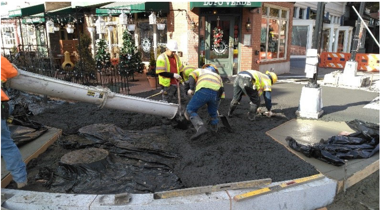
DEN pouring the proposed 4" PCC Sidewalk at the NW corner of T Street & 14 th Street NW