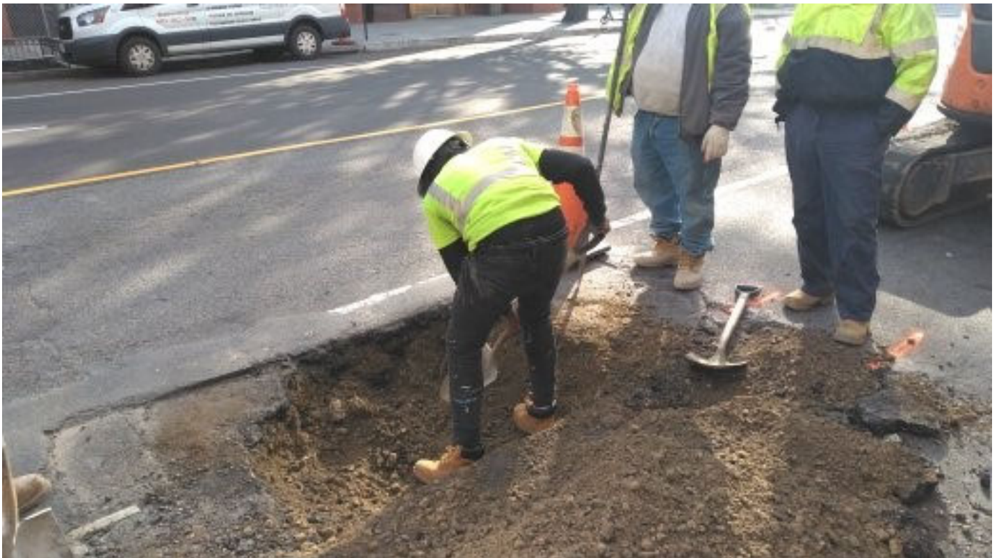
Omni potholing at 1910 14 th Street NW