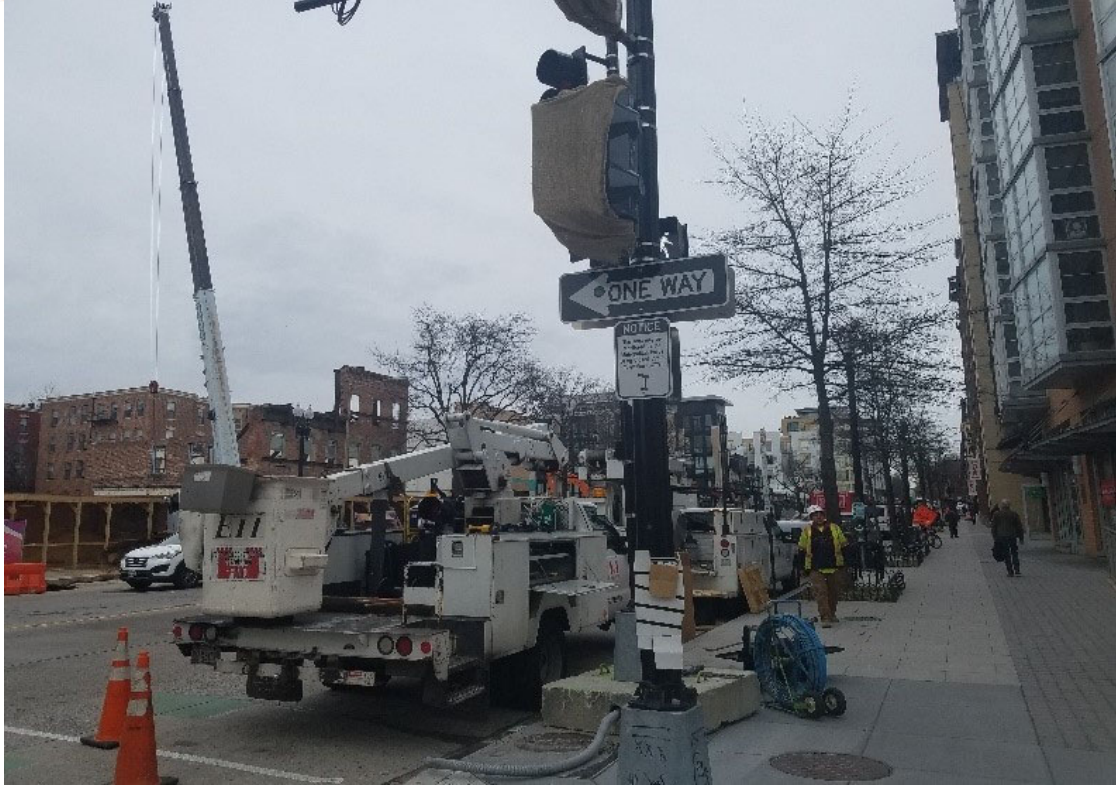
FMCC electrical at NEC of 14 th & V St