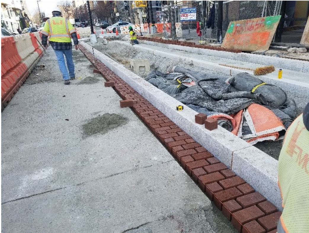
FMCC placing brick gutter at SEC of 14 th & Fla. Ave