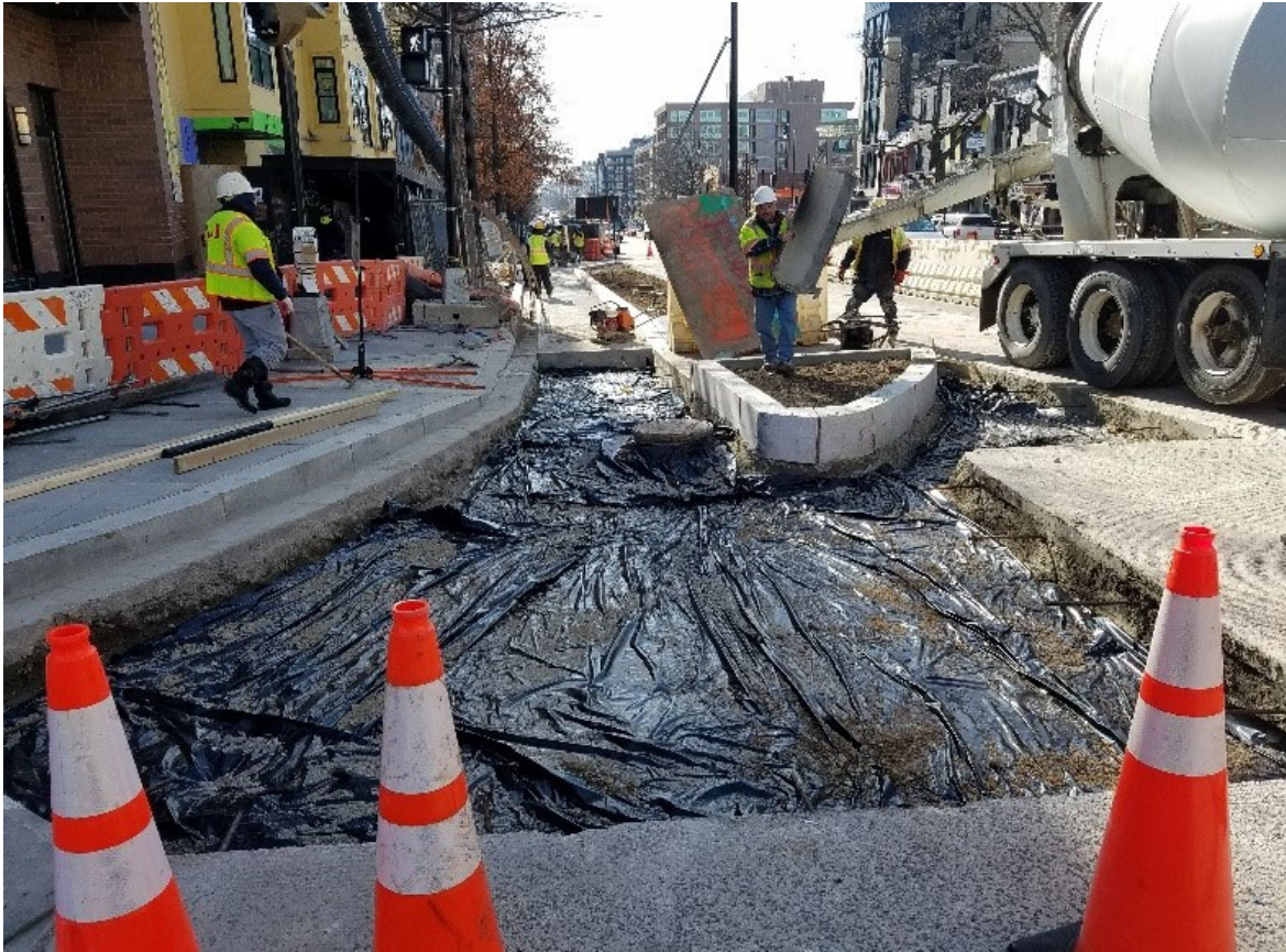
PCC Base placement of concrete underway