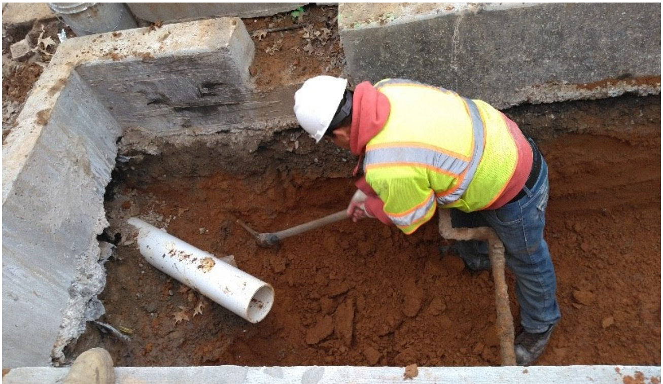
DEN excavating the Bio-Planter No.3 by hand due to the underground utility.