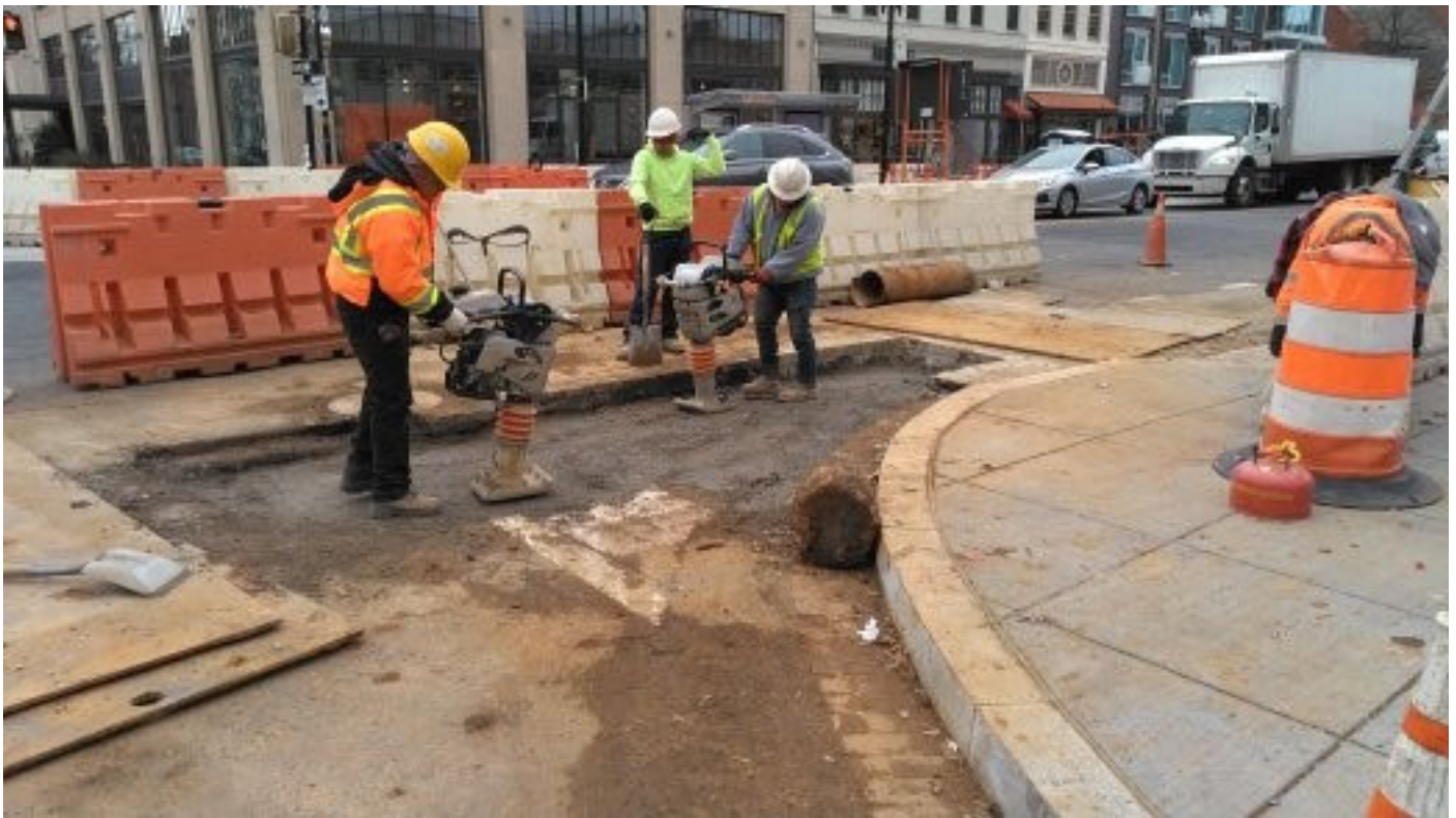
Omni compacting the GAB at the pipe trench at SB 14 th Street NW & R Street