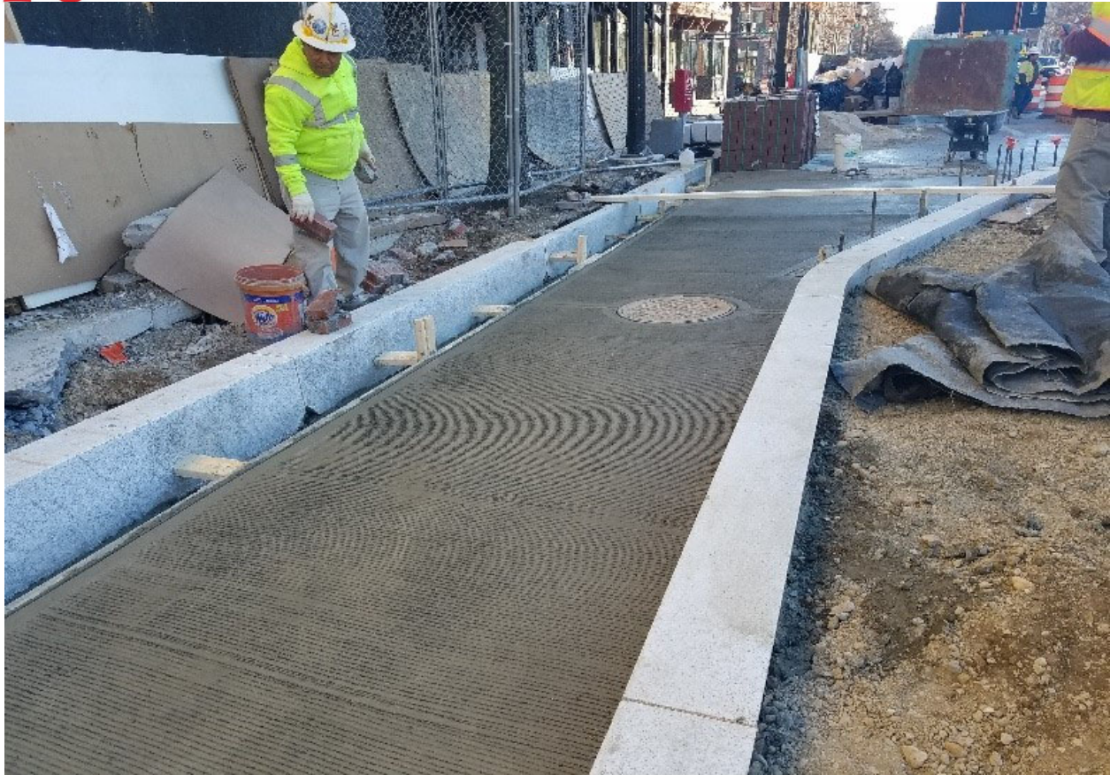
PCC Base at bus island broom finished