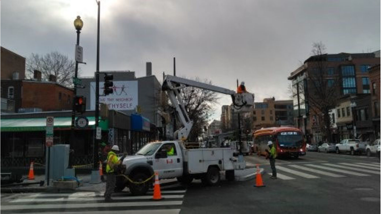
FMCC energizing the traffic signals at P Street & 14 th Street NW