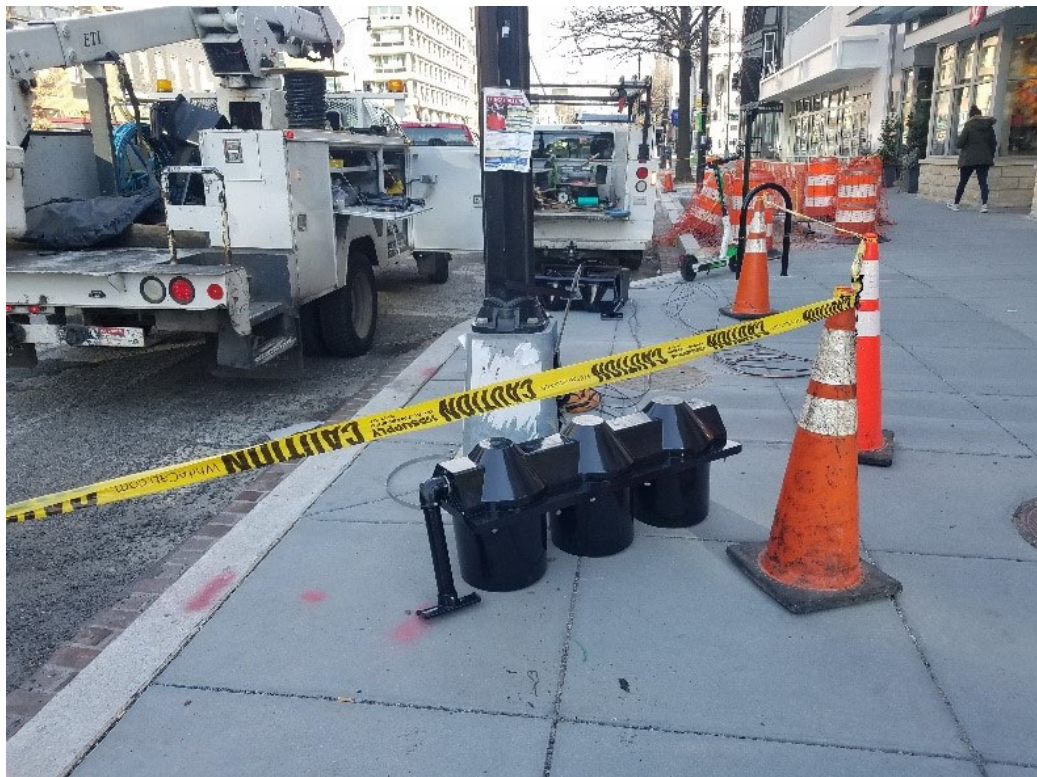
FMCC installing 3 section at L92/TS/PP