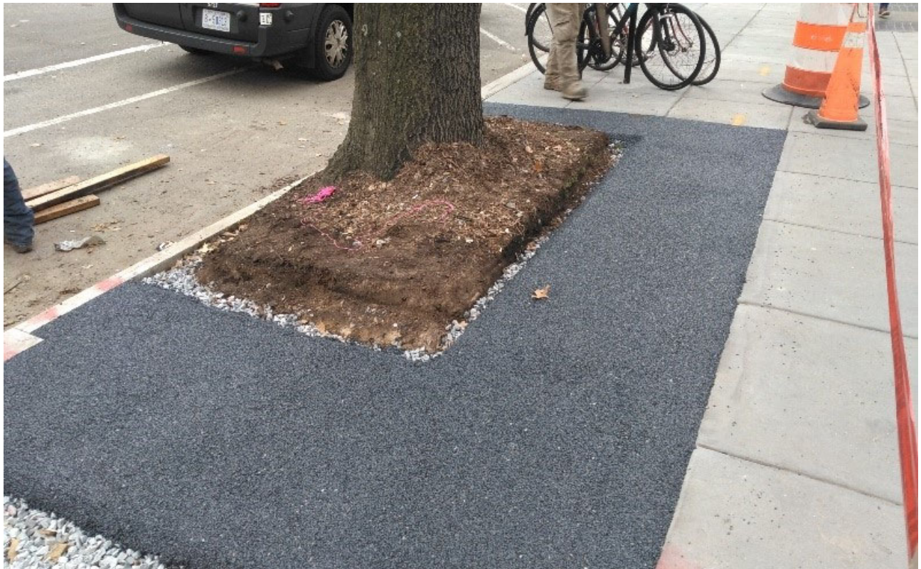
The porous flexible pavement placed at 1630 14 th Street NW

Project Website: www.14thstreetproject.com