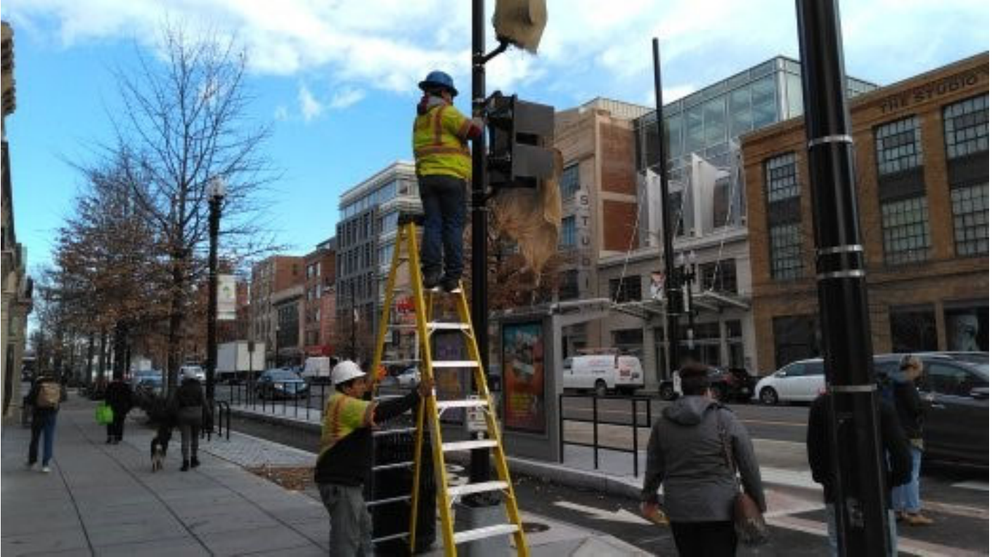
FMCC unbagging the pedestrian signals at P Street & 14 th Street NW