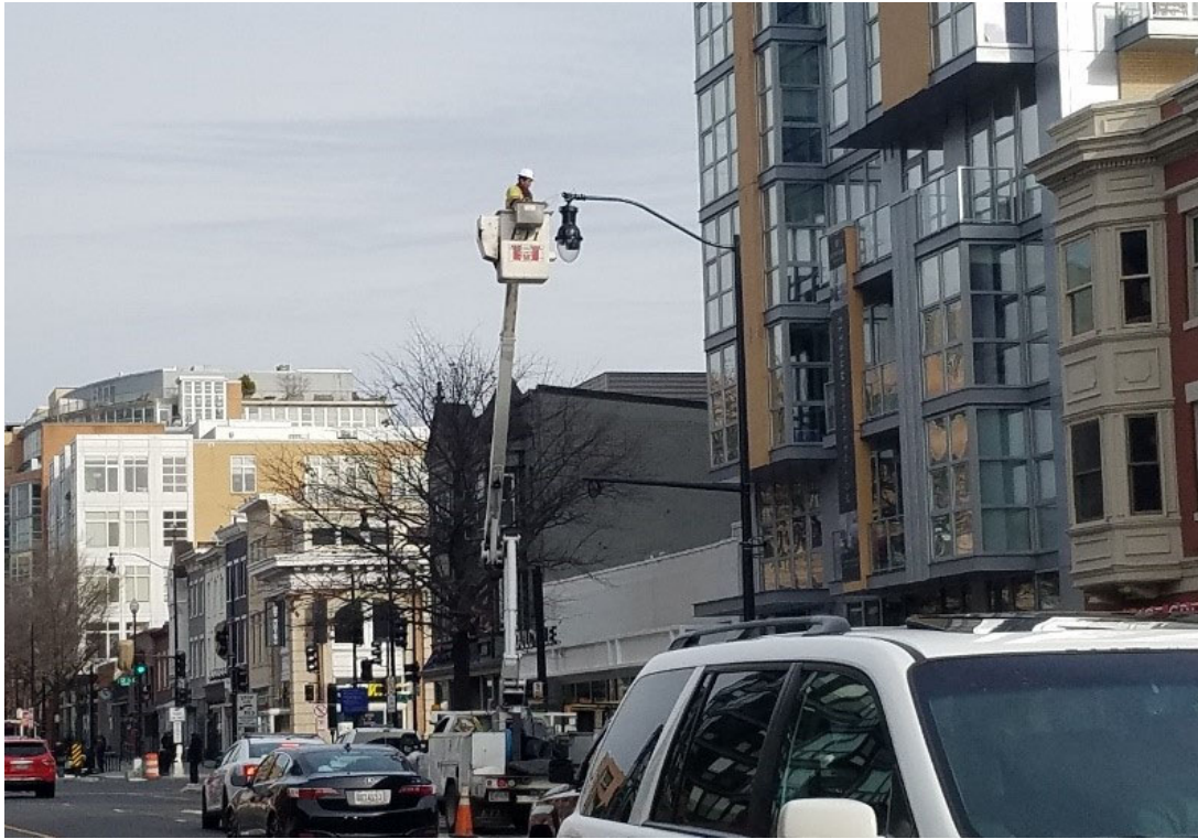
FMCC installing teardrop luminaire at L92/PP/TS