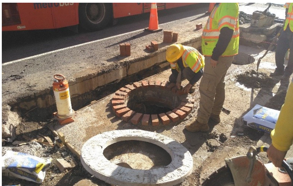
Verizon Subcontractor setting the vault manholes to grade