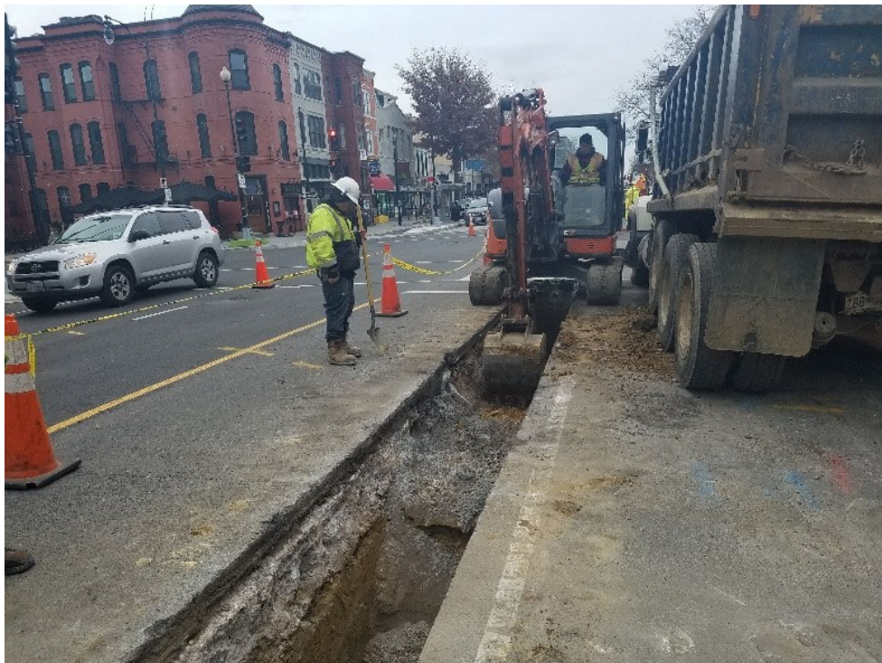
Omni at 14 th St between T St and Wallach St excavating