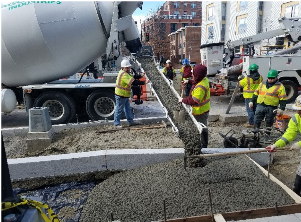
PCC placement at bike lane along SEC of 14 th & Fla. Ave