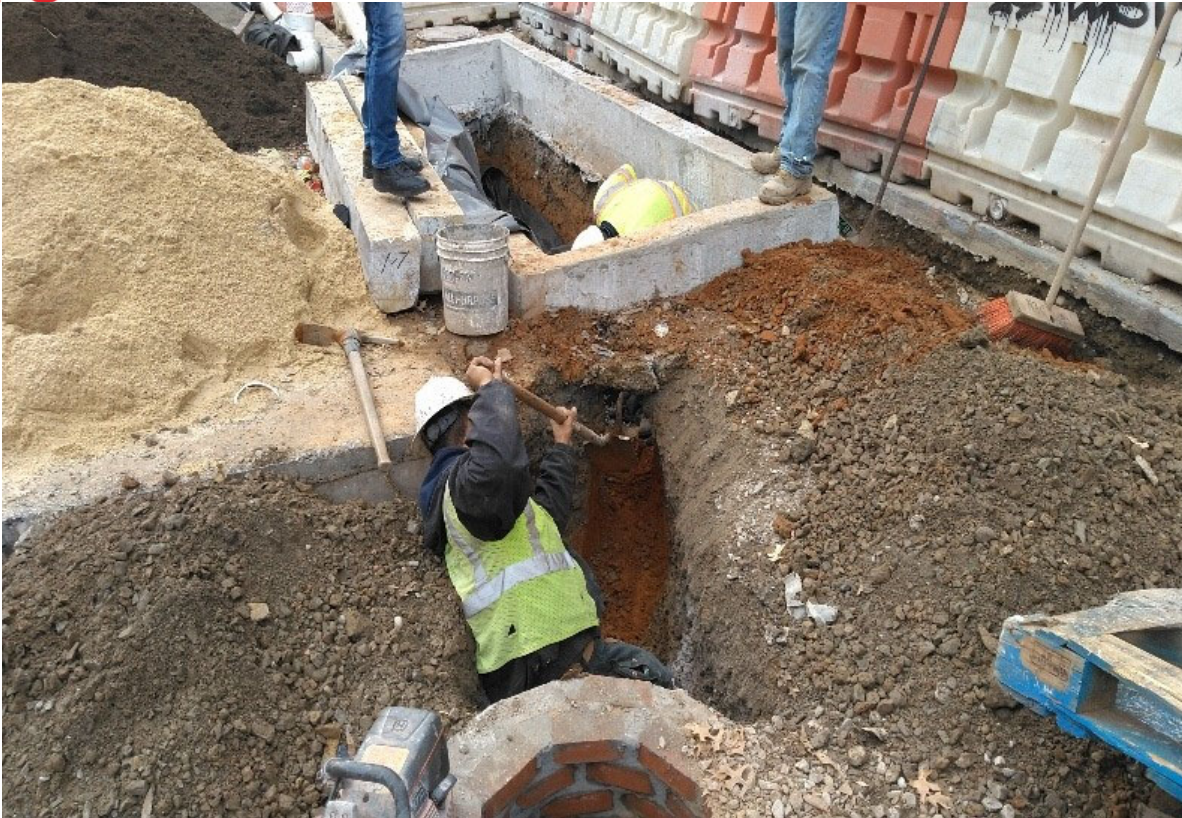
DEN lowered the 6" perforated PVC pipe in the Bio-Planter No.3 and not at manhole