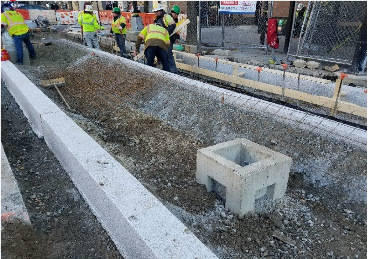
FMCC preparing subgrade for PCC base repair along new bike lane.