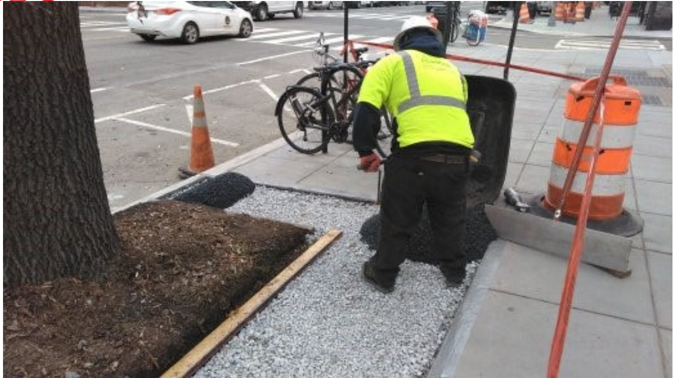
Placing Flex Pavement