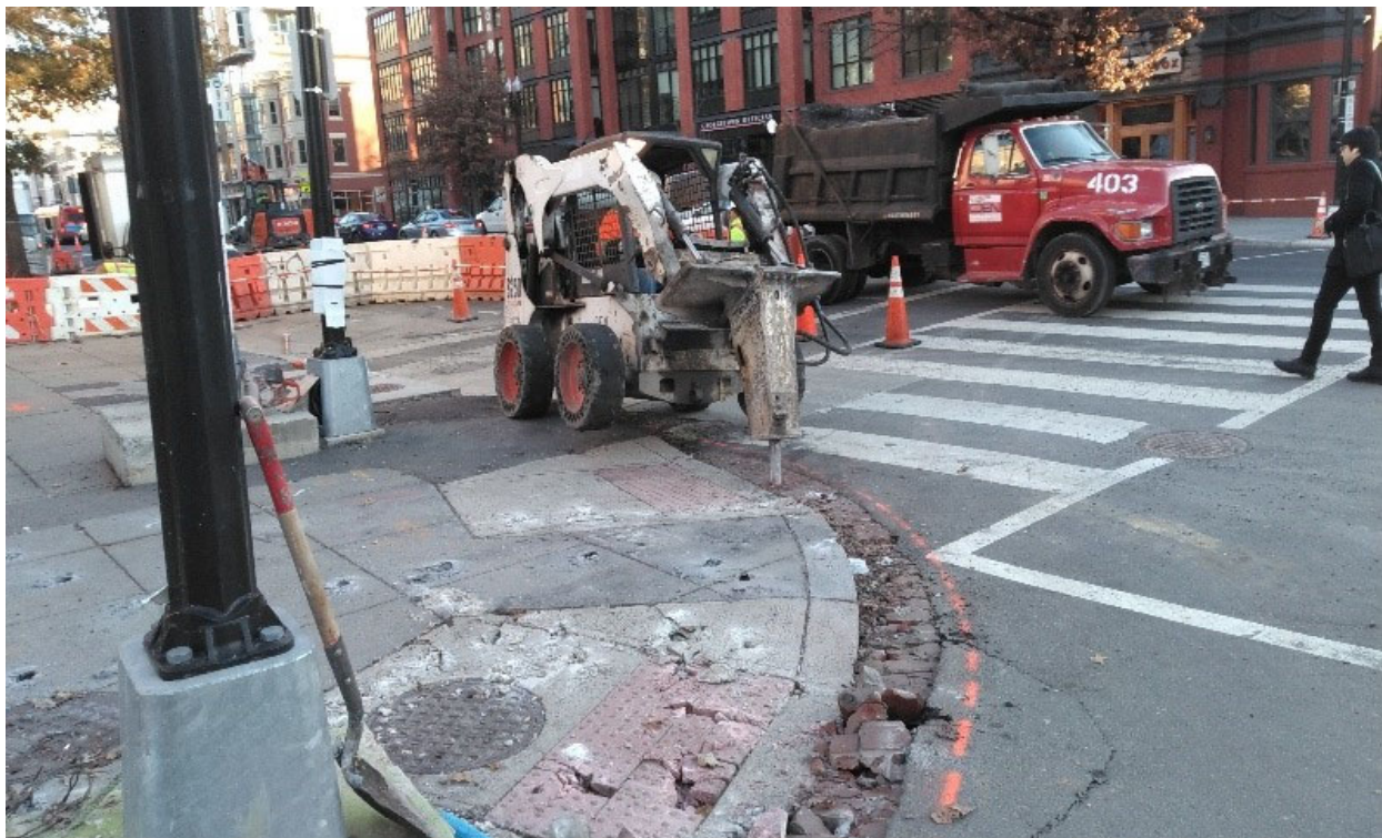
DEN demoing the existing sidewalk, brick curb, and granite curb at the NW corner of T Street & 14 th Street NW