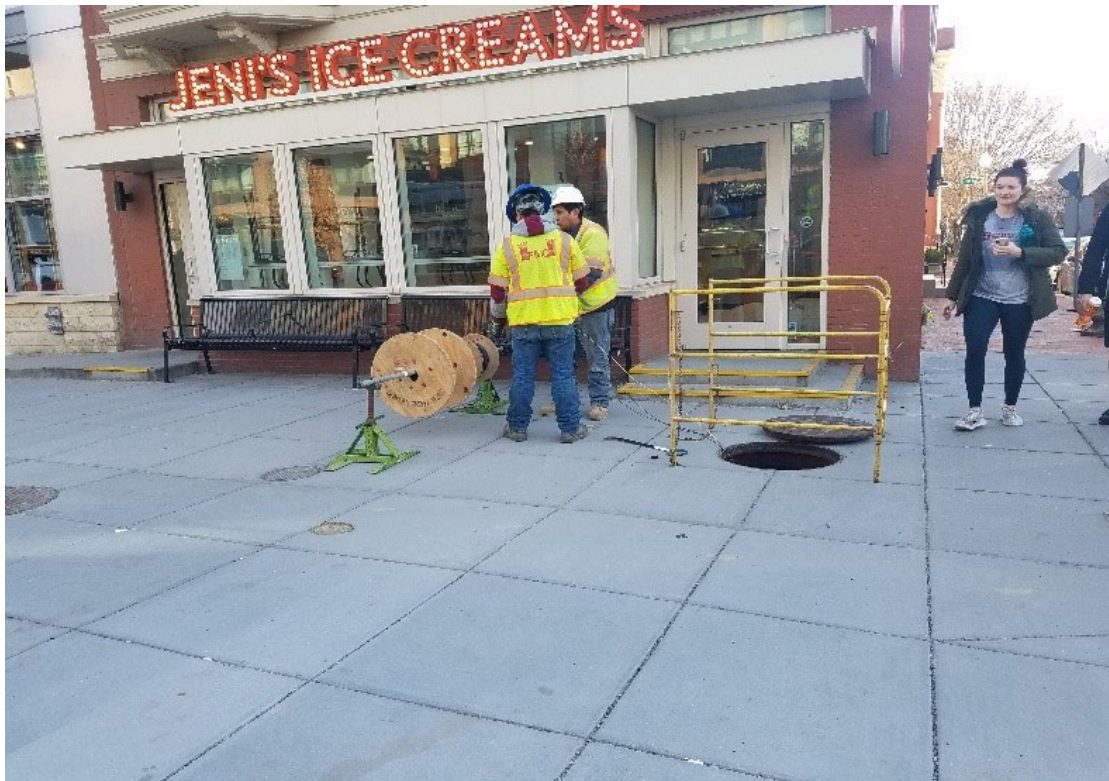
FMCC running cable from manhole M111