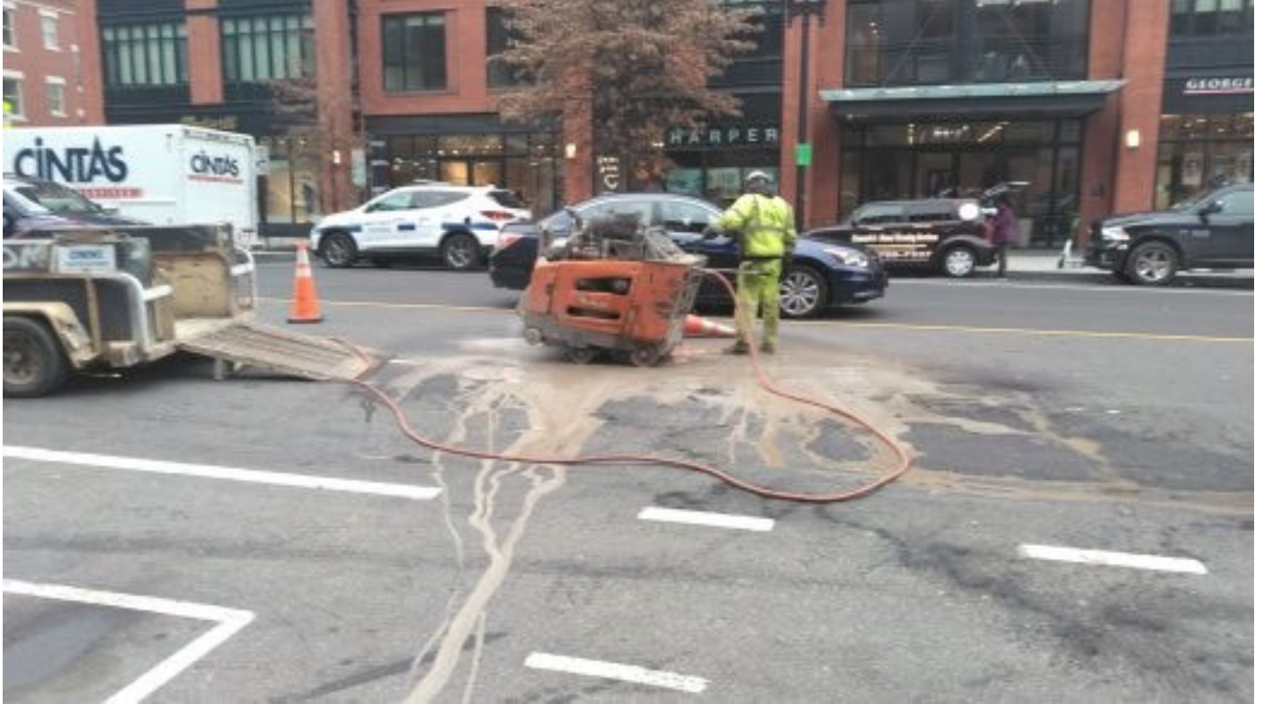
Omni saw-cutting the existing roadway at 1926 14 th Street NW for potholing.