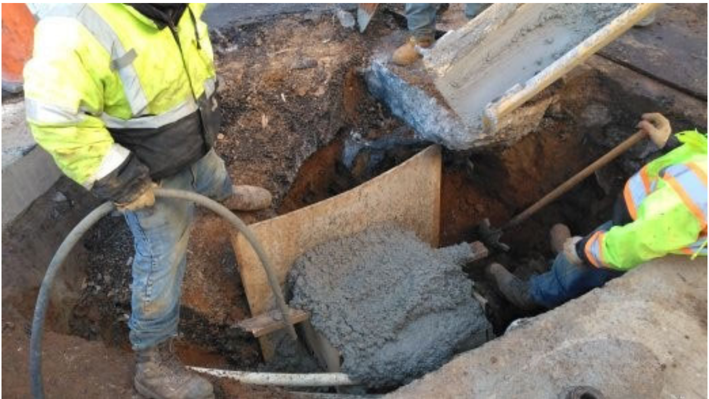
Omni pouring the thrust block for the water main at R Street & 14 th Street NW