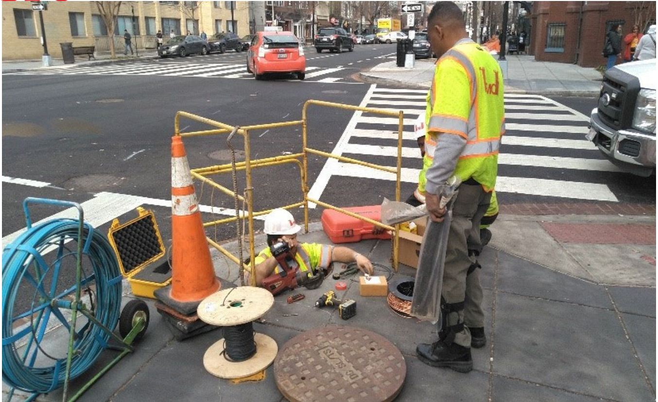
FMCC electrical crew splicing wire in the manhole at NB 14 th Street NW and N Street