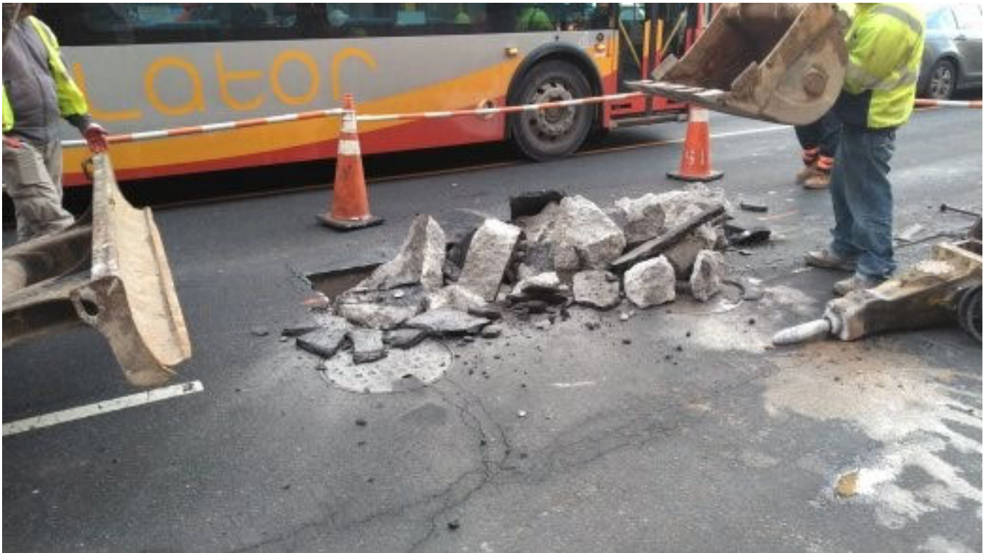
Omni demoed the existing pavement & PCC base at 1914 14 th Street NW