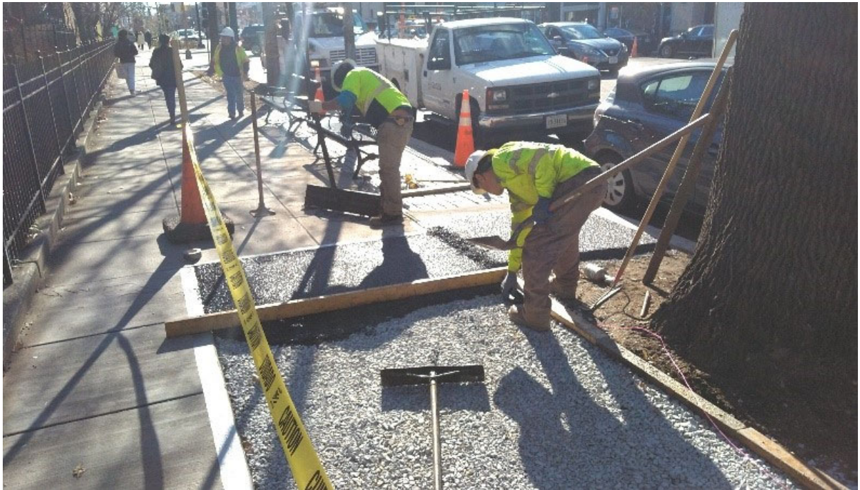
Capital Flexi Pave placing porous flexible pavement on NB 14 th Street across from 1738 14 th Street NW