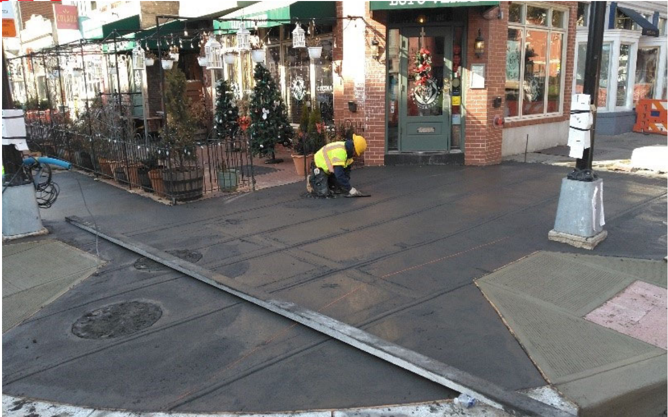
DEN finishing the proposed 4" PCC Sidewalk at the NW corner of T Street & 14 th Street NW