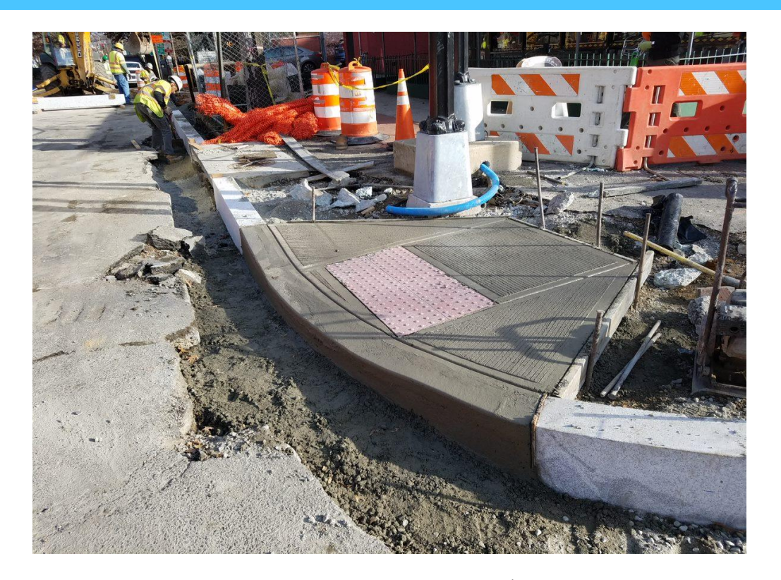
Placing ADA Ramp at the SE Corner of 14th and P Street