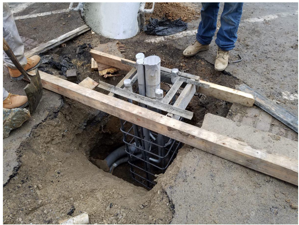
Forming of the Traffic Signal Foundation at the NE corner of P Street