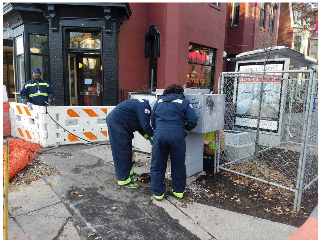
DDOT Technician working on the Traffic Control Cabinet for the relocation at SW corner of P Street