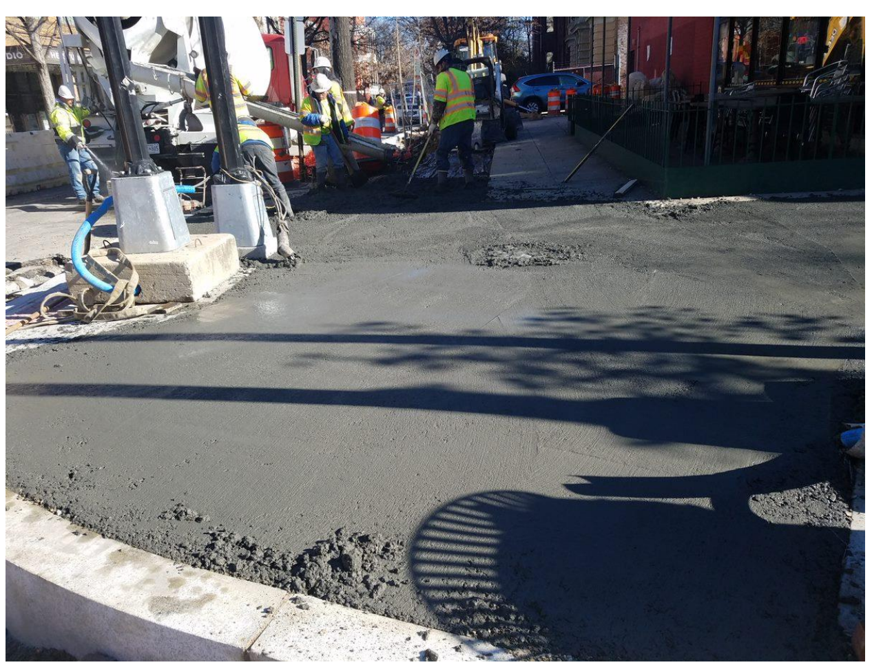
Placement of PCC Sidewalk at the SE Corner of 14th and P Street

Project Website: www.14thstreetproject.com