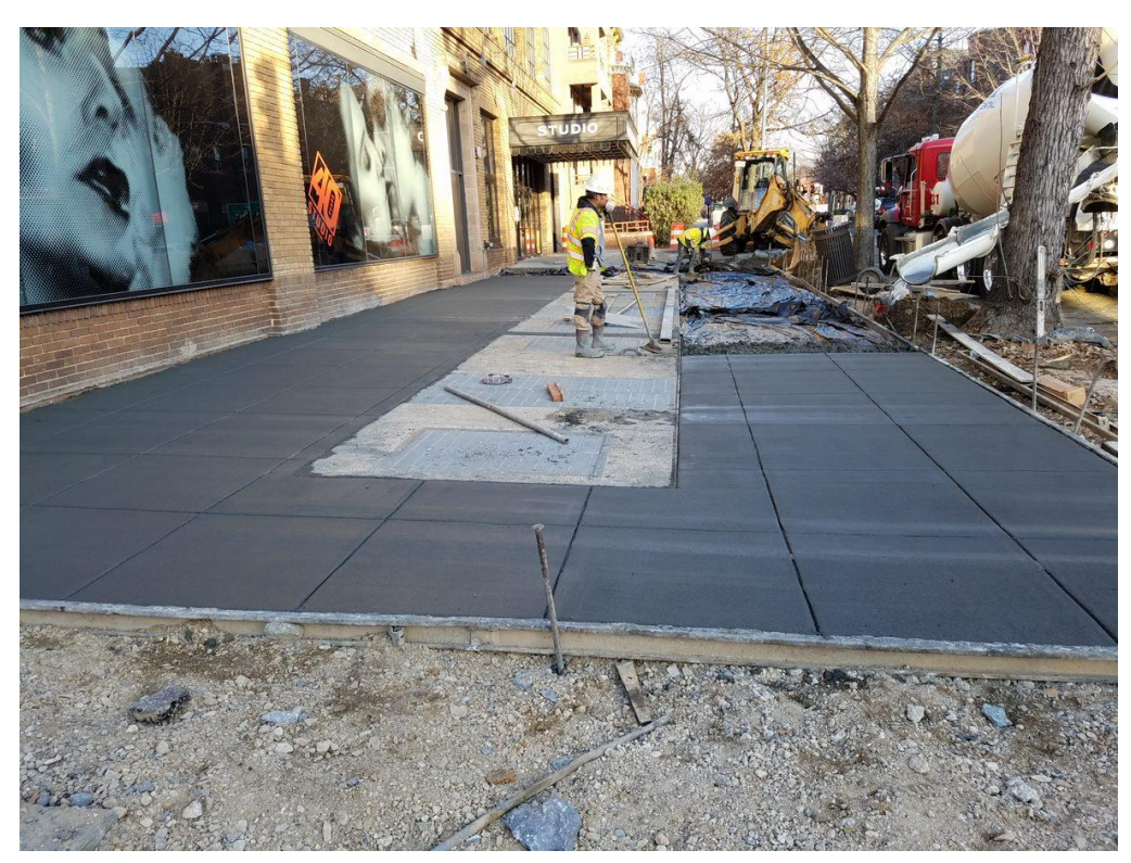
Placement of PCC Sidewalk at the NE Corner of 14th and P Street