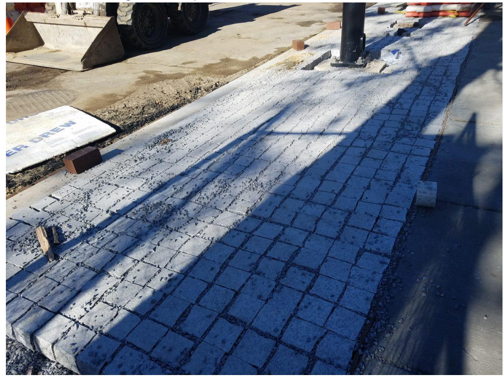
Installation of Granite Cobble Stone between Rhode Island and P Street