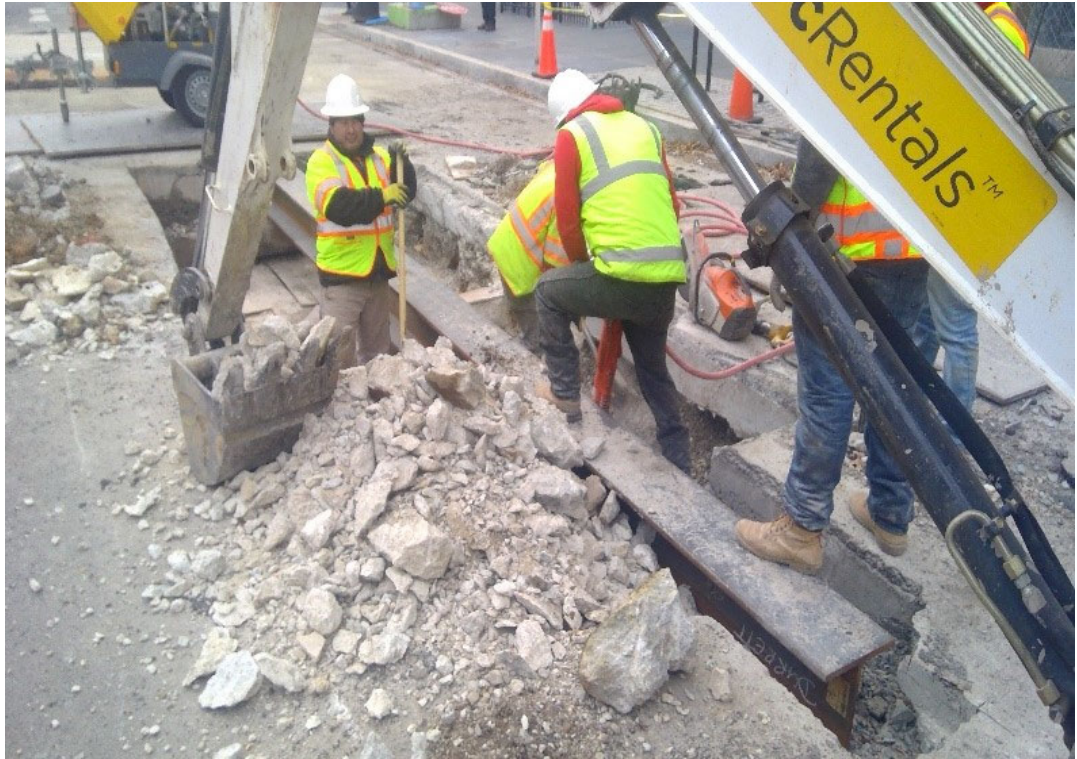
OMNI worked on water line at 14 St NW