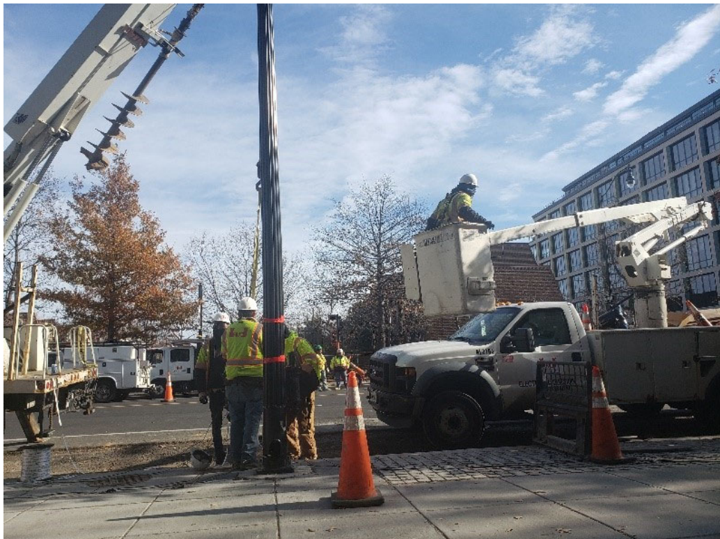
FMCC pulling cable on twing pole street light