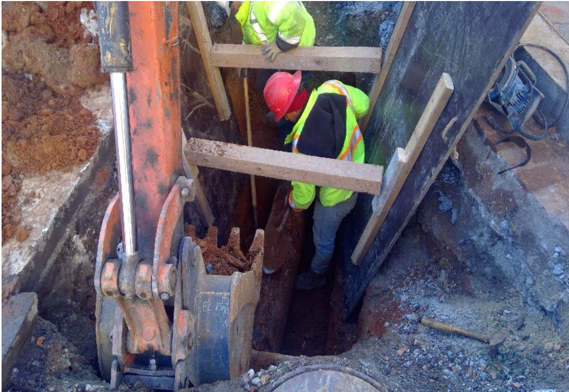
Omni Exposing Water main at R street