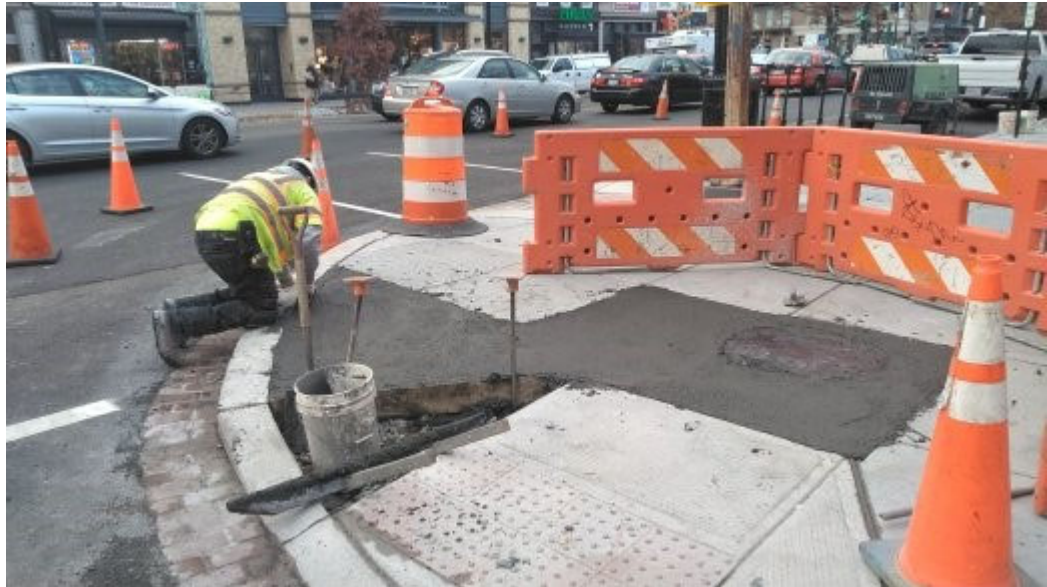
DEN finishing 4" PCC Sidewalk at the NE corner of Riggs and 14 th Street NW which is on the punch-list