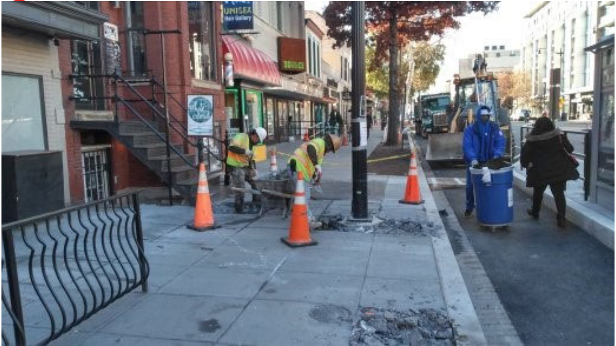
DEN removing PCC sidewalk between S Street and T Street on 14 th Street NW