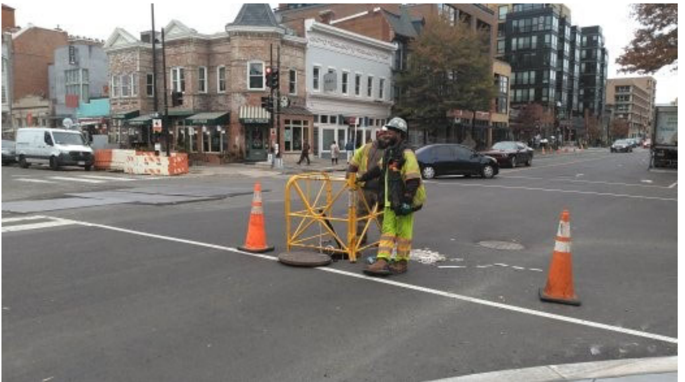
Electrical Crew pulling 100 Pair between r Street and T Street on 14 th Street NW