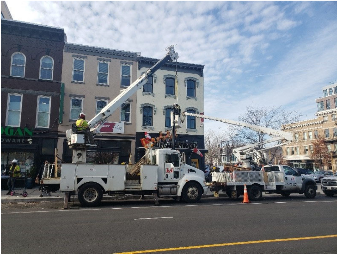
Furnishing twin pole divider on the pole