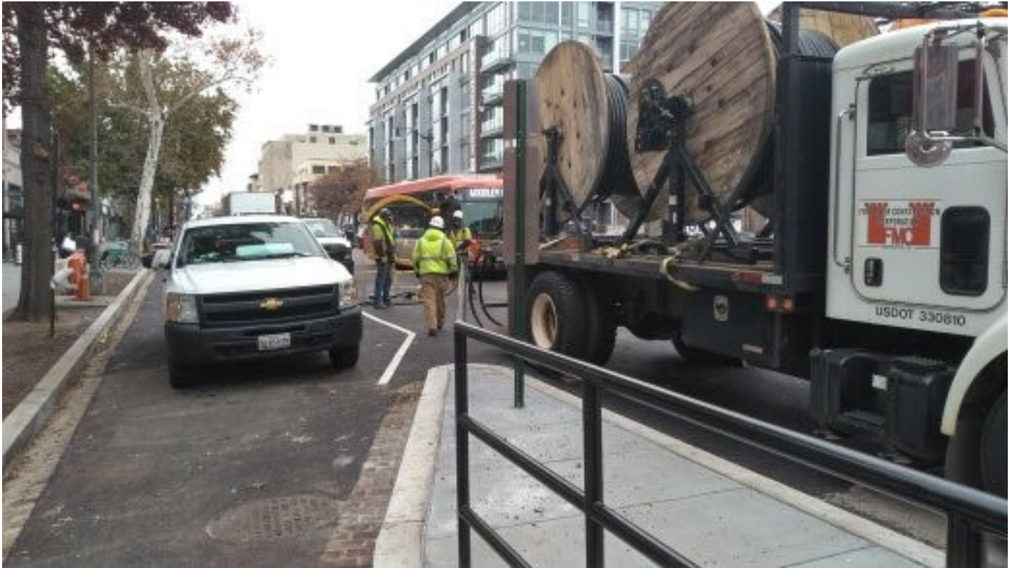
FMCC Electrical Crew pulling 100 Pair communication cable up by T Street on 14 th Street NW