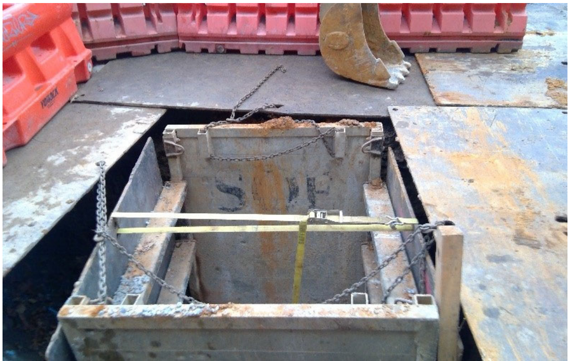
OMNI:manhole construction 14 th St