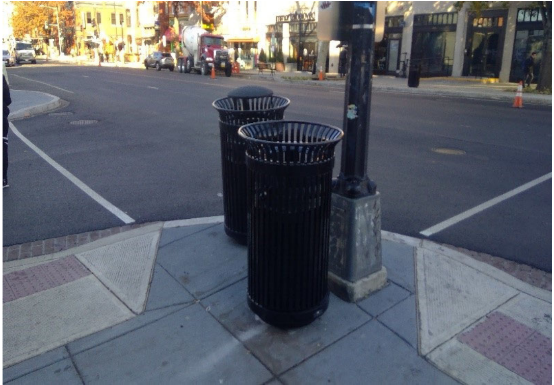
FMMC installation of Litter Baskets at S St and Swann St