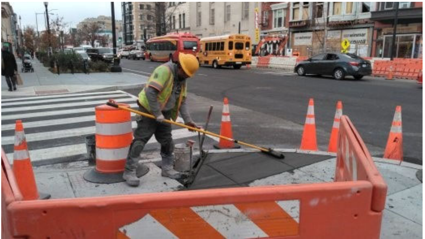
DEN finishing concrete on the SE corner of U Street and 14 th Street NW