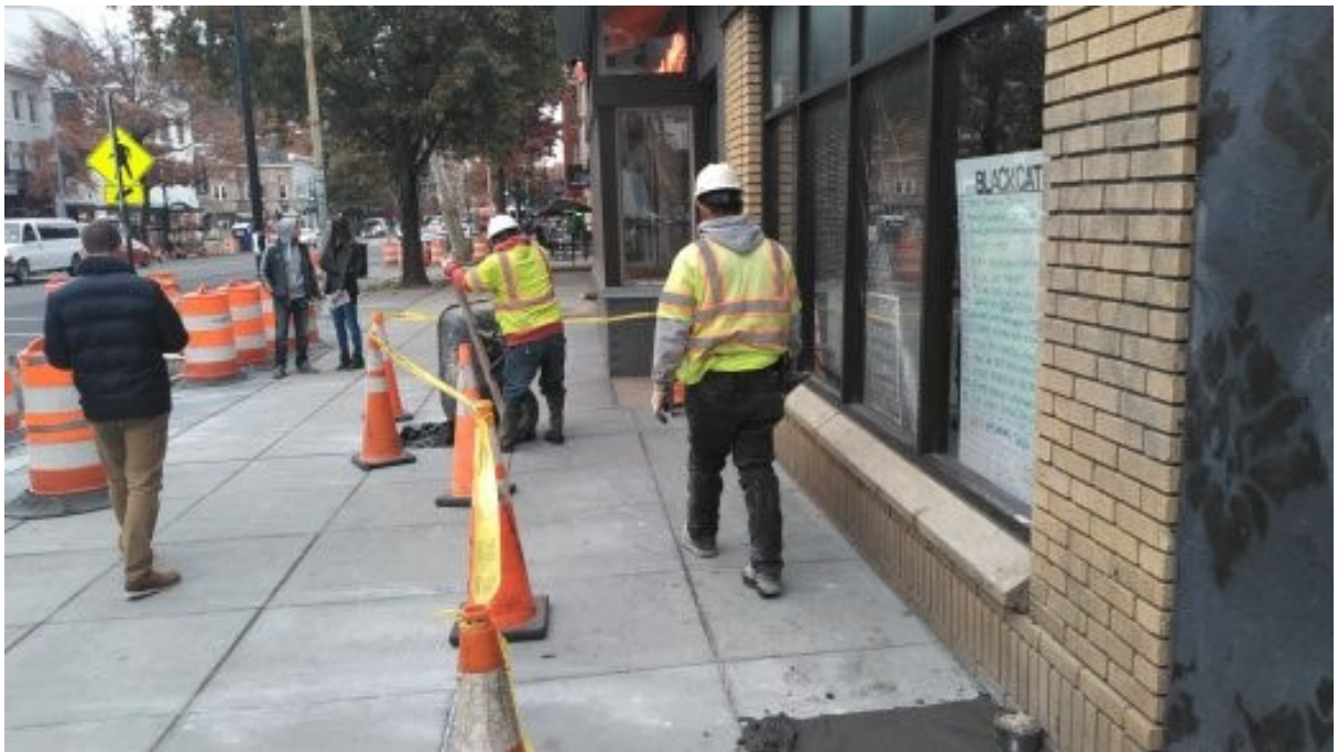
DEN finishing 4" PCC Sidewalk at 1811 14 th Street NW