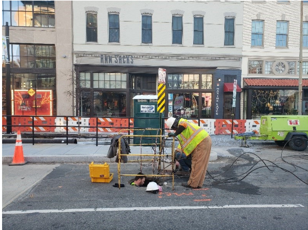
Connecting Cables on Furnished MH