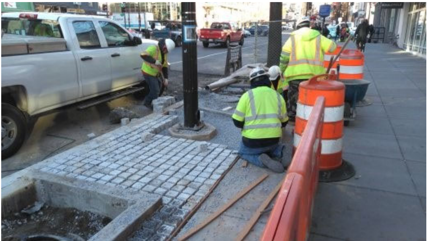
DEN installing permeable paver sidewalk at 1925 14 th Street NW