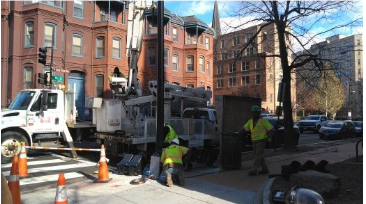
FMCC installing a 28.50' signal/light pole at the SE corner of N Street and 14 th Street NW