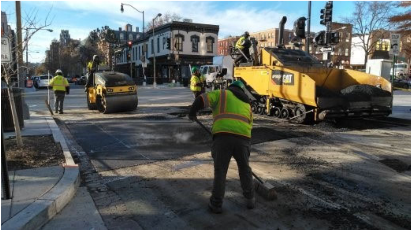
FMCC paving W Street tie in east of 14 th Street NW.

Project Website: www.14thstreetproject.com