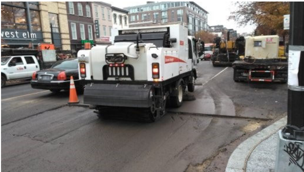
FMCC sweeping the parking and outside lanes on 14 th NB Street NW prior to paving.