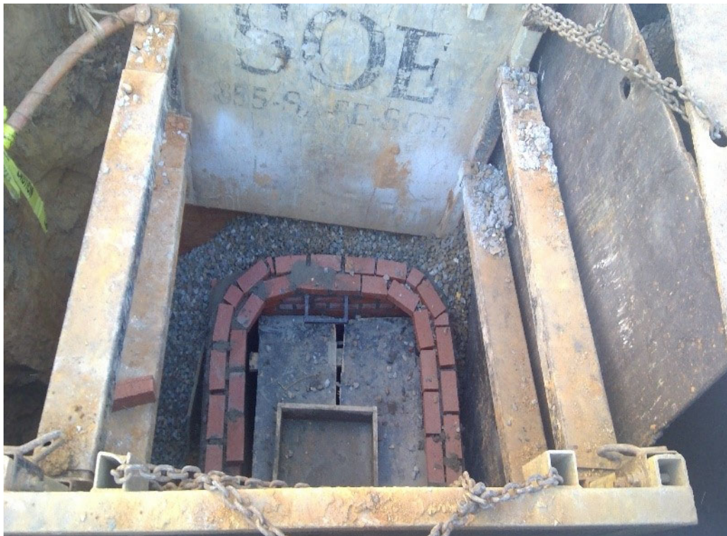
OMNI worked on the manhole construction 14th St