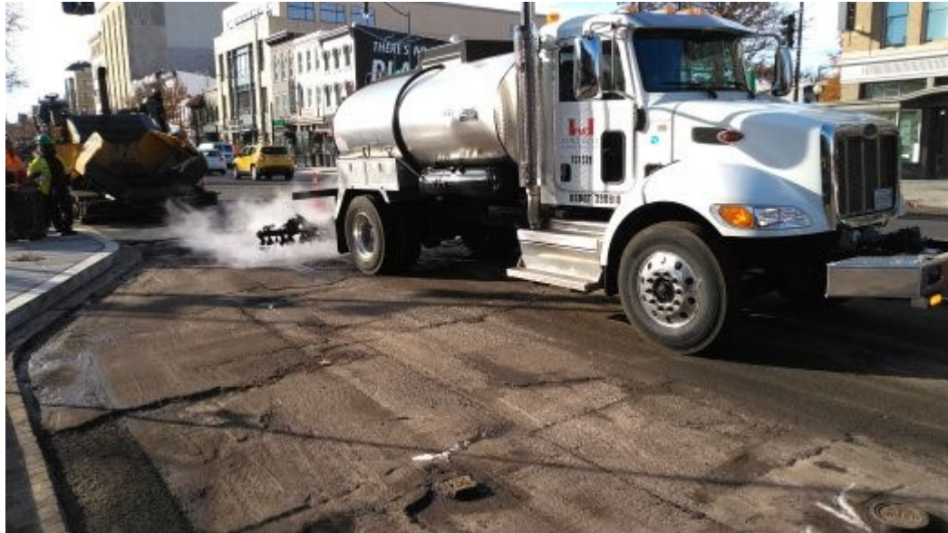
FMCC applying tack to the parking lane and outside lane of 14 th Street between S Street and T Street