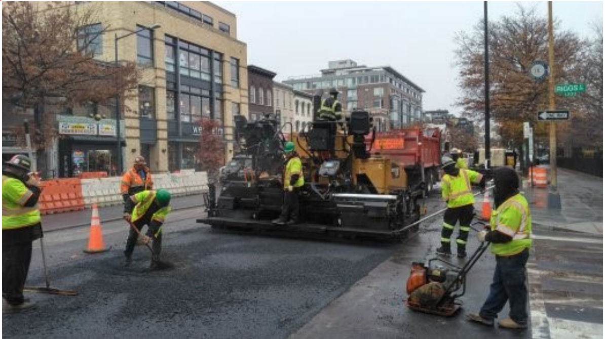
FMCC paving the parking lane and outside NB lane to 14 th Street, NW