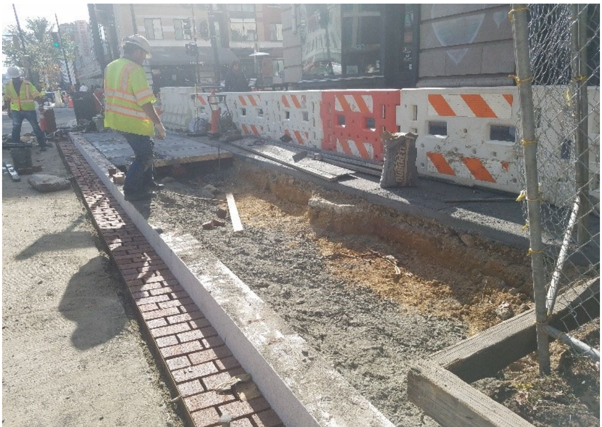
Granite curb brick gutter placed at 1700 14 th St