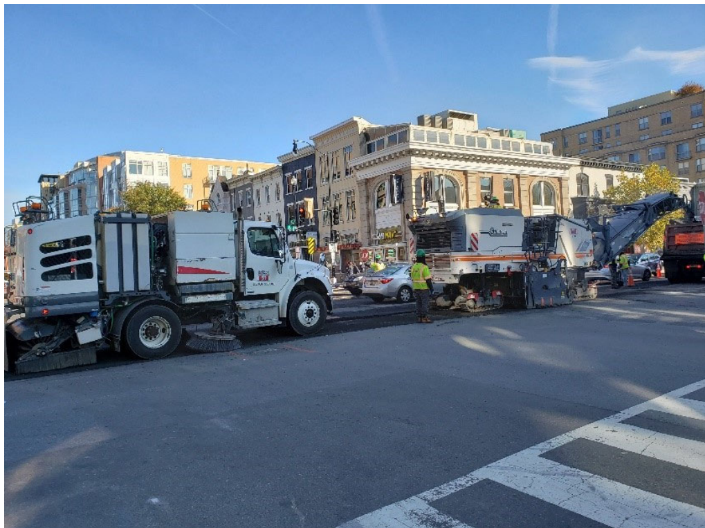
FMCC Asphalt Division Milling Operation In-Progress at U St. & 14 th St. near 2001 Block at Subway.