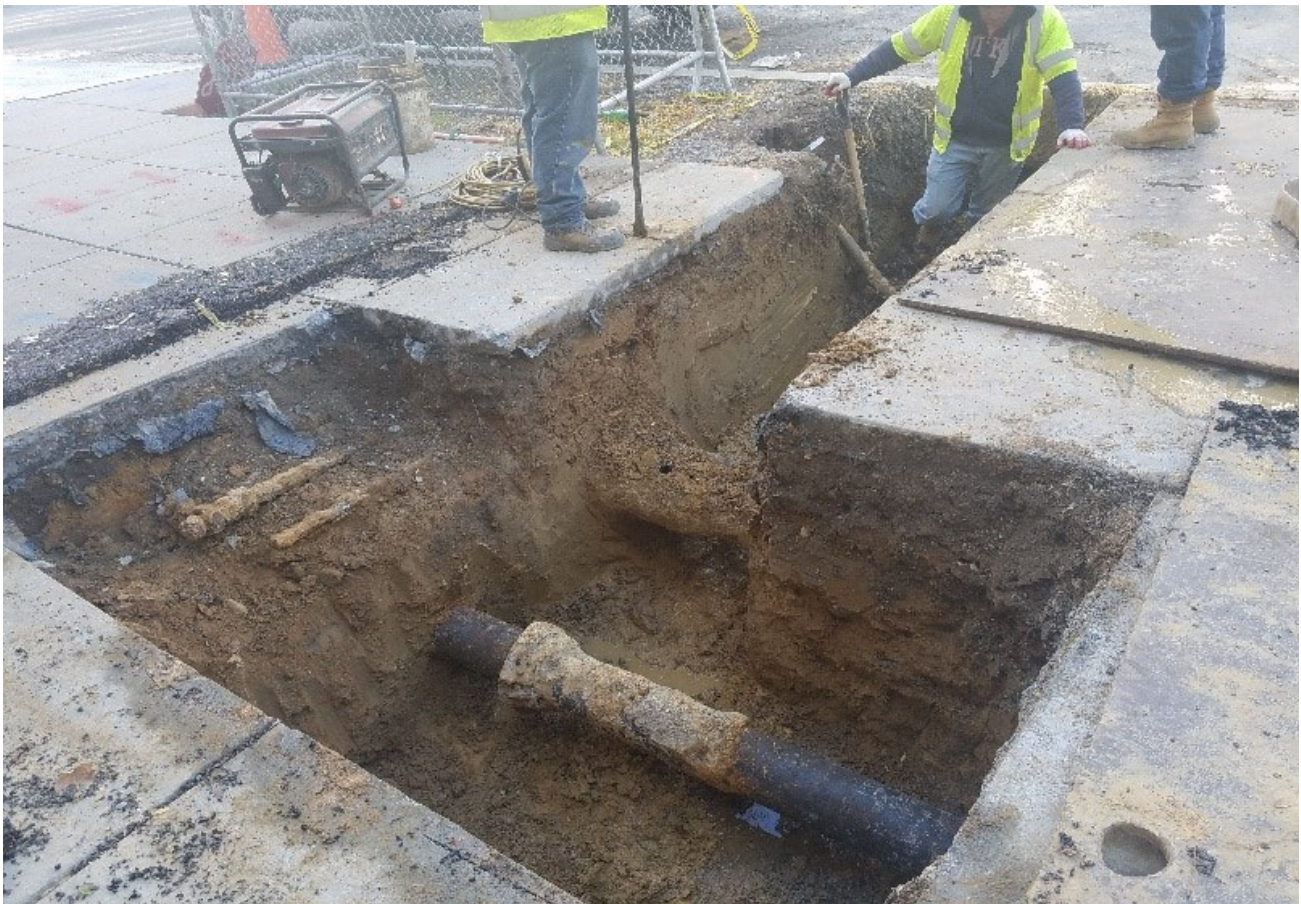
Existing 6" main to be connected to new 8" main by Omni