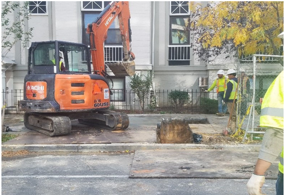
Omni at 1338 14 th St preparing water main for tie-in