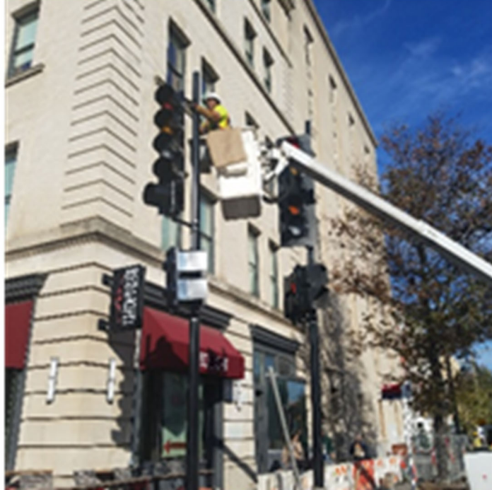
FMCC electrical crew adjusting signals at R St