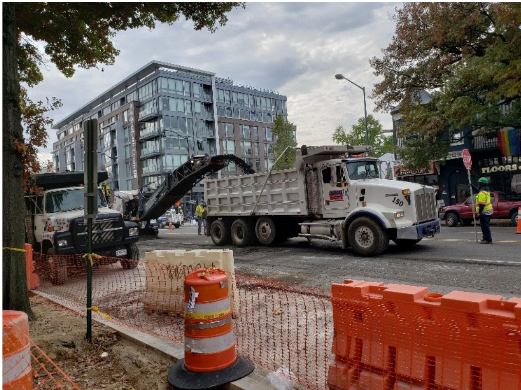
FMCC Asphalt crew Milling Operation In-Progress on Thursday, 11-7-2019 from R St. thru S St. to T St. and Wallach Place at 14 th St. NW Corridor.