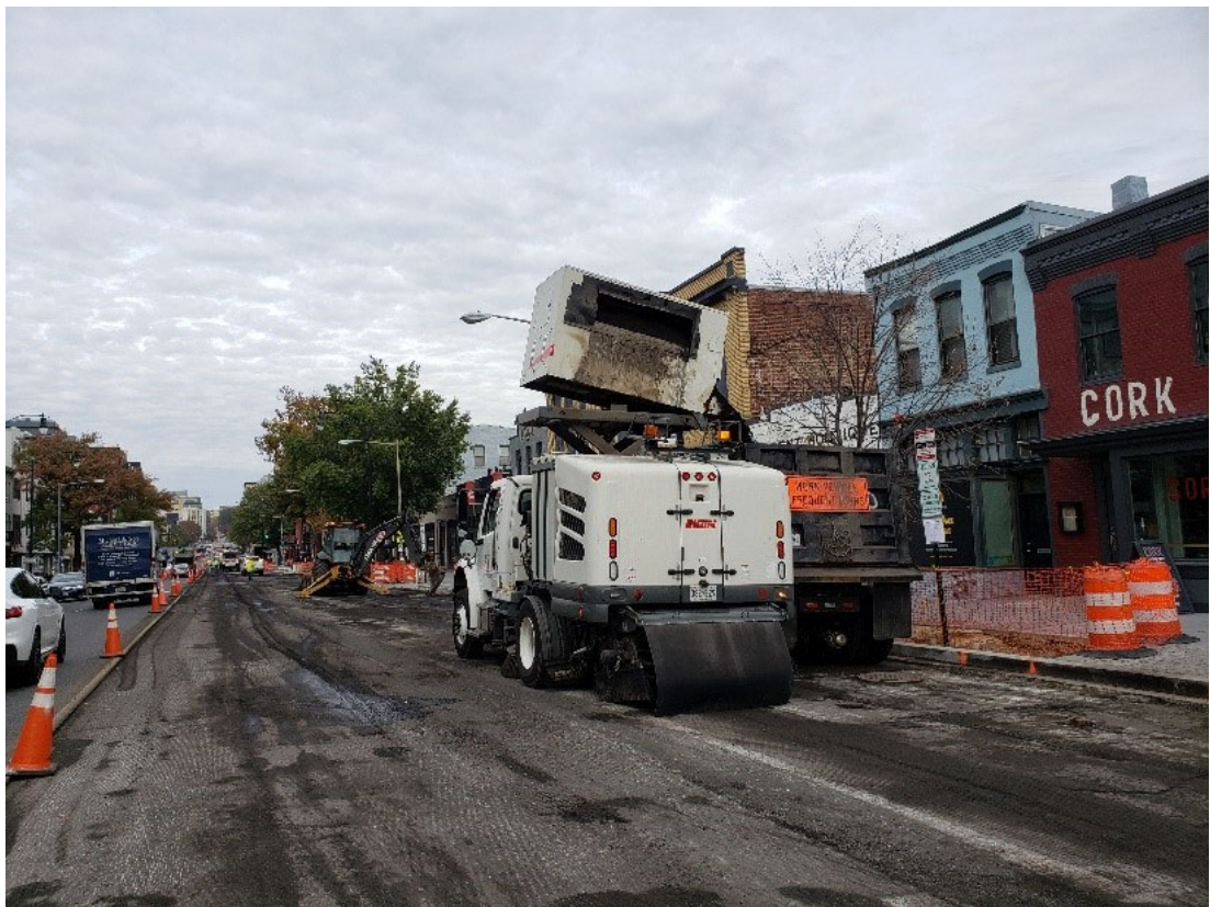
FMCC Broom Truck swept the dust and debris continuously to eliminate dust and debris along 14 th St. NW during the Milling Operation on Thursday, 11-7-2019.