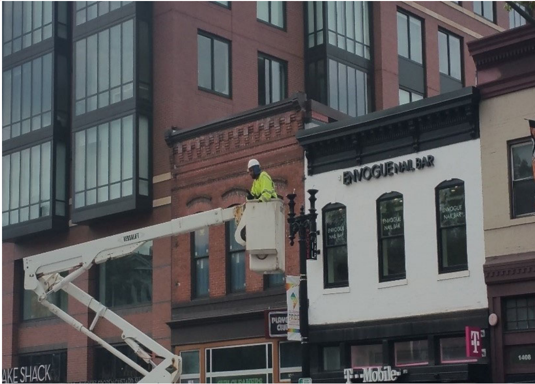
Installation of globe at twin pole L27