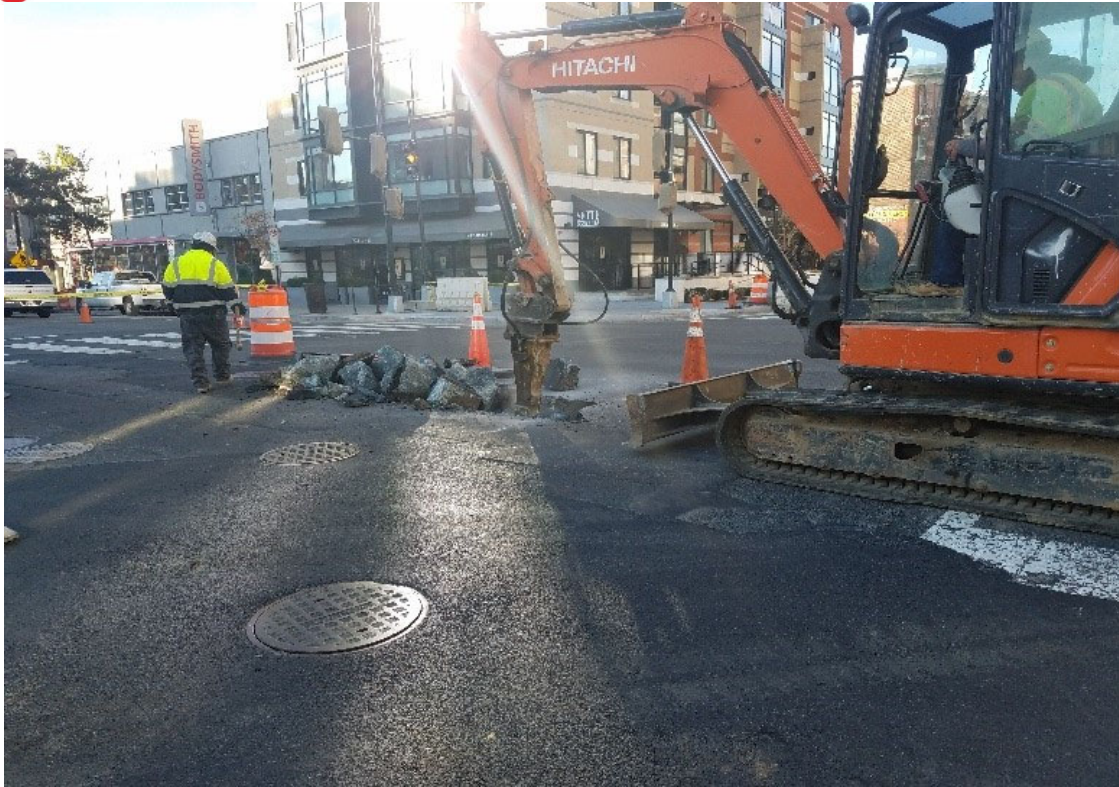
Excavation of electrical conduit trench by Omni from M49