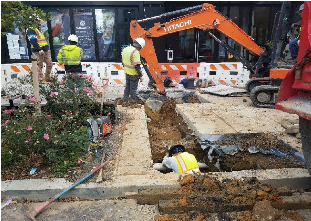
Excavation for tie-in to existing 6" main