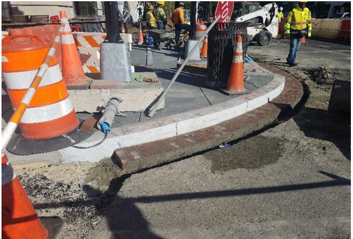
Brick gutter was placed at NWC of 14 th & R St.