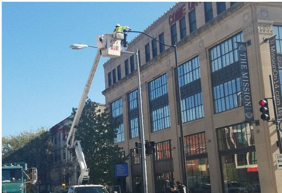
Luminaire installation at L60 at SEC of 14 th & R St