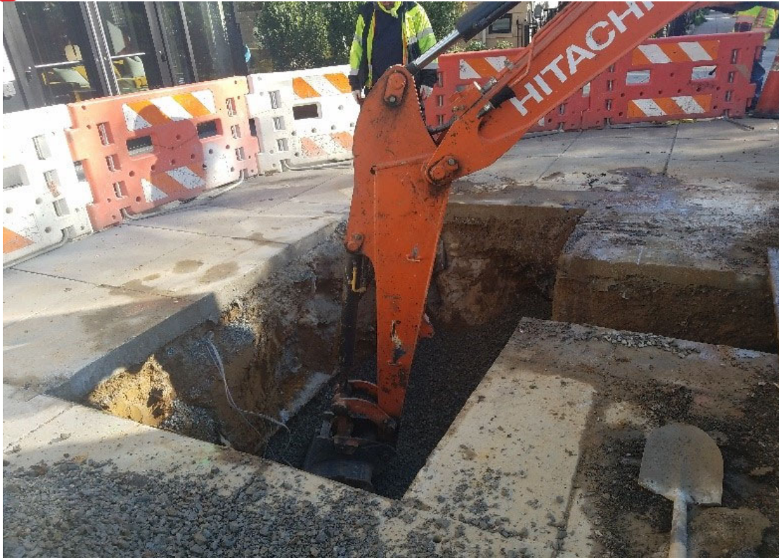
Omni excavating for connection to 6" tie-in at 1357 R St