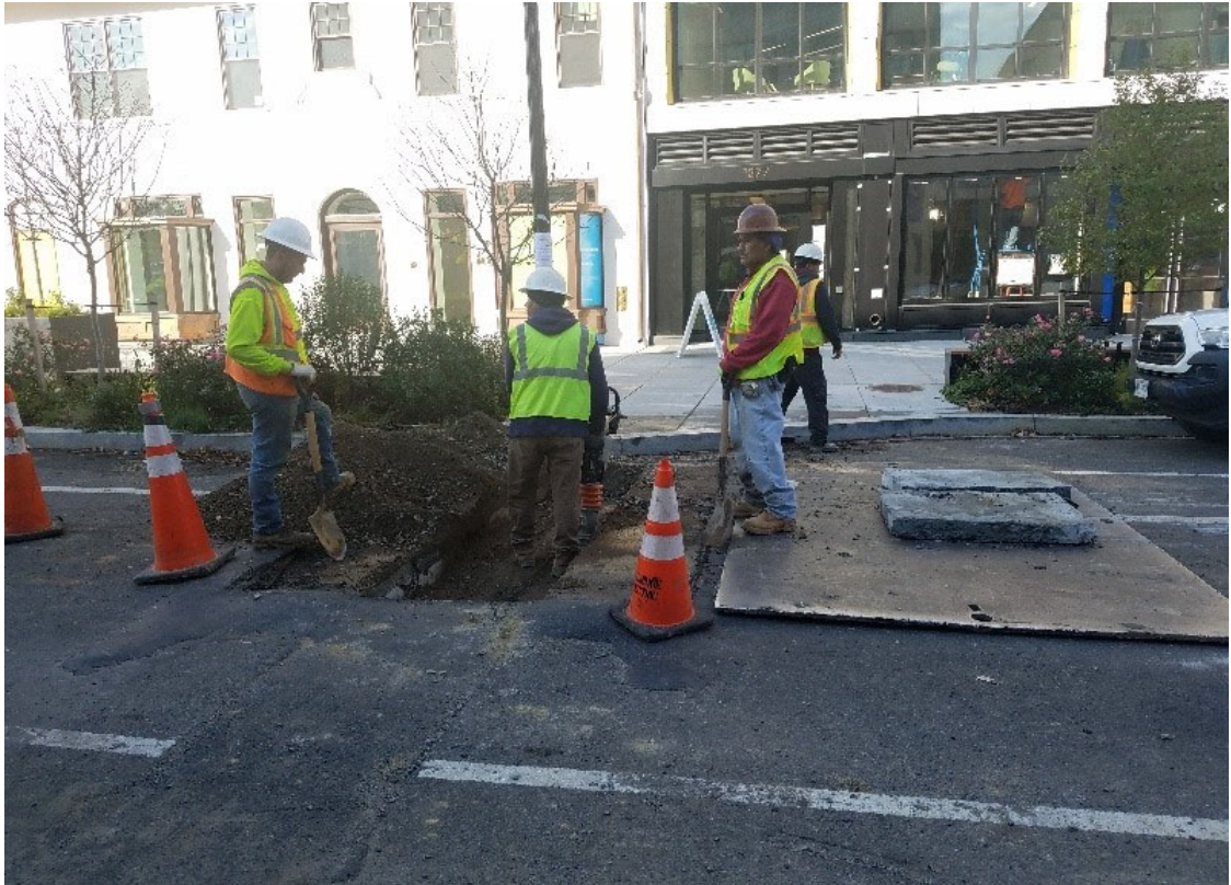
Backfill of trench and removal of steel plate by Omni.