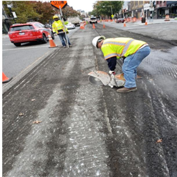
FMCC Asphalt crew also saw cut the exposed portion of Old Track Metal Railing eliminating a potential Roadway Hazardous condition, on Thursday, 11-7-2019.