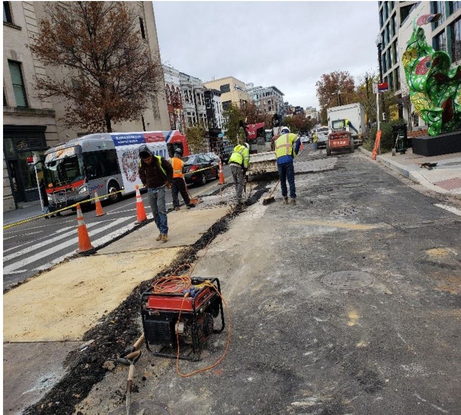
OMNI, Inc. secured and Welded total Ten (10) Steel Plates on Saturday, 11-9-2019 at Intersection of R St. & 14 th covering the Traffic Signal Trench NB.