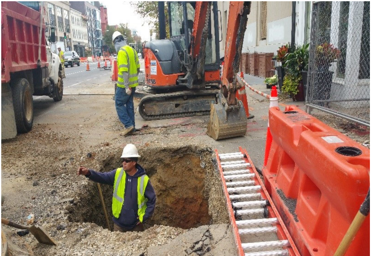
Omni excavating for single catch basin CB-18 at 1712 14 th St