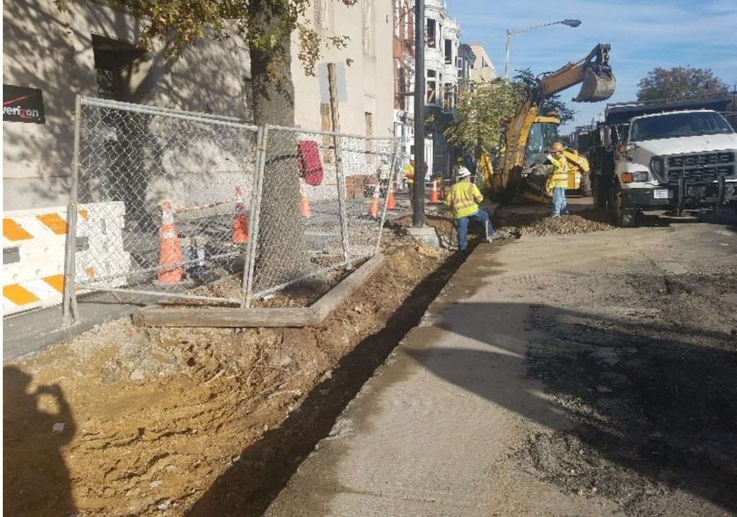
Excavation at NWC of 14 th & R St for curb and gutter Cooper Landscaping crew placed Planting Soil Mix near Corcoran St. & 14 th St NW at NB.