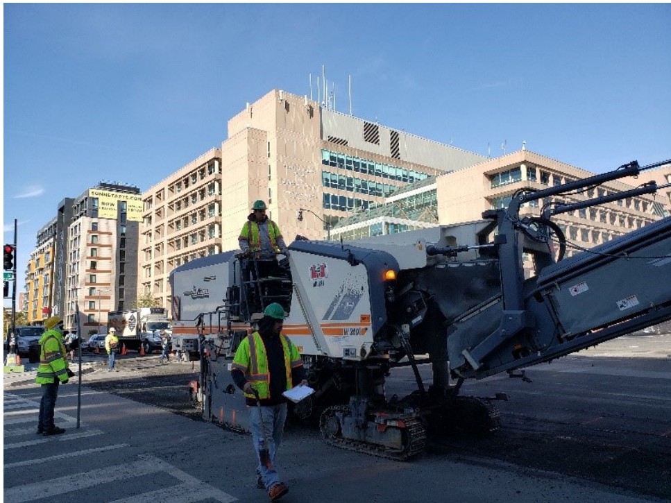
FMCC Milling Machine Milled near the Cross at Intersection U St. & 14 th St. NW near Capital One 1947 Block of U St. NW.