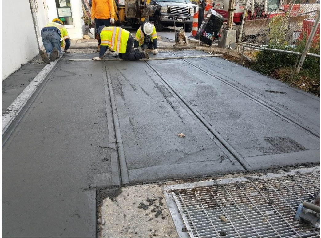
PCC sidewalk placement by D.E.N. at 1712 14 th St