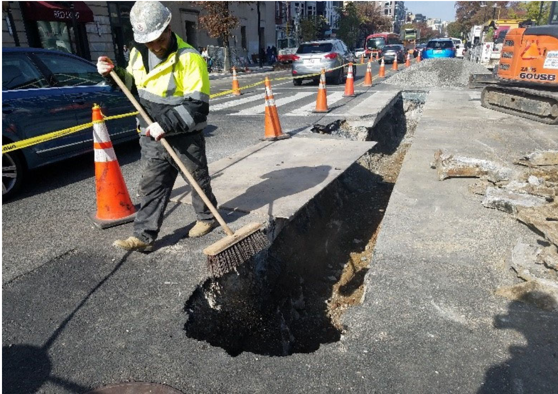
Asphalt placed at 1357 14 th St water main tie-in.