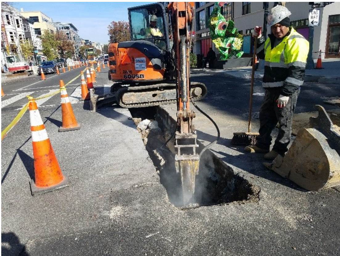
Trench excavation continued by Omni from M49