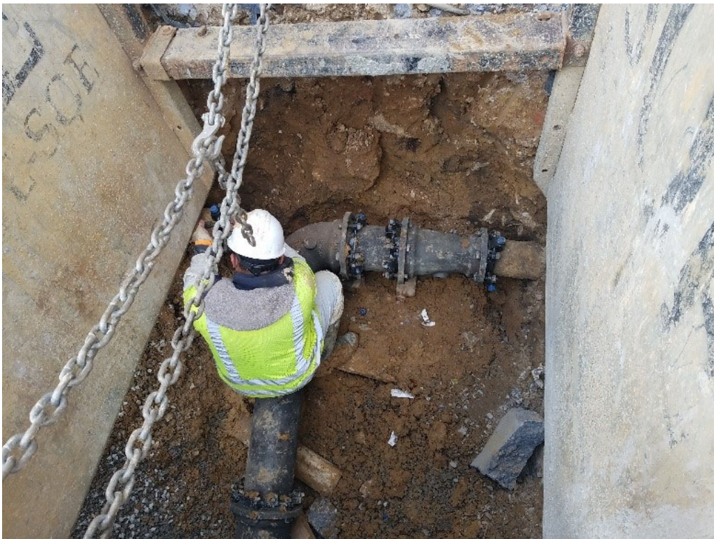
Tie-in completed at 1357 R St