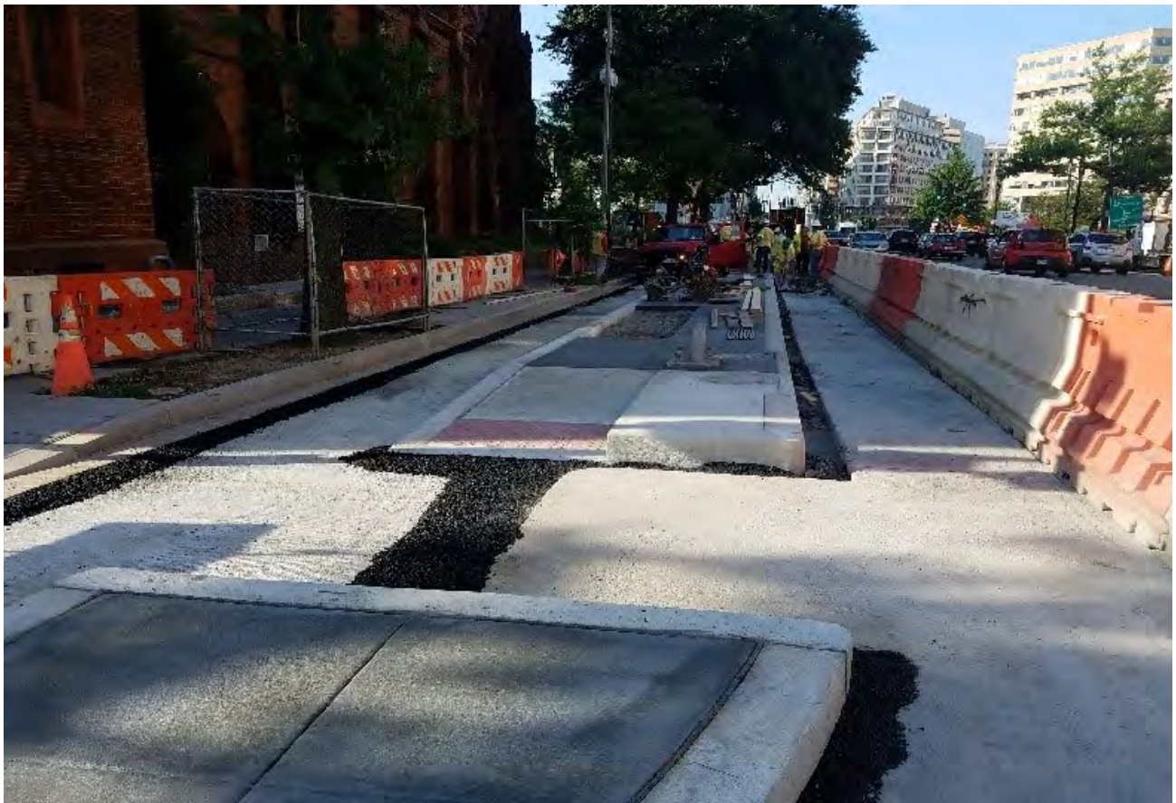
Both sections of directional bus island at NB 14 th & N St.