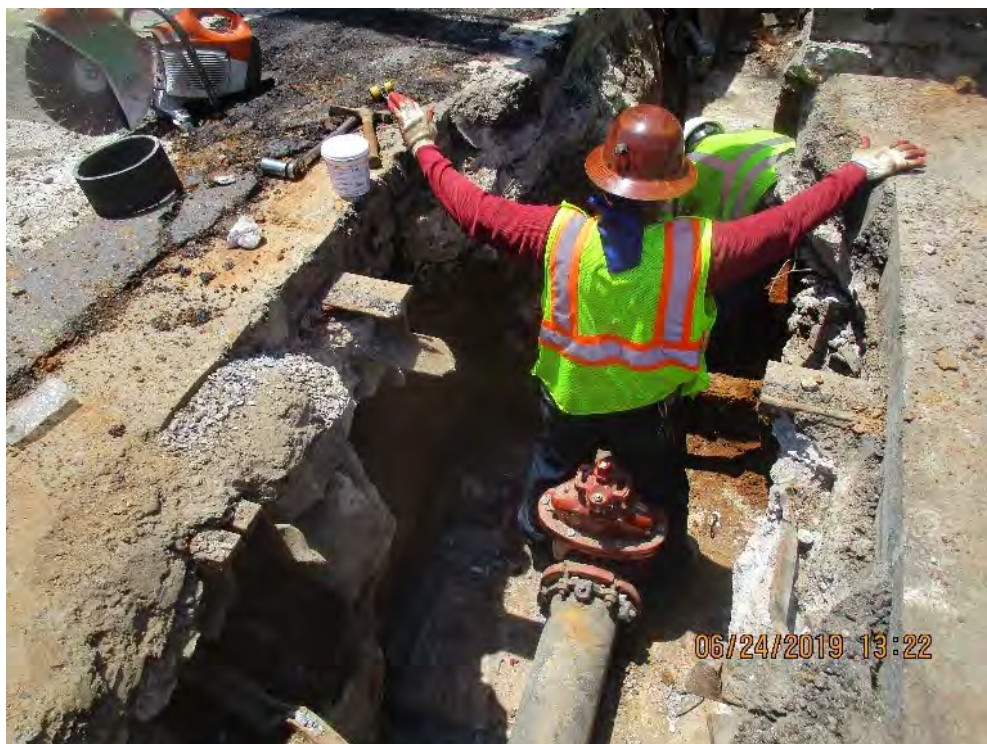
Omni installing the 8-Inch Gate Valve at the intersection of 14 th & R Street NW