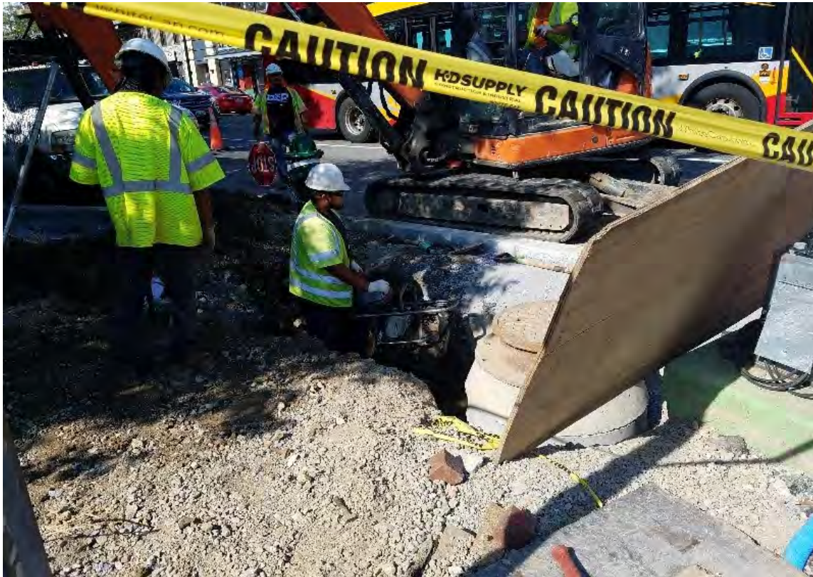
Backfill by Omni excavators for hydrant #H11322.