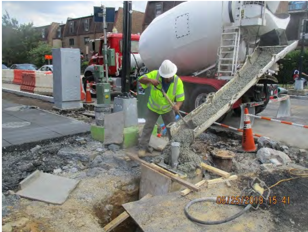
Omni installing the Street Light Pole Foundation TS29 within the area of the proposed Bus Island at 14 th & S Street NW