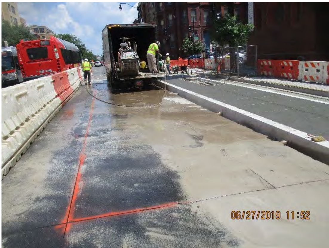
FMCC saw cutting the roadway for the Bus pad installation at 14 th & N Street NW