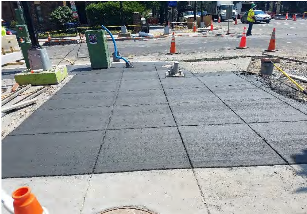
PCC sidewalk placed at NEC of 14 th & S St.

Project Website: www.14thstreetproject.com