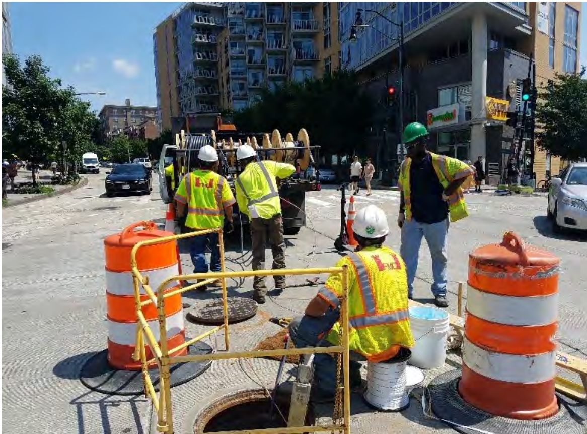
Manhole M85 to M93 cable pull by FMCC