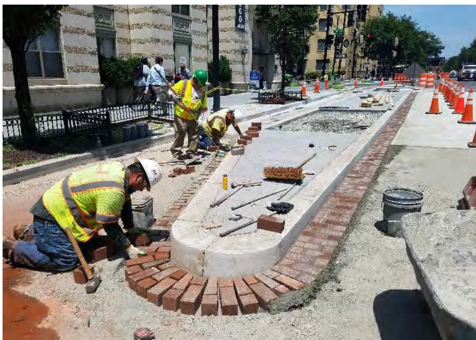
Brick gutter placement continued at south 14 th & N St.