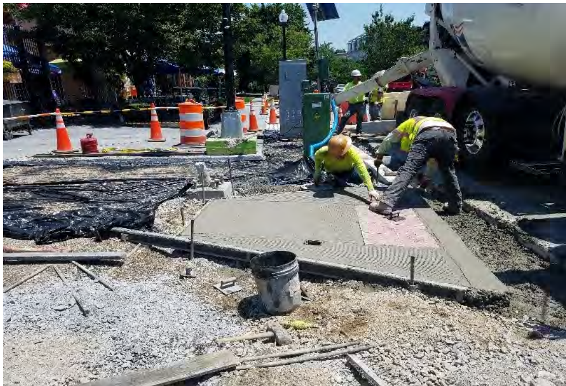
PCC wheelchair ramp placed at NEC of 14 th & S St crossing S St.