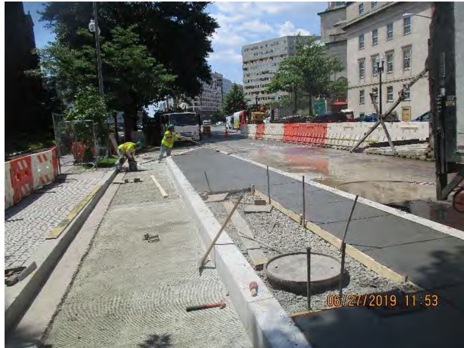
FMCC finishing up the concrete work for the installation of the Bus Pad at the southeast corner of 14 th & N Street NW