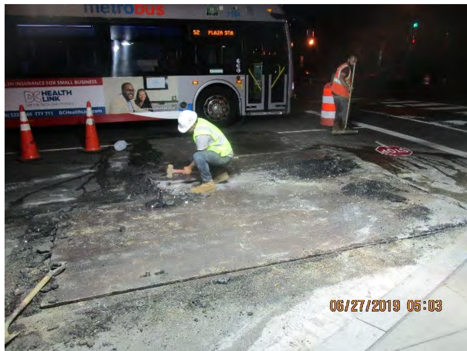
Omni securing the trench excavated for the Fire service water line relocation at the southwest corner of 14 th & S Street NW