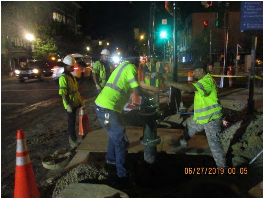
DC Water Inspector shutting off the water main line at the intersection of 14 th & S Street NW