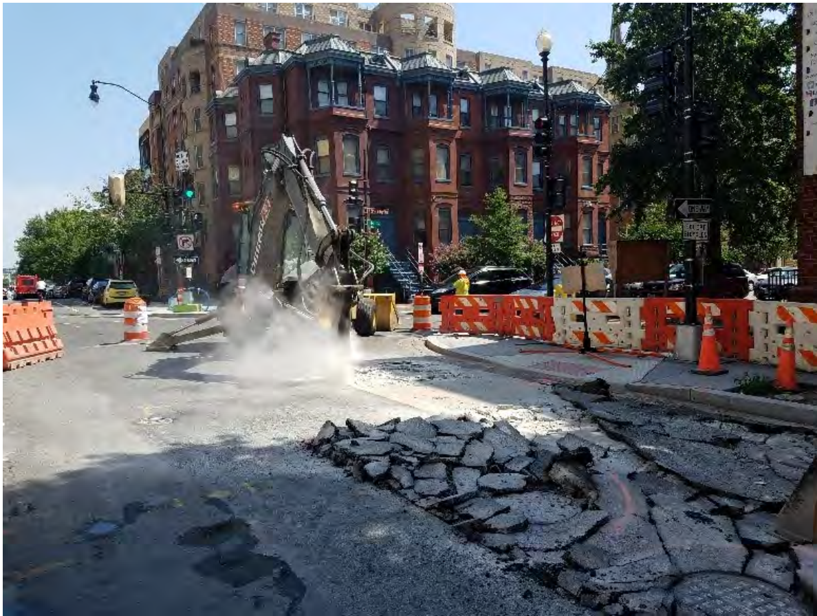
Demolition by FMCC at future bus island at northbound 14 th & N St.