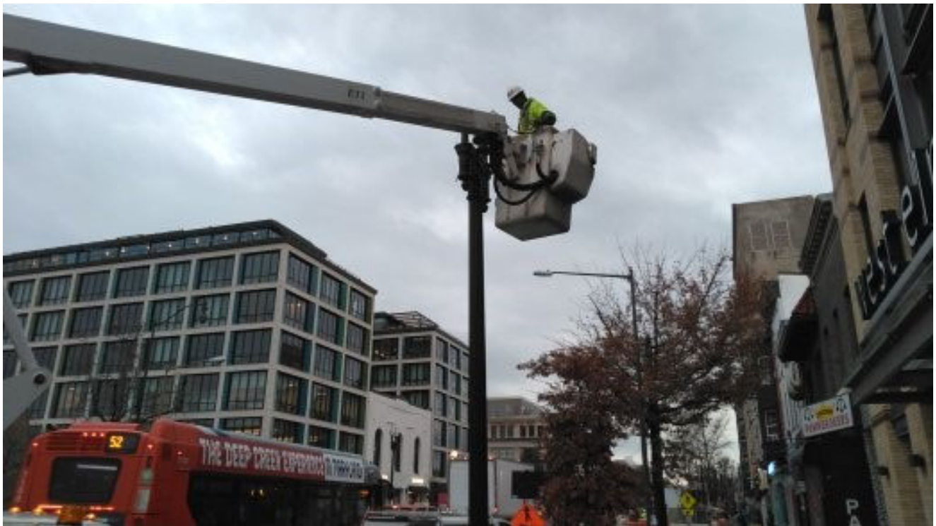
FMCC installing the Post Top Fixtures at light pole L-67