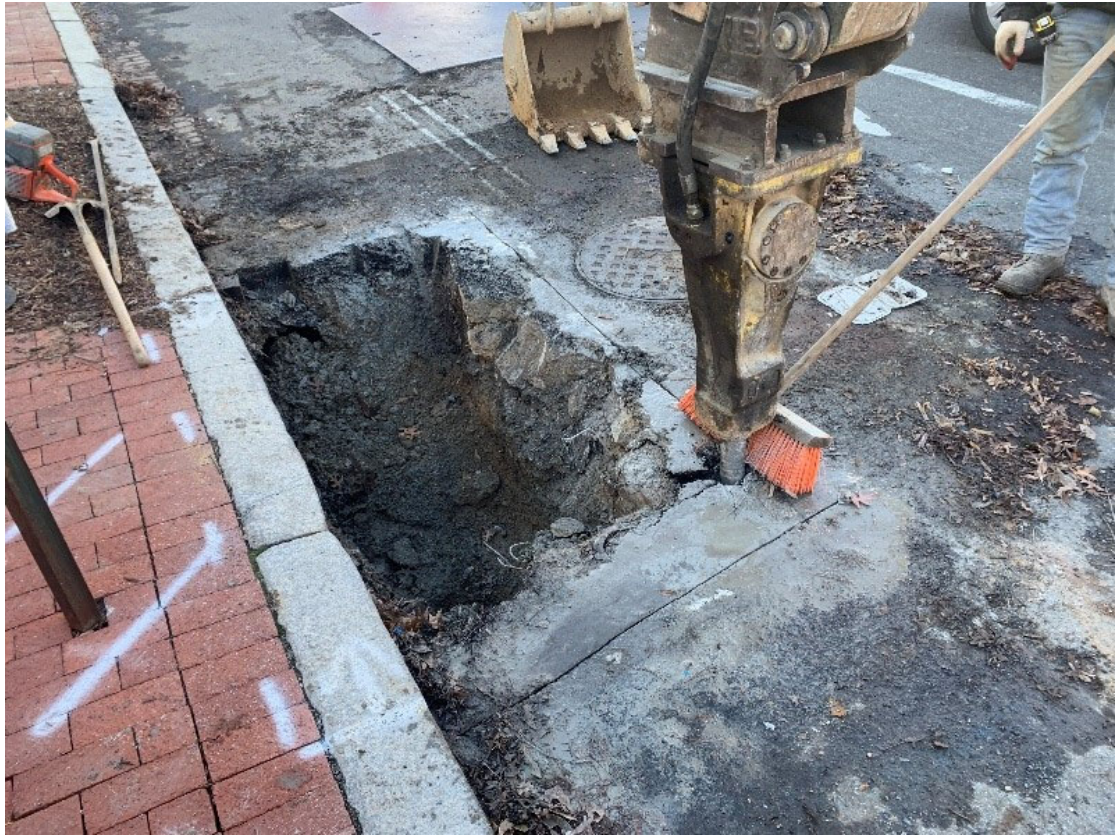
OMNI: Inlet installation at T St NW