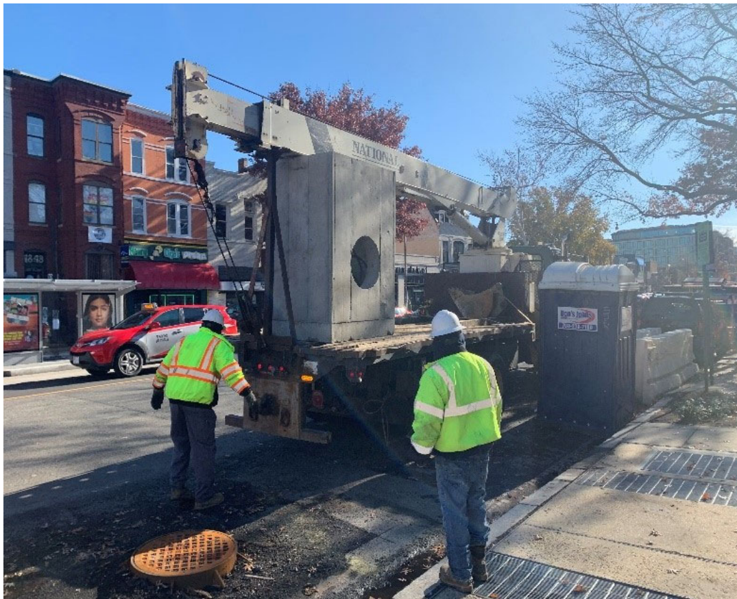
OMNI: inlet Installation at T St NW

Project Website: www.14thstreetproject.com