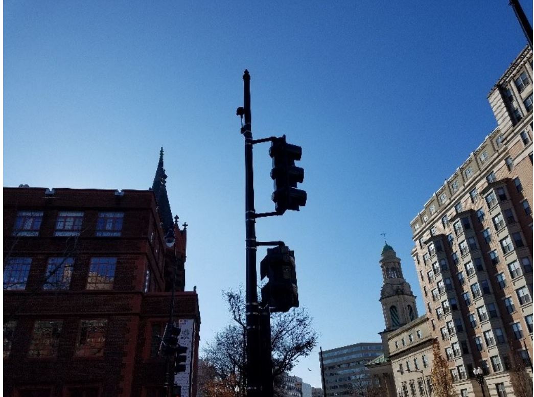
Detection camera installed at NEC at 14 th & N St