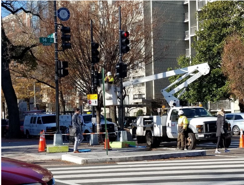
FMCC installing traffic signal TS-09 at SWC of 14 th & RIA following tree branch trimming