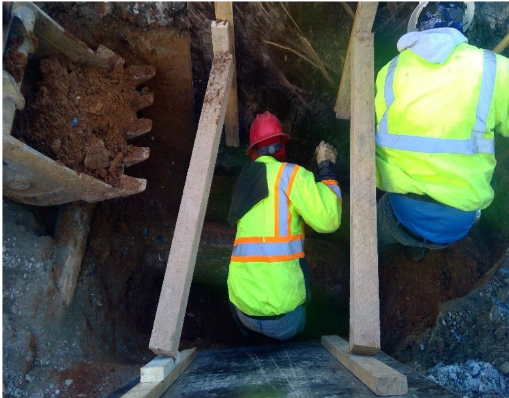
OMNI:manhole construction 14 th St