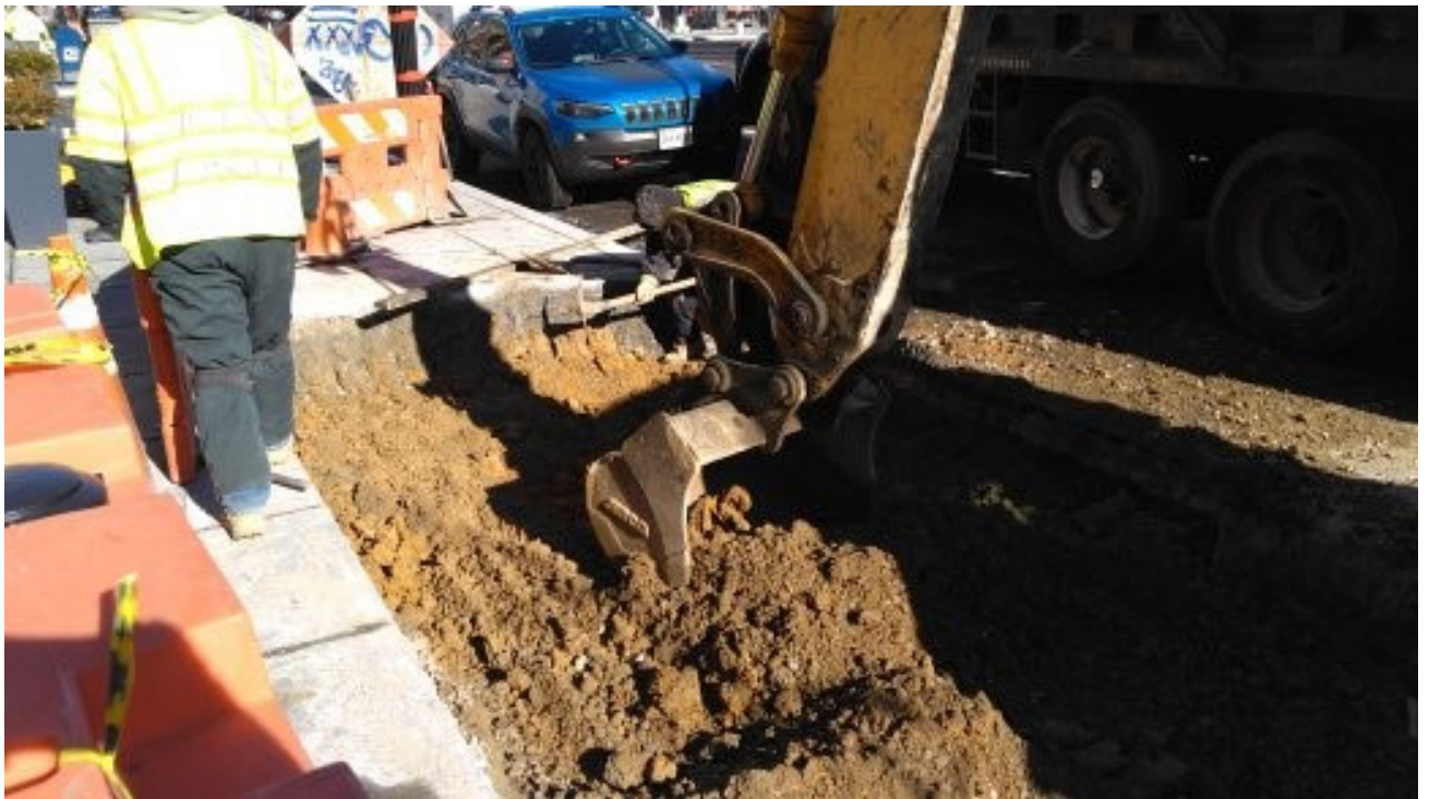
DEN excavating for Bio-Retention Planter No.2