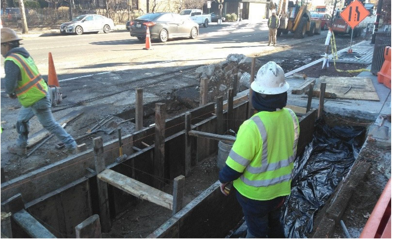
DEN forming Bio-Retention Pond No.2