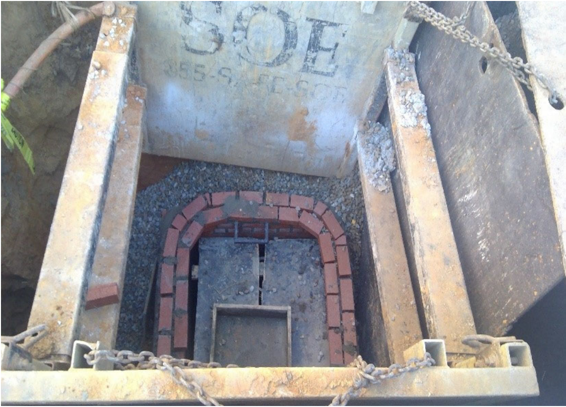
OMNI:manhole construction 14th St