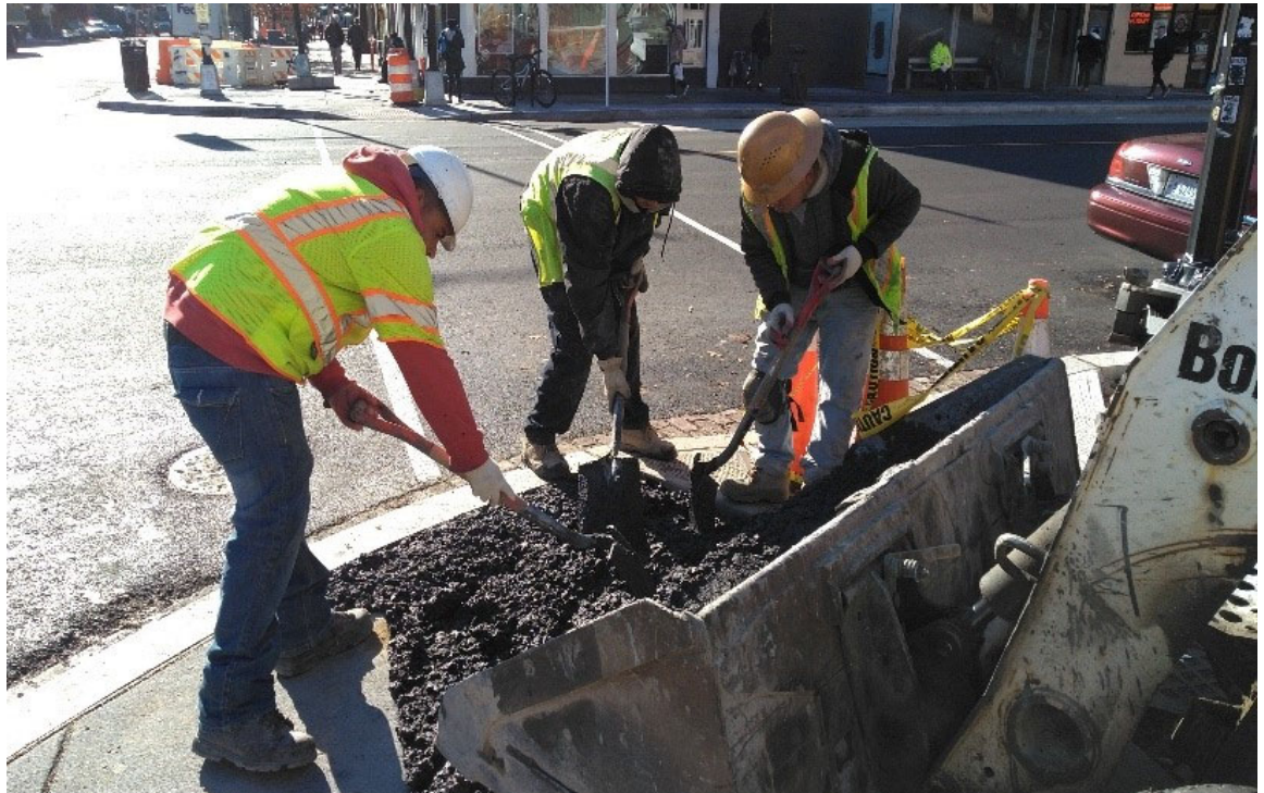
DEN pouring the sidewalk at the NW corner of U Street and 2000 14 th Street NW