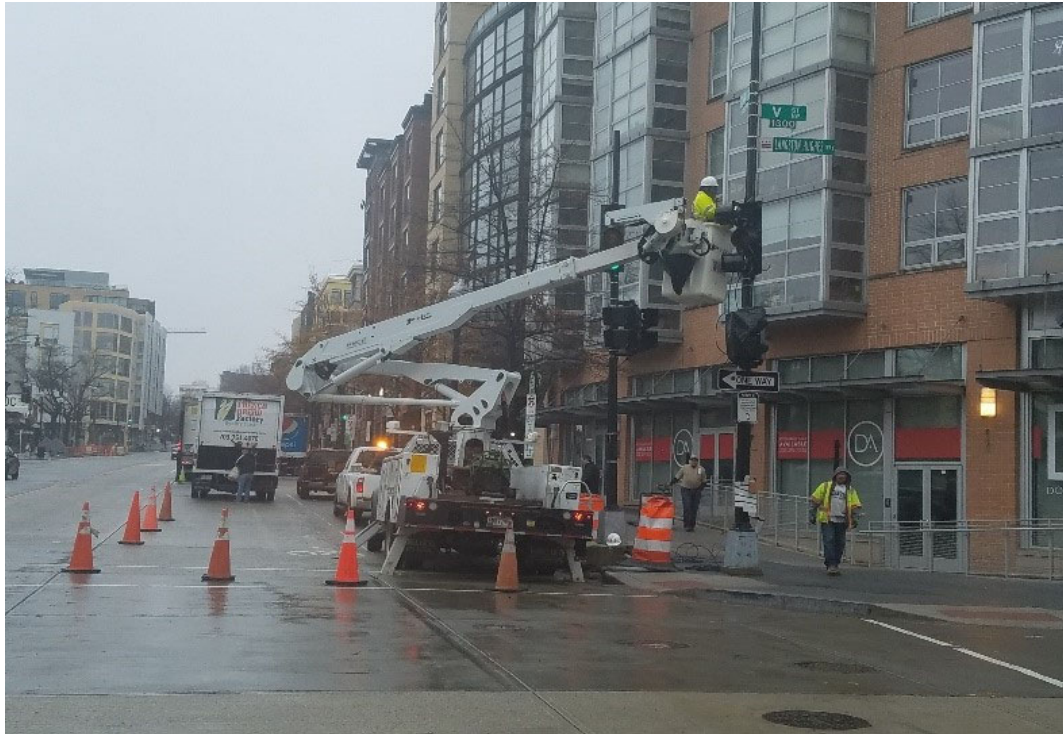
Cable being connected to LED module at NEC of 14 th & V St.