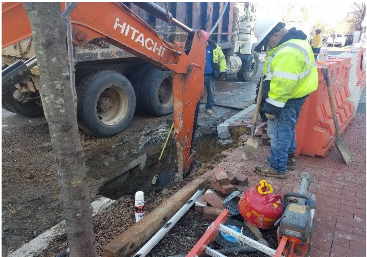
Omni excavating for installation of catch basin CB-25