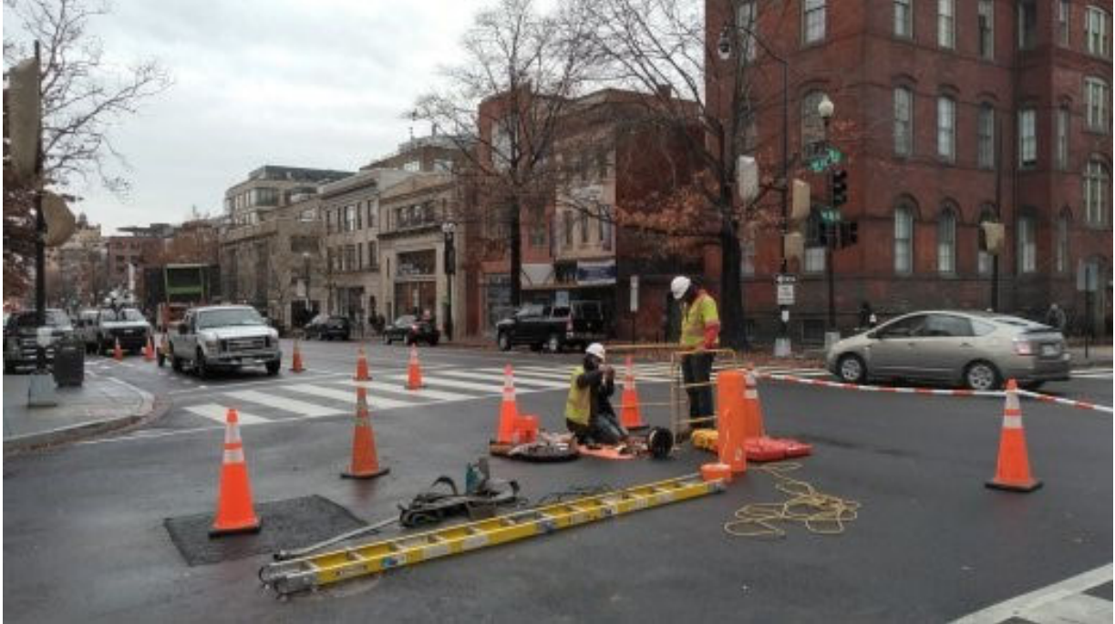
FMCC splicing the 4/0 cable in manhole M40 at 14 th Street NW and Q Street