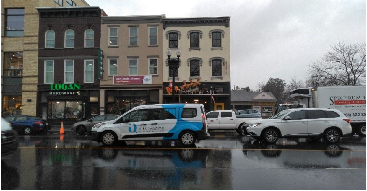
The 100 Watt Post Top Fixtures were installed today at southbound 1738 14 th Street NW