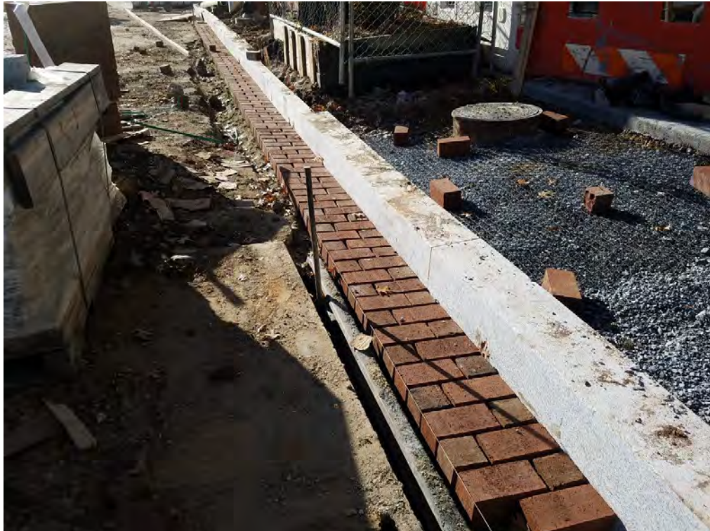
Brick Gutter installation between N Street and Rhode Island Ave