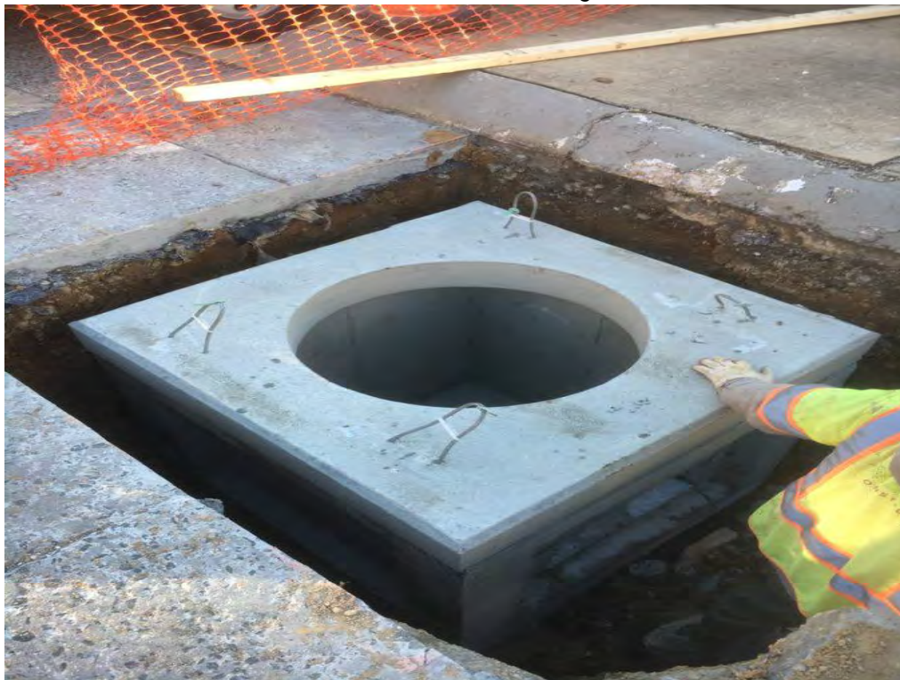
Installation Manhole at the corner of 14 th and W Street