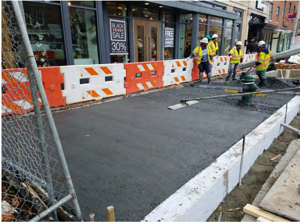
Placing PCC Sidewalk between N Street and Rhode Island Ave