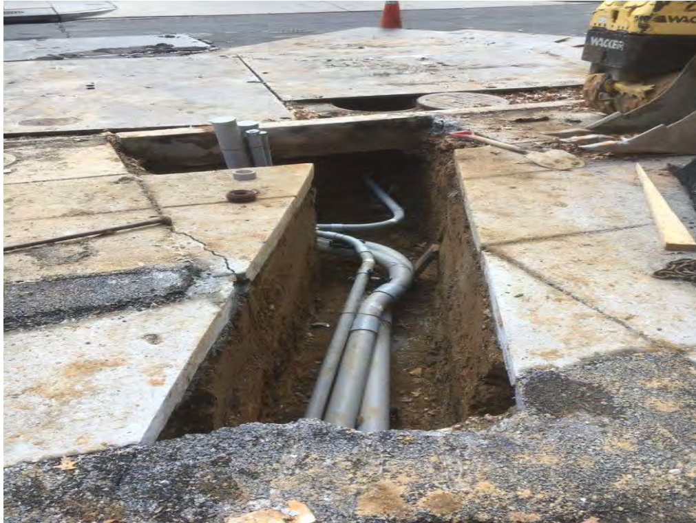
Installation of PVC Conduit for Traffic Signal Foundation