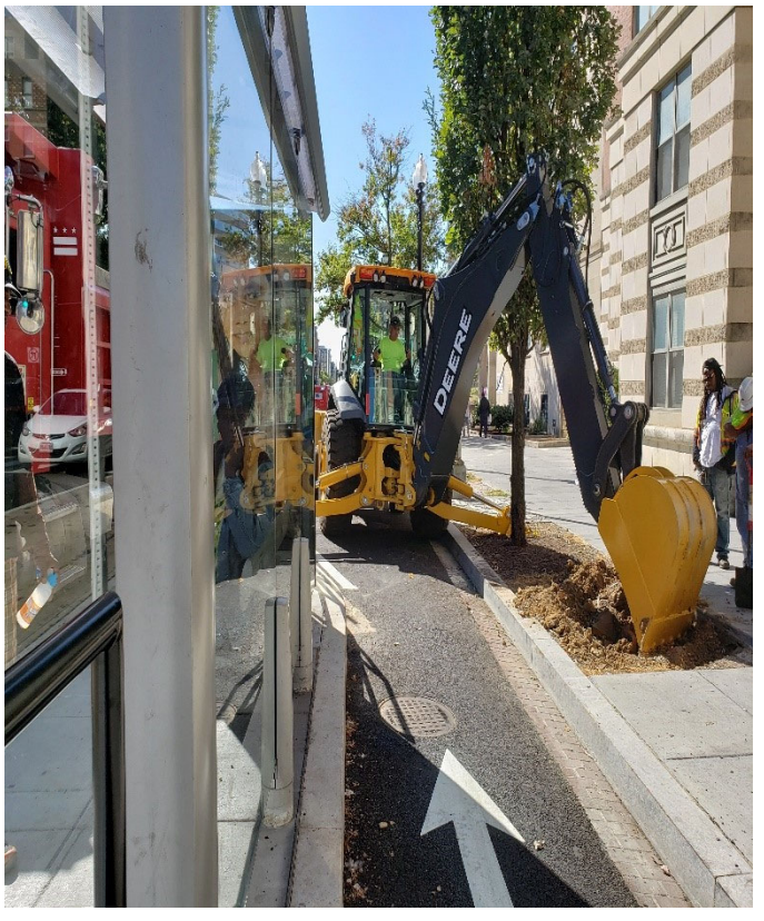
FMCC crew excavated for Planters near Bus Island Shelter at 1200 Block of 14th St. NW & N St. Intersection at SB.