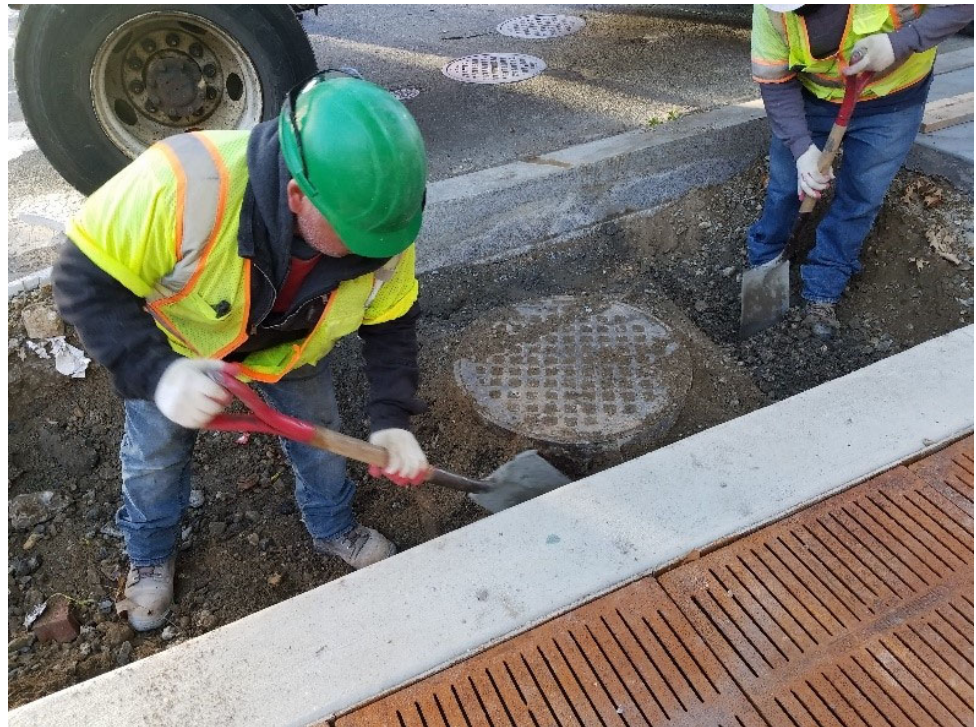
Second Pepco manhole to be adjusted by FMCC