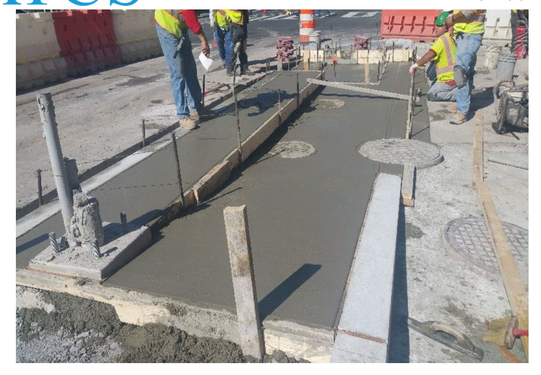
Utility manholes adjusted at SEC of 14th & T St