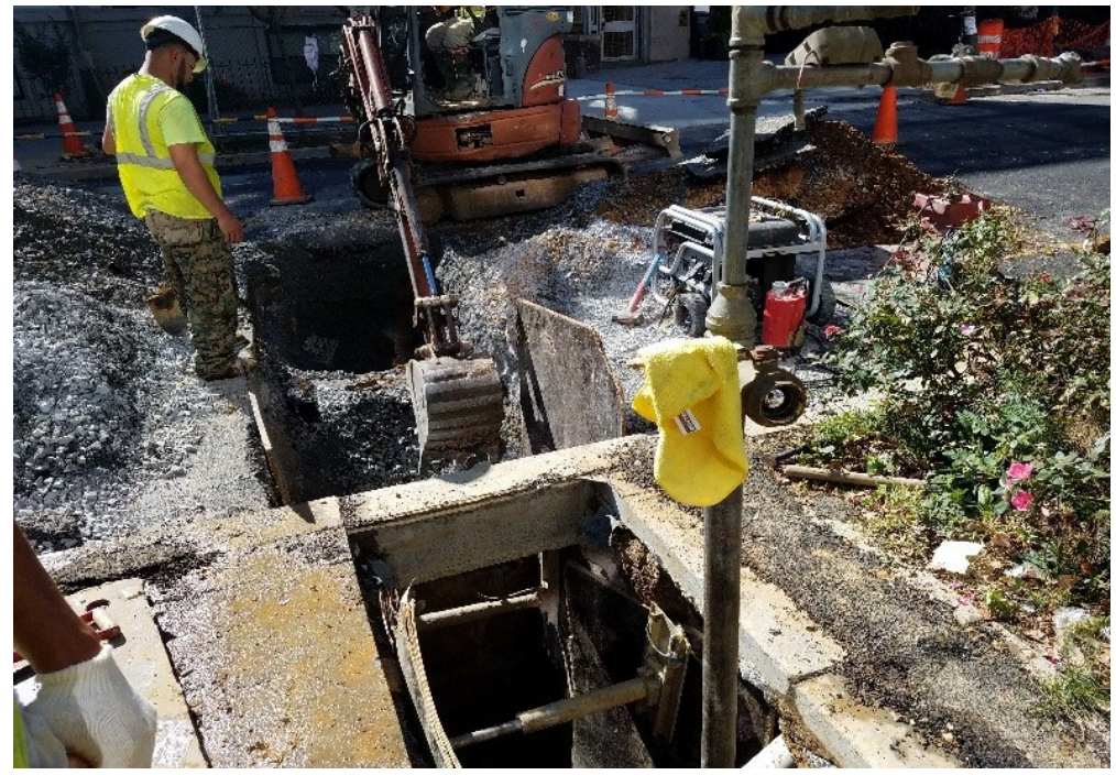
Trench opened at new 8" D.I.P. for leak found