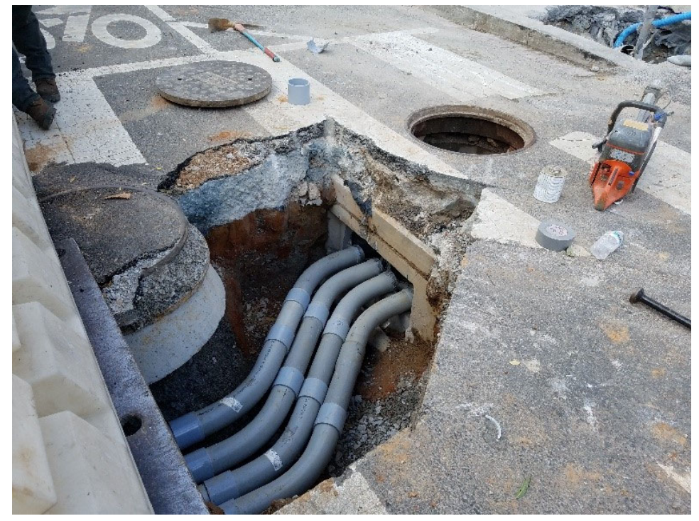
EM05 to M44 at SWC of 14th & R St