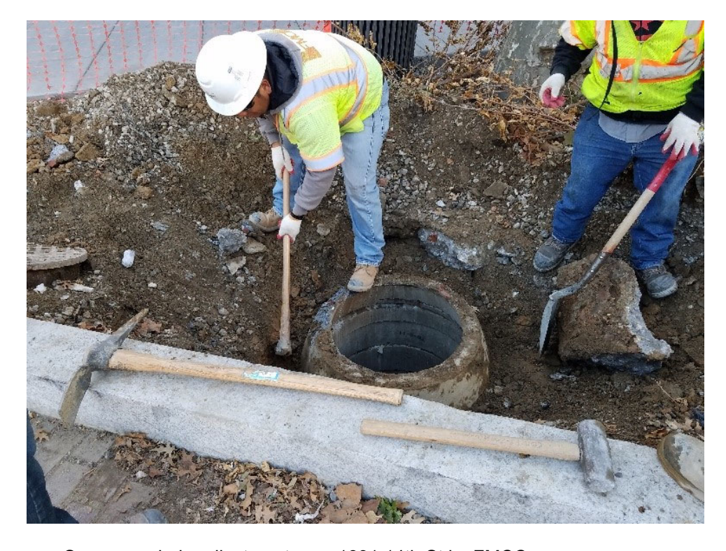
Sewer manhole adjustment near 1831 14th St by FMCC