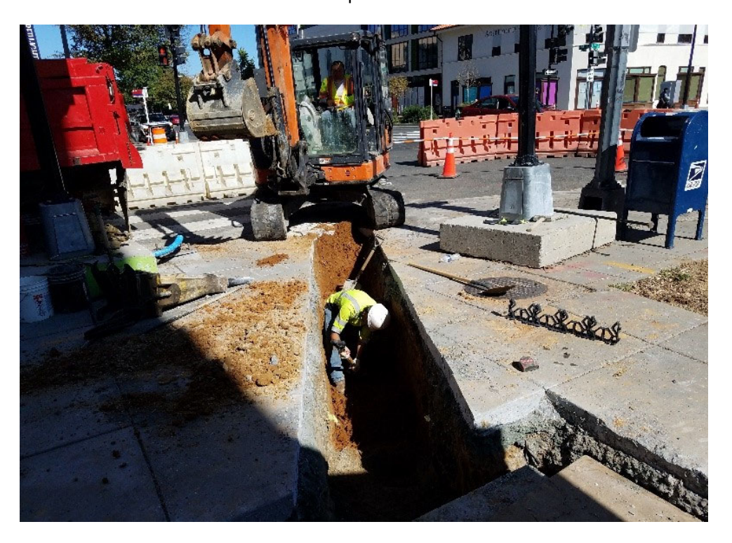
Trench excavation by Omni from M44 to EM05 at SWC of 14th & R St.