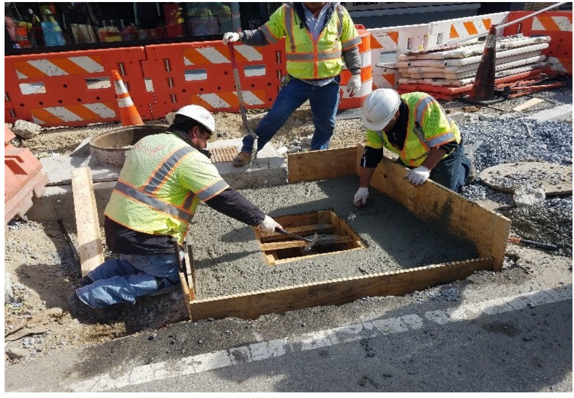
Concrete placed atop PEPCO manhole by FMCC