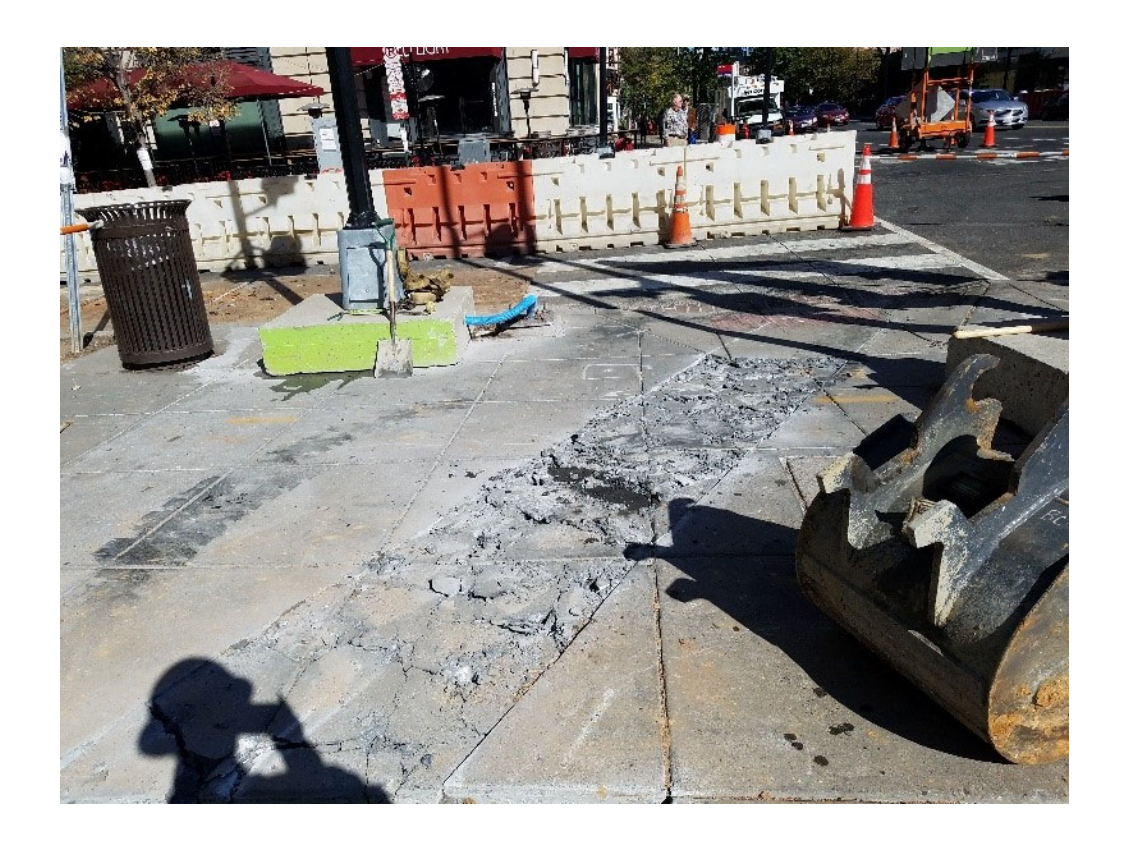
Trench to be excavated by Omni from M44 to EM05.