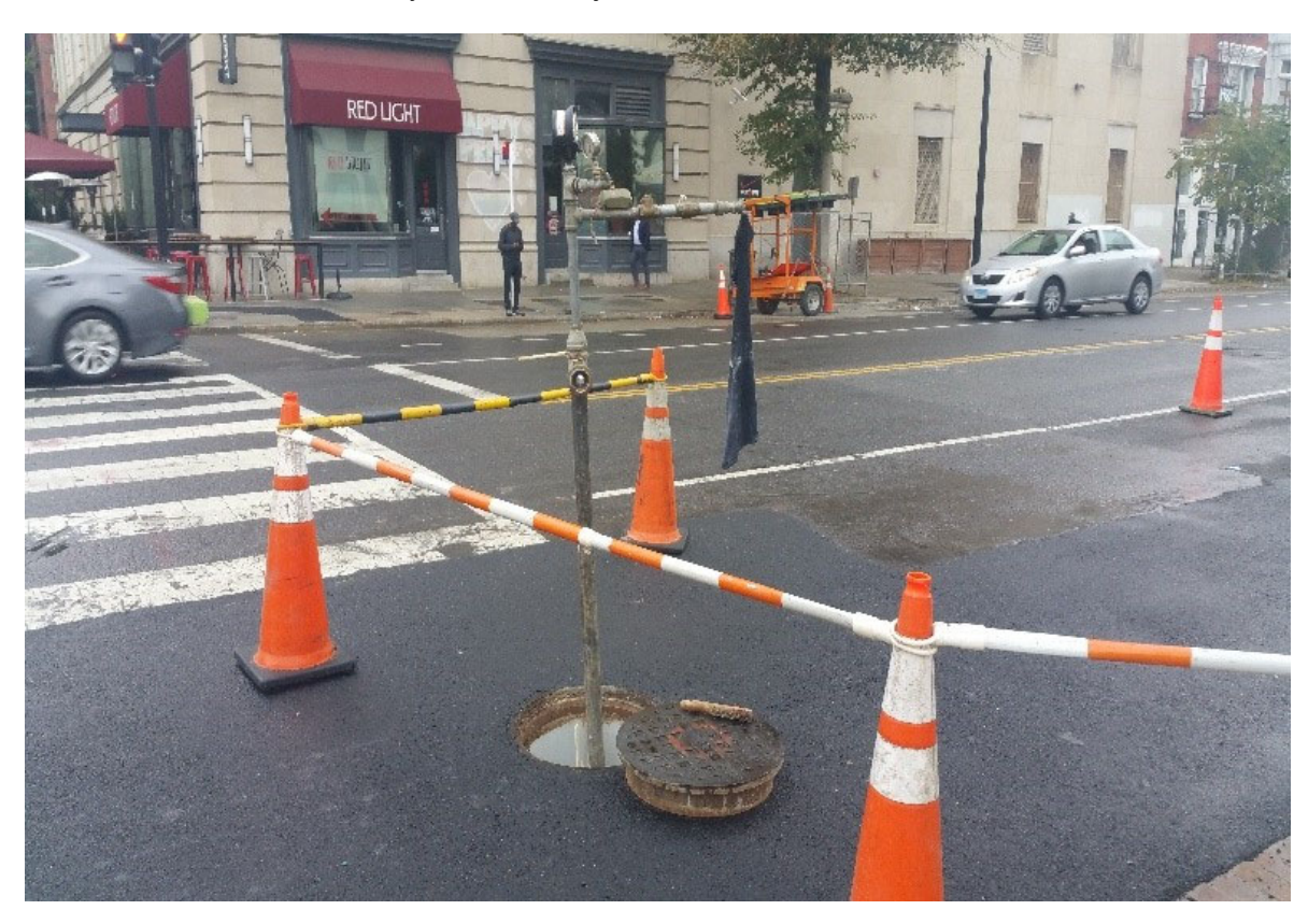
Blow-off valve at northbound 14th & R St