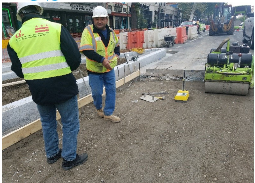
Density test of aggregate base course by DDOT operation.