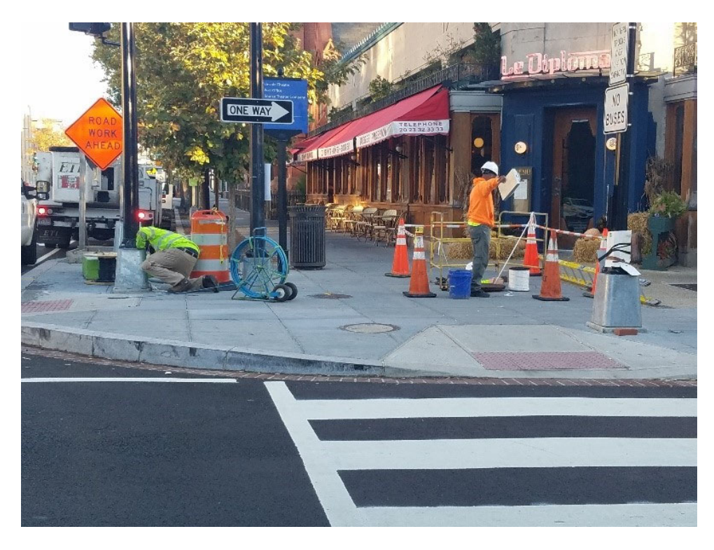
M34 to L46 at NEC of 14th & Q St