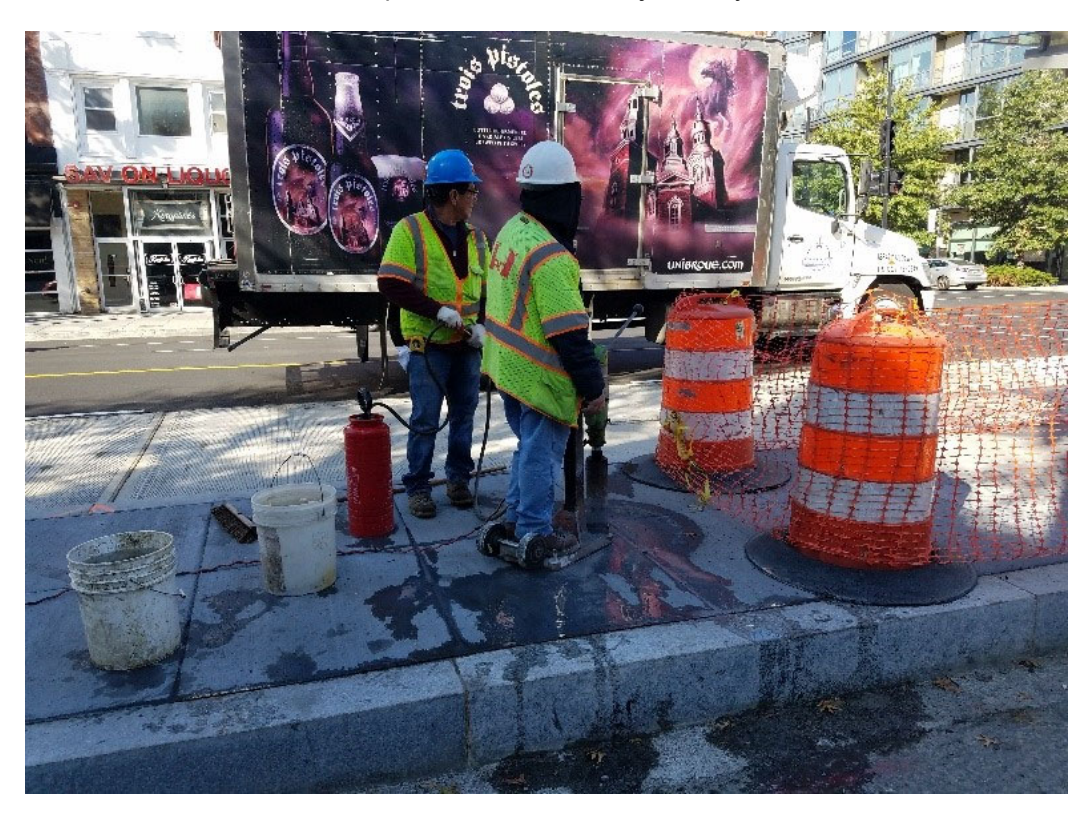
Location near SEC of 14th & T St where bus pad was removed for new directional bus island.