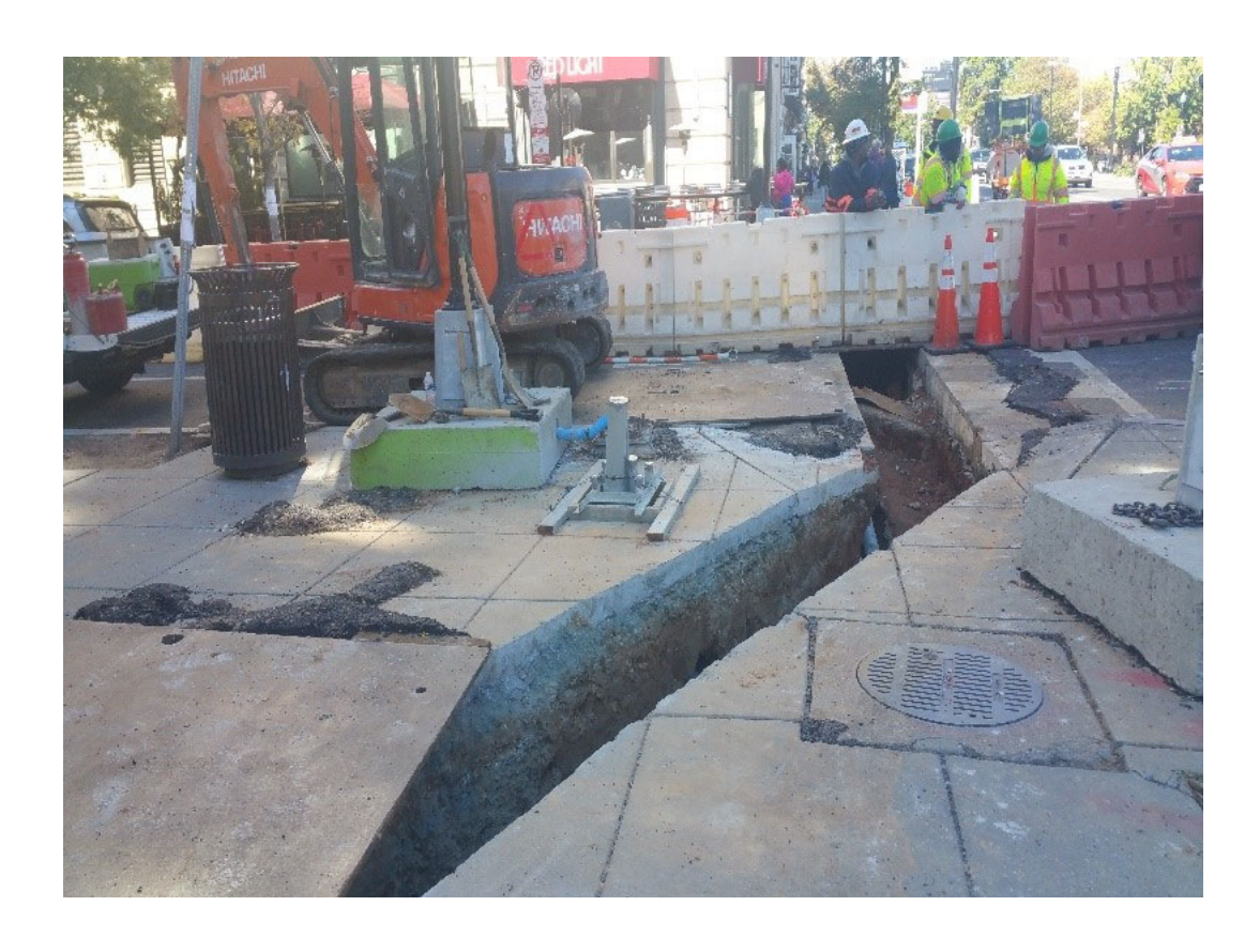
Steel plating at SWC of 14th & R St removed for concrete placement