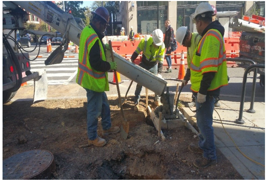
Class B concrete placed at L57 at SWC of 14th & R St