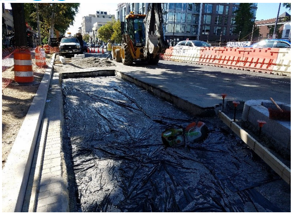
Location near SEC of 14th & T St where bus pad was removed for new directional bus island.