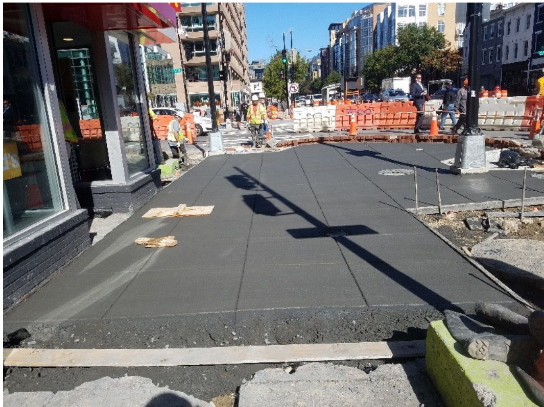
PCC sidewalk finished at SWC of 14 th & U St