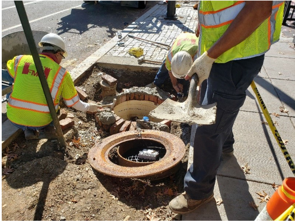
FMCC Landscaping Excavation crew adjusted 2 Utility MH on Wed. 10-23-2019