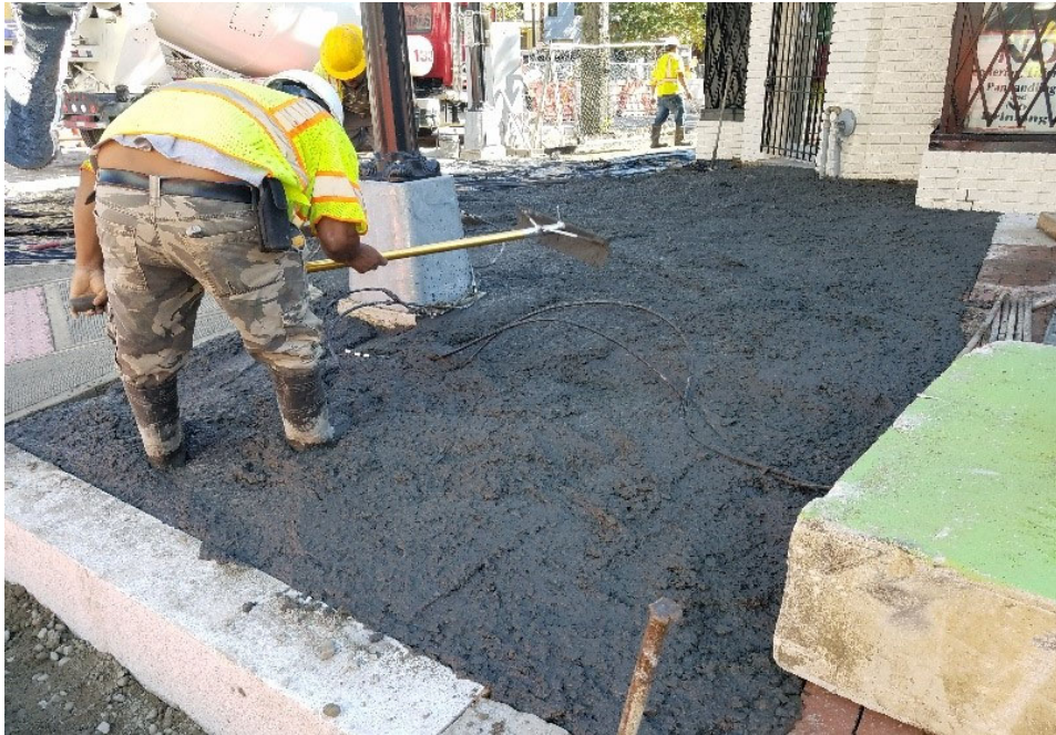
PCC sidewalk placed at 2222 14 th St NW by D.E.N.