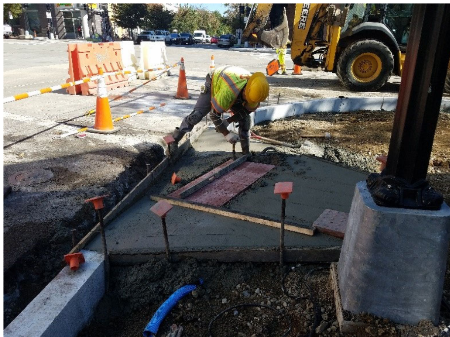
1 st wheelchair ramp placed at SWC of 14 th & Florida Ave