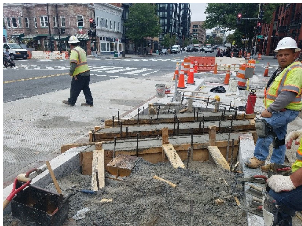
Formwork and concrete placed at SEC of 14 th & T St