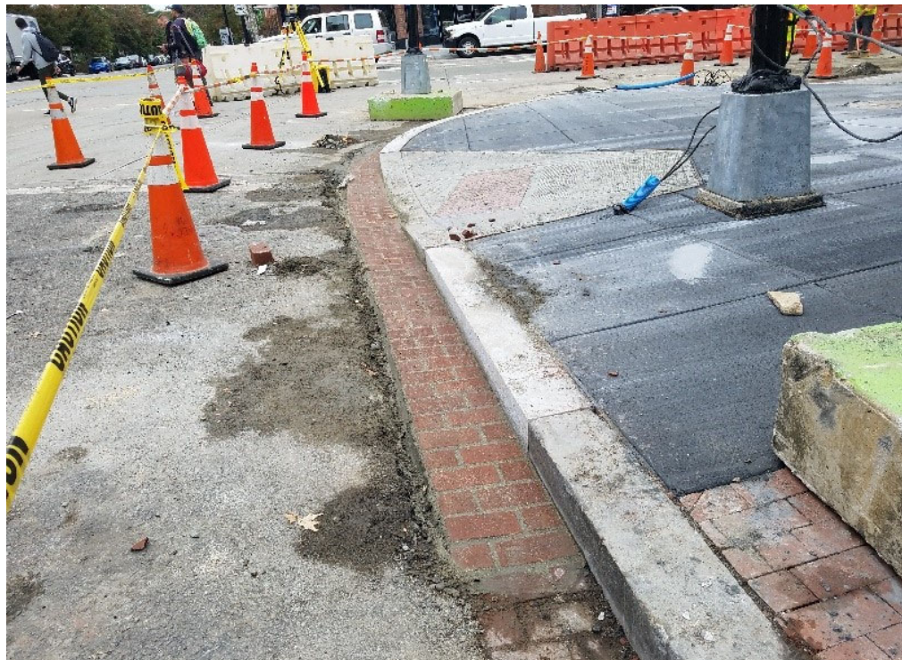
Brick gutter placed at SWC of 14 th & Florida Ave