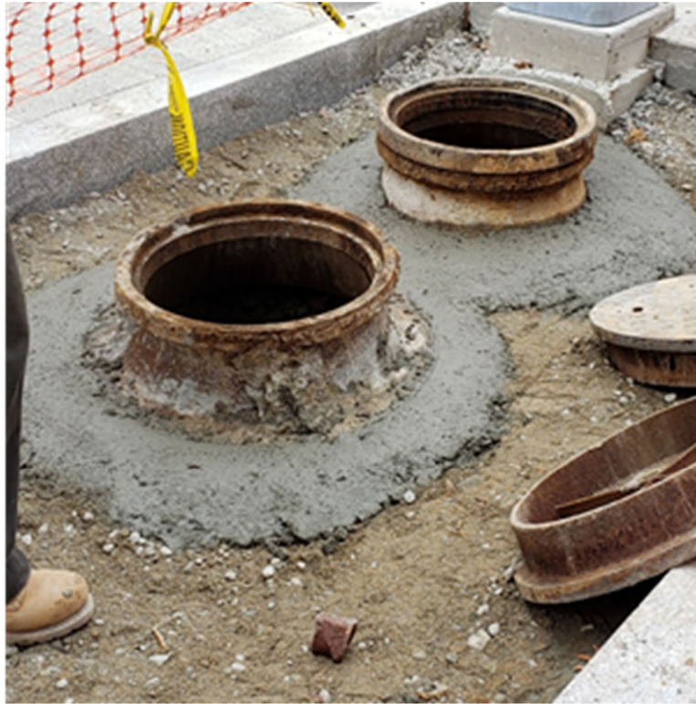
FMCC Concrete crew raised 2 Utility Manholes at Bus Island on R St & 14 th St. NB at Intersection