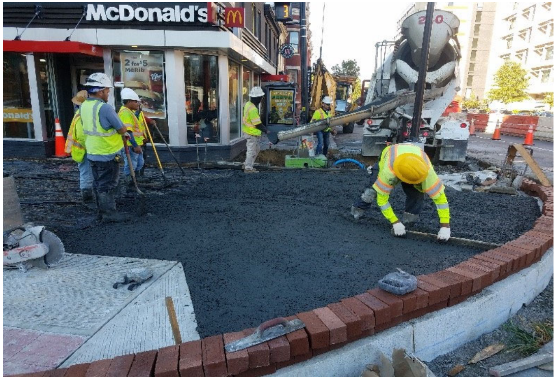
PCC sidewalk placement at SWC of 14 th & U St