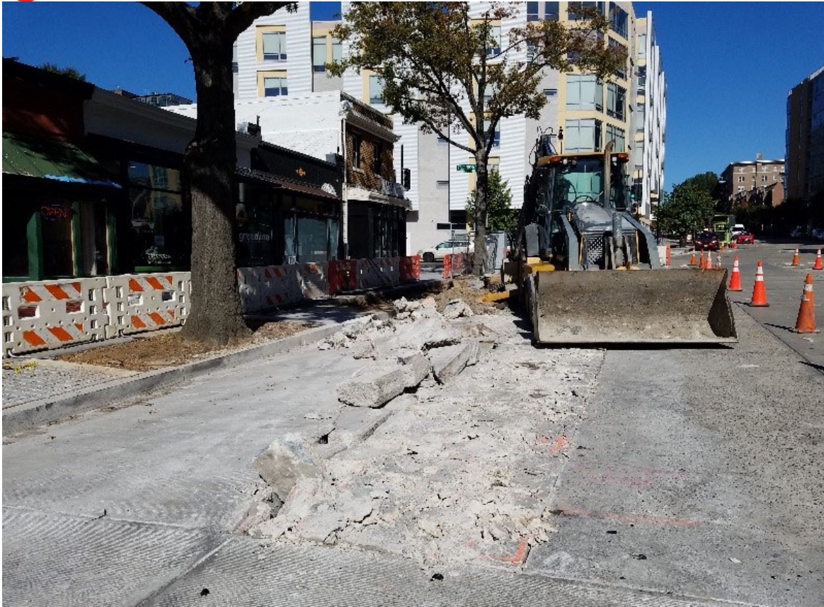
Demolition of existing of pavement for bus island