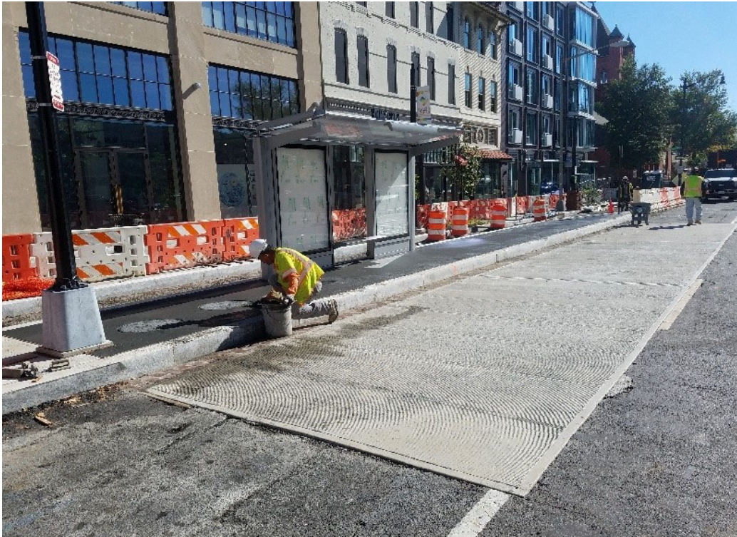
PCC sidewalk placed at bus island near 1631 14 th St