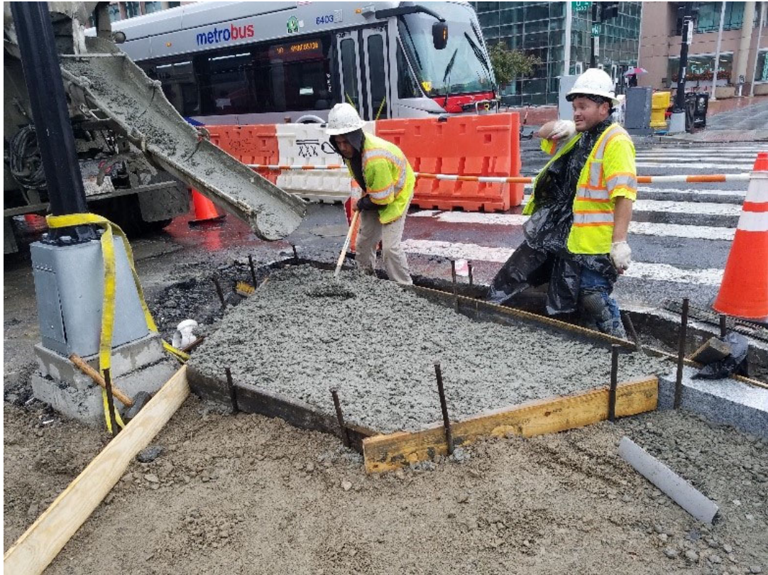
2 nd wheelchair ramp placed at SWC of 14 th & U St