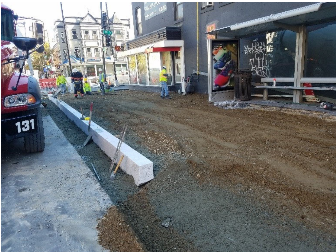
Placement of straight granite curb at 1404 14 th St