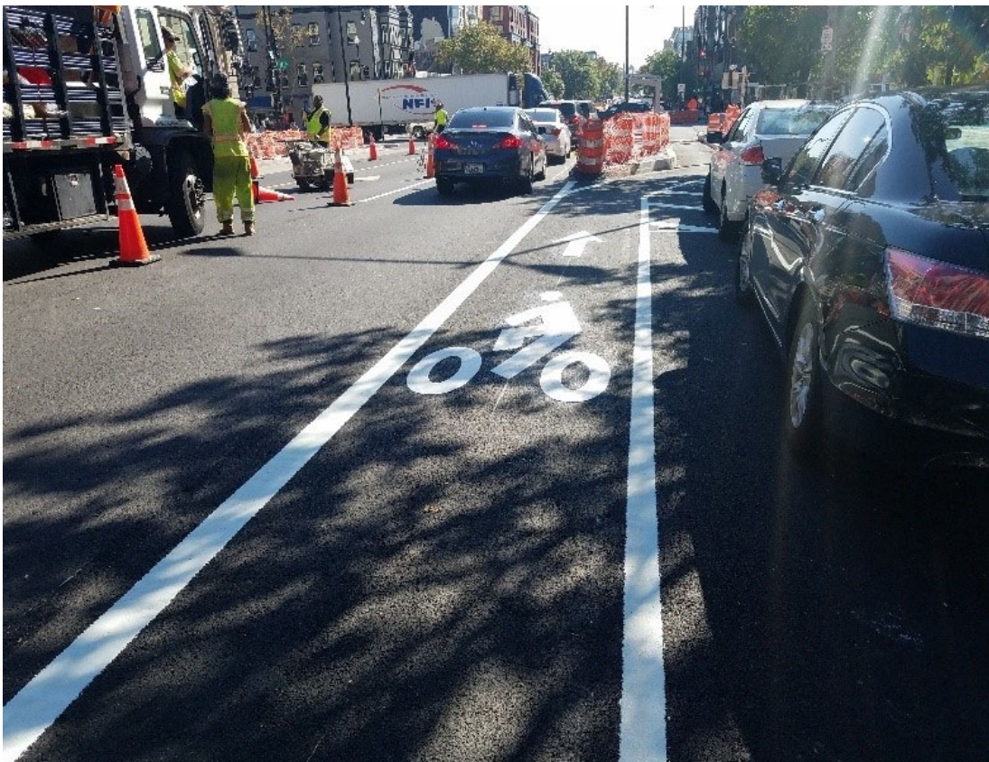
Bike lane and arrow symbol placed at 2000 block southbound

Project Website: www.14thstreetproject.com