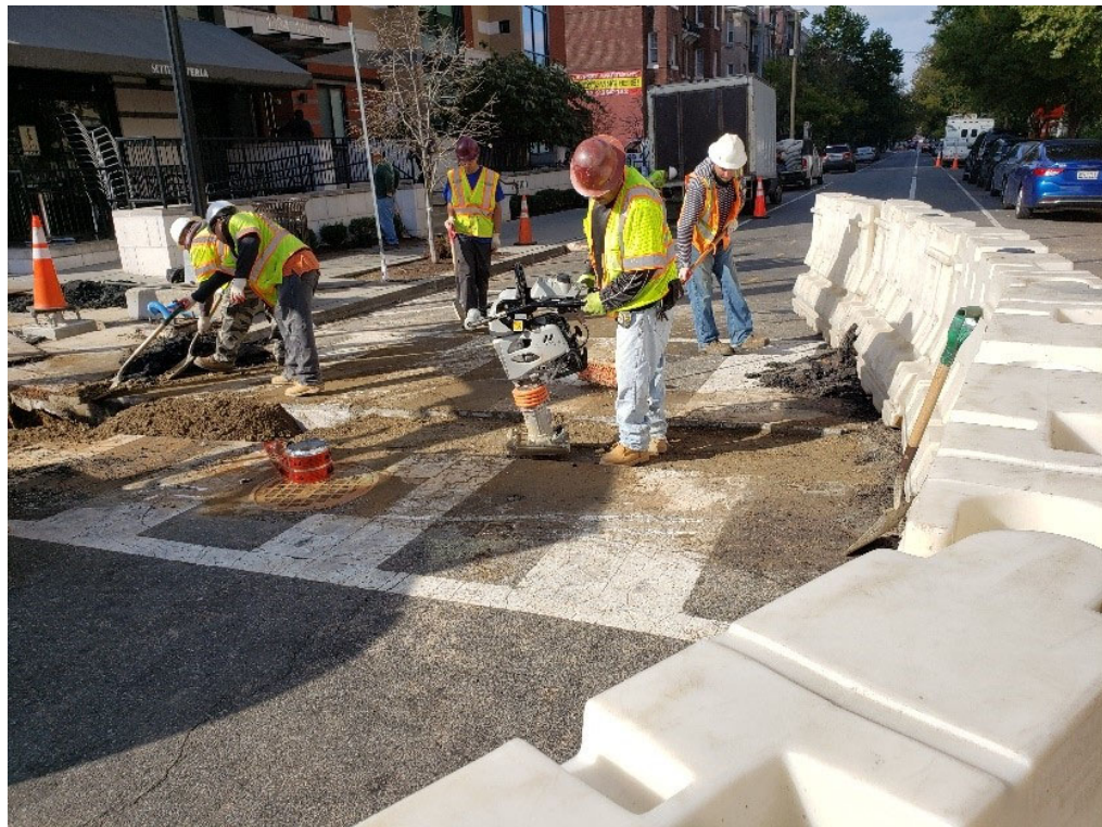
OMNI, Inc. crew backfilled a Conduit Trench (Duct-Bank) Trench at Crosswalk on R St. & 14 th St. NW Intersection between NWC and SWC of Intersection on Monday, 10-21-2019.