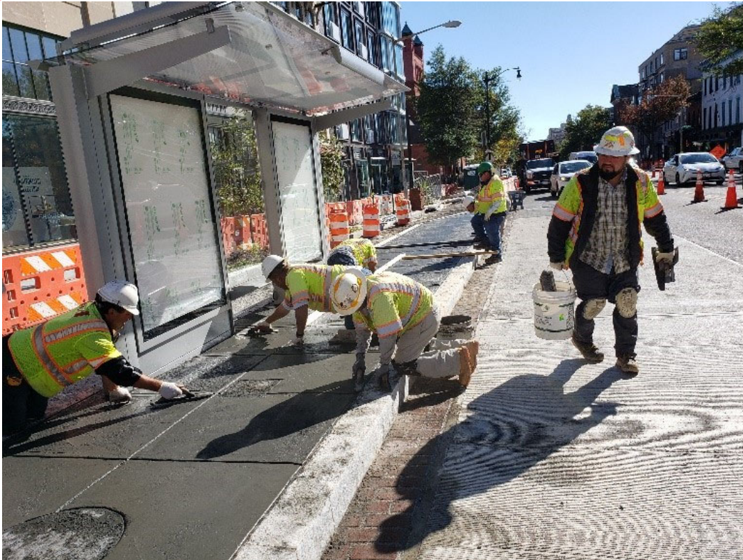
FMCC Concrete continued work on Bus Island Directional at 14 th St. & R St. NW