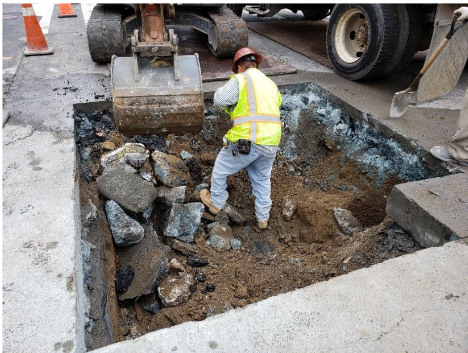
OMNI, Inc. crew continued excavation for proposed MH 49 (3x3x3 Ft) at Center-Line Intersection to avoid any Existing Utilities and Obstruction by Verizon, PEPCO Duct Banks; and Water Main Pipes.