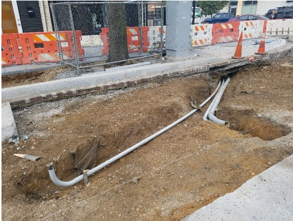
PVC conduit placed by Omni at bus island prior to granite curb installation at SWC of 14 th & Fla. Ave