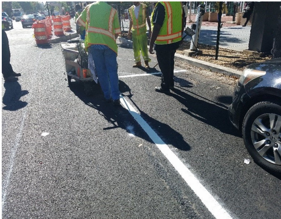
4" thermoplastic line striping by DC Line at parking lane