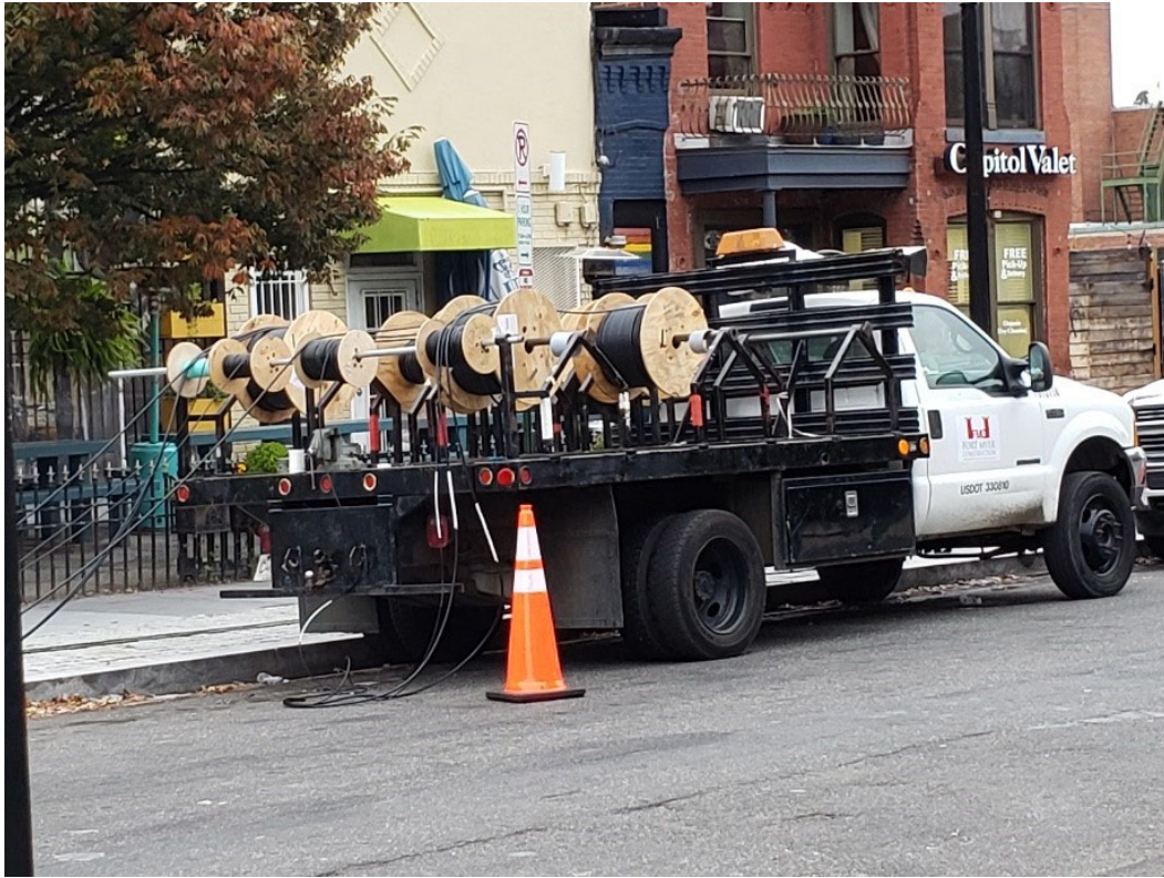
FMCC PEPCO Division worked on connections and Pulling Wires at S St., NW & 14 th St. NW Intersection on SAT 10-26-2019.