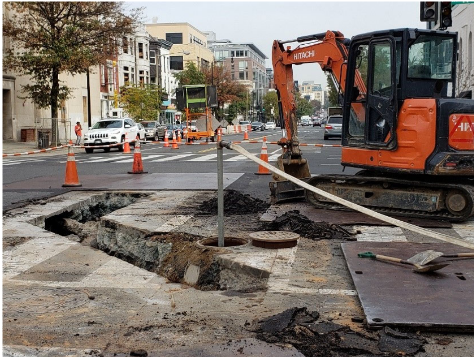
Omni, Inc. crew with DC Water Inspector also run water quality Test and New Main Flushing operation at DC Water Manhole next to their SL-DS Conduits-Trench on Friday, 10-25-2019.