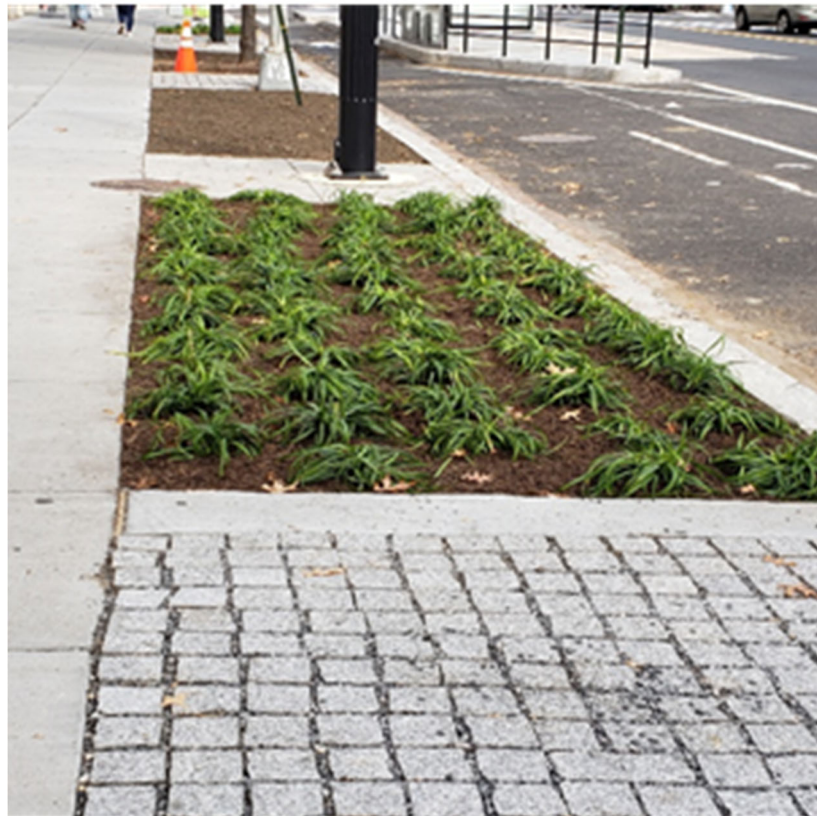
Cooper Landscaping Crew planted ½ Gallon Plants Between N St. & Thomas Cir.