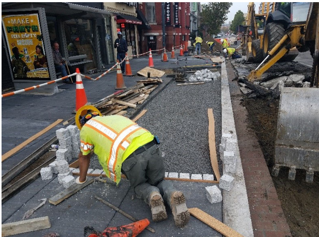
Permeable paver sidewalk placement underway