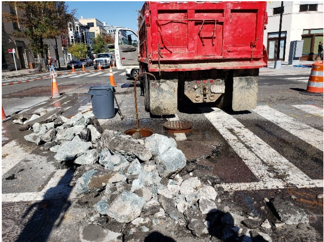
Omni, Inc. crew excavated a 3'-Wide by 4' Deep and 22 Ft Long Trench to accommodate the Conduit Utility Trench for 6 four Inch (4") PVC Electric Traffic Signal Lights connection into proposed MH49 (3'x3'x3');