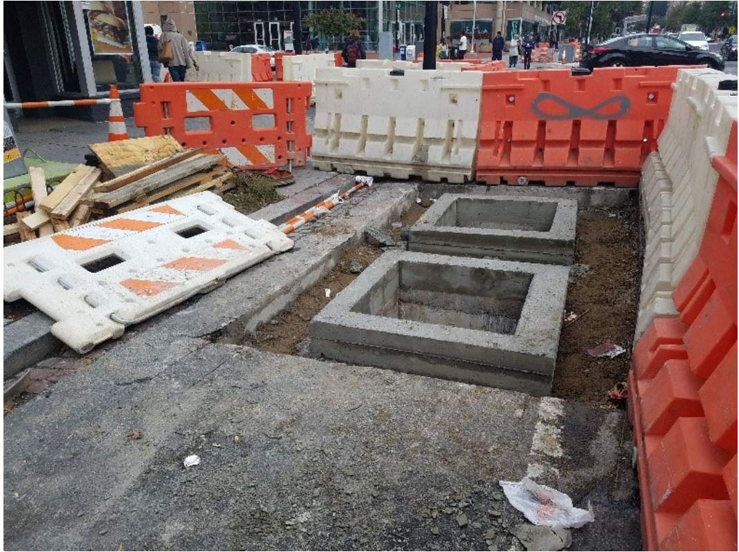
Pepco manholes at SWC of 14 th & U St completed on 10/19