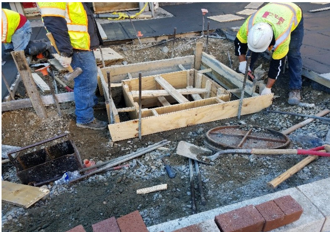
Vertical adjustment of Pepco manhole at 1404 U St