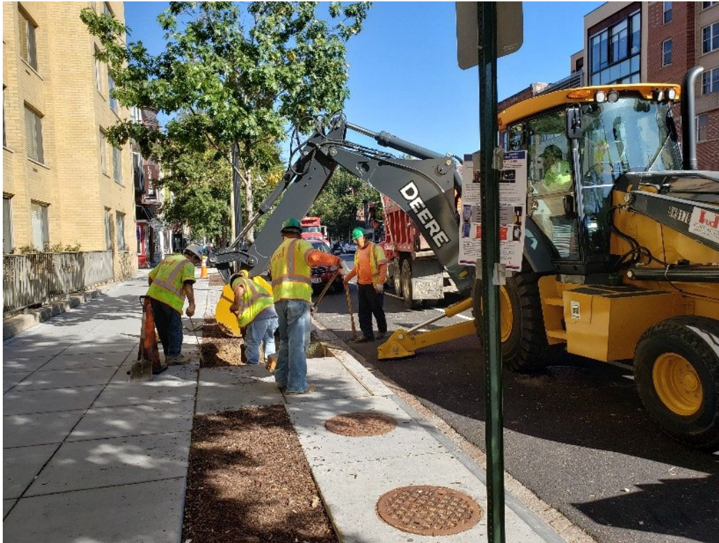
FMCC Crew continued common Excavation for Planters at South-Bound Direction Near 14 th St. & N St. Intersection