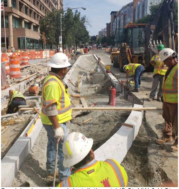
Bus Island granite curb installation at 14th St. NW & U St.