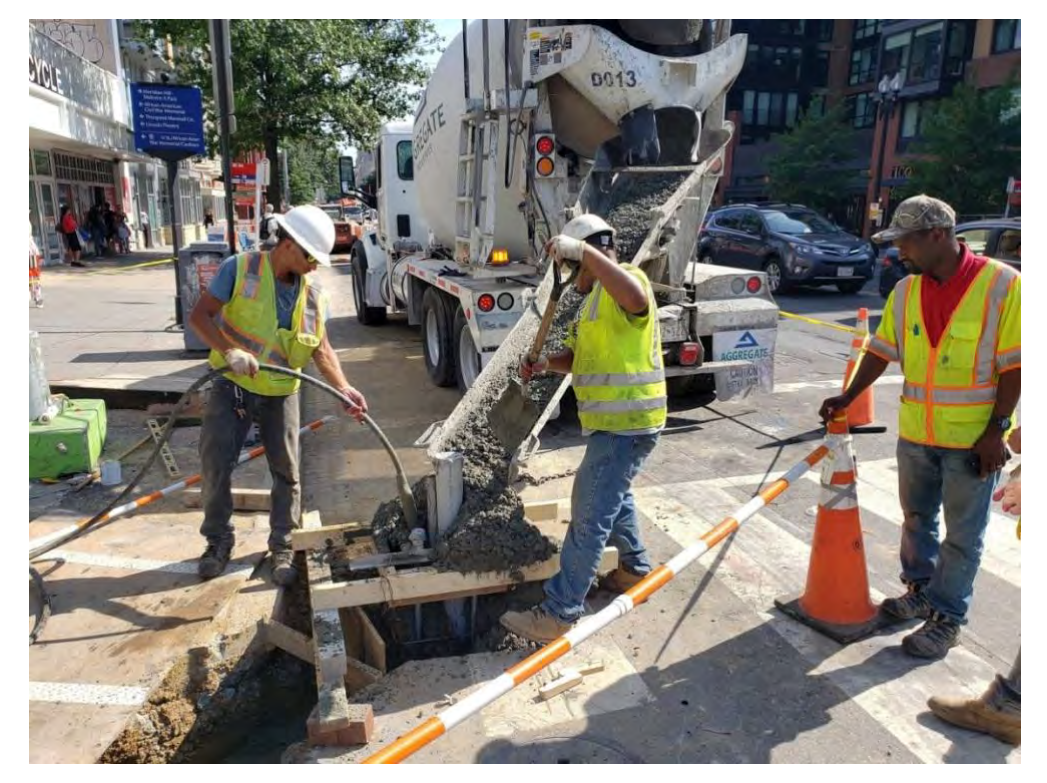
OMNI Pouring traffic pole foundation at 14th St. NW & U St.