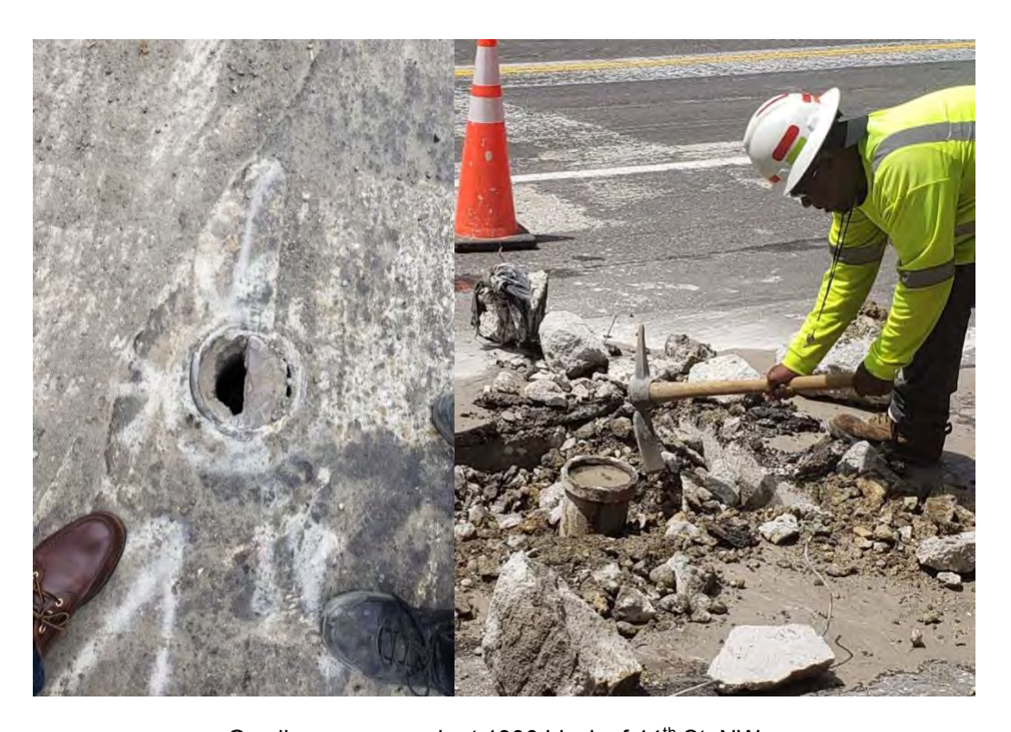
Gas line cover repair at 1300 block of 14th St. NW