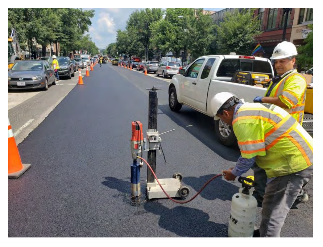
Geo-Tech Subcontractors collecting asphalt samples for testing