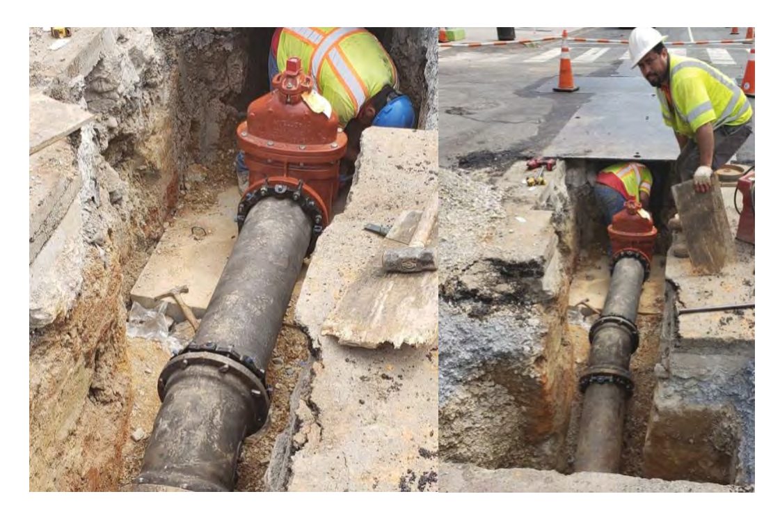
Watermain installation work at 14th St. NW & R St.