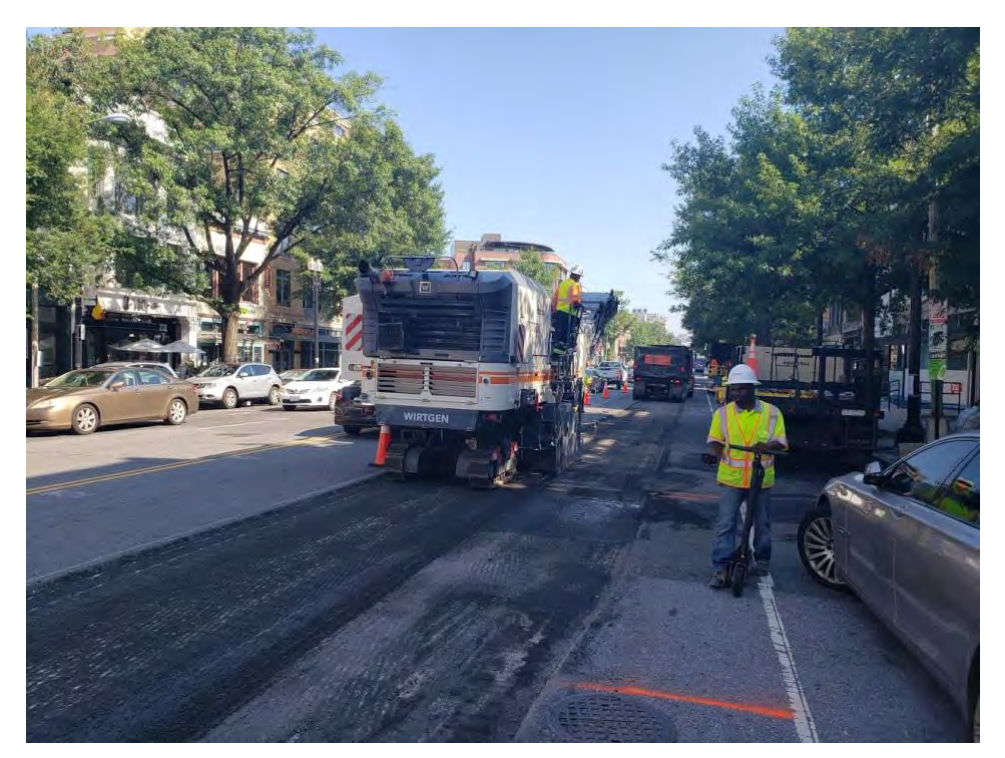
Milling operations on NB lane of 14th St going towards Rhode Island Ave.