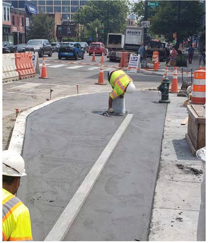
PCC finished work curb on 14 ^{\text{th}} St. & Swann St.