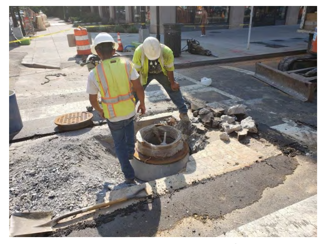
Adjusting manhole elevation to match finish grade at 14th St. & R St. NW