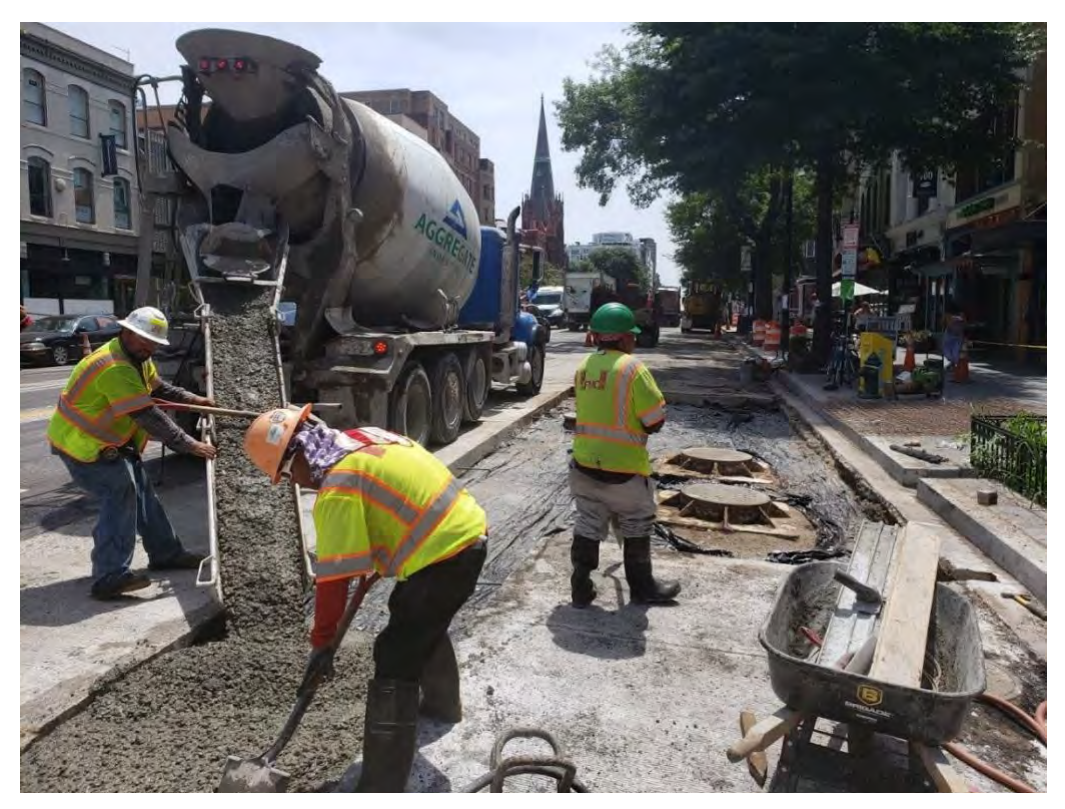
PCC pour on SB lane of 1300 block of 14th St. NW