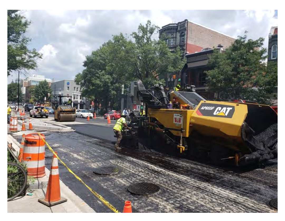
FMCC paving operations from Rhode Island Ave to N St. NW