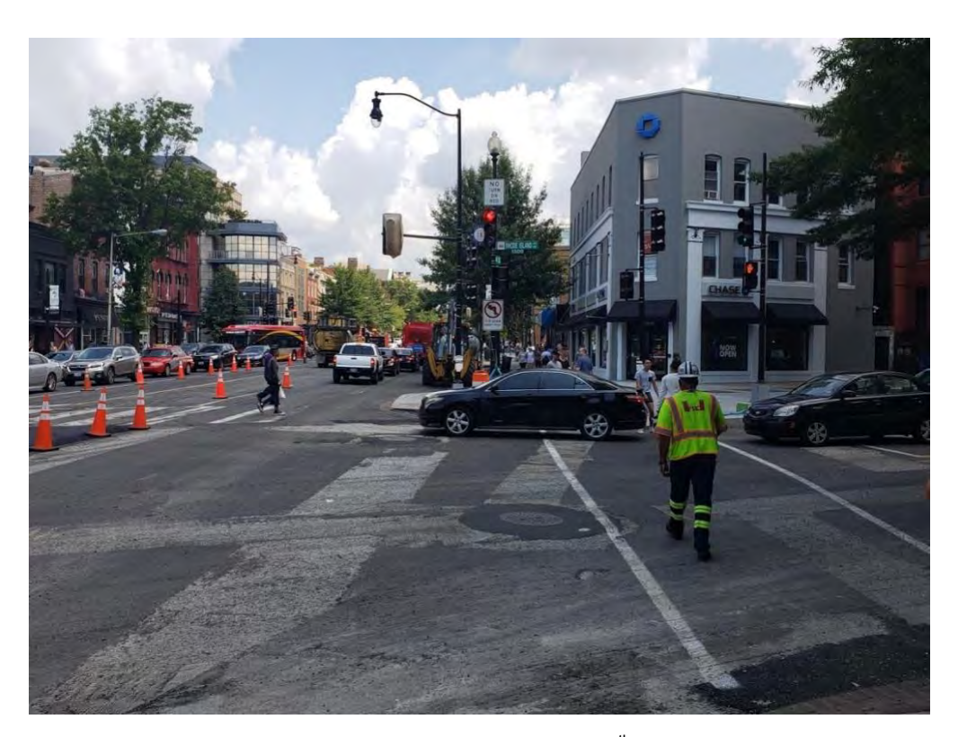
Access/Egress MOT established for pedestrians at 14th St. NW & Rhode Island Ave.